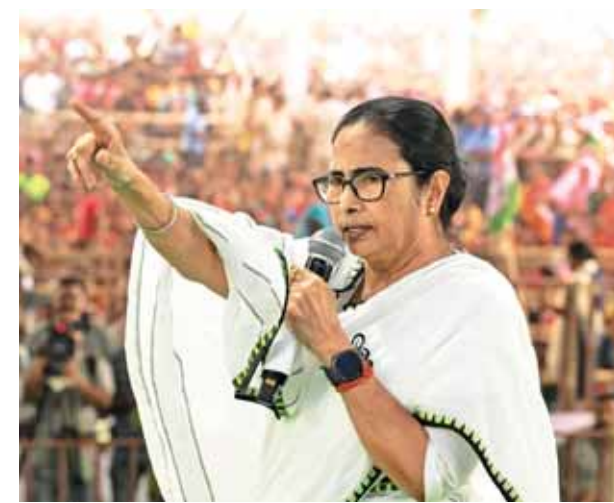
West Bengal Chief Minister Mamata Banerjee during an election campaign meeting for Lok Sabha polls, in North Dinajpur district

In a major blow to the Trinamool Congress in the midst of general elections the Calcutta High Court on Monday ordered the cancellation of appointments of 25,753 teachers and non-teaching staff made through the recruitment process of State Level Selection Test-2016 (SLST) in West Bengal Government-sponsored and aided schools, declaring the selection process as "null and void". The court directed the "illegal recruits" to return their emoluments drawn in the past several years within four weeks.