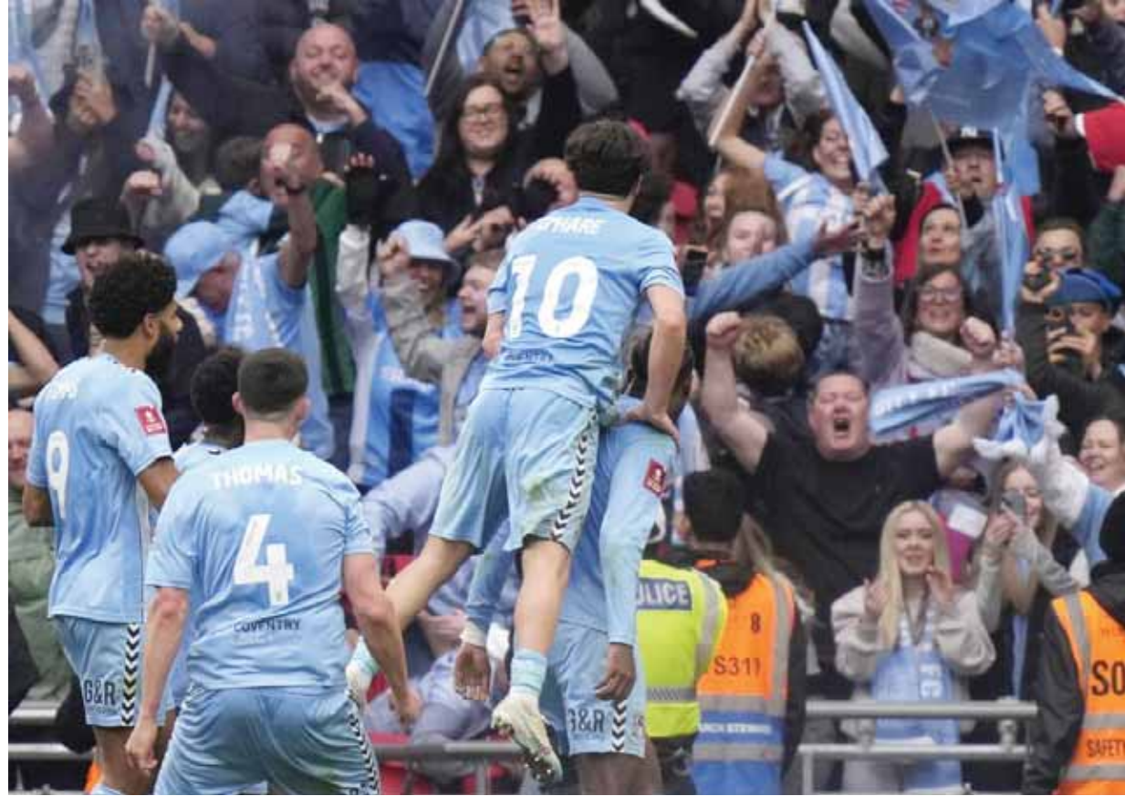
Aaron Wan-Bissaka. United had taken the lead in the 23rd through Scott McTominay and Harry Maguire then headed in the second from a corner. That lead soon looked insurmountable after Fernandes' shot took a deflection to sneak inside the near post for United's third. But no lead seems safe for this

It was another heartbreaking ending at Wembley for Coventry, which also lost on penalties to Luton in last year's Championship playoff final to miss out on promotion to the Premier League.