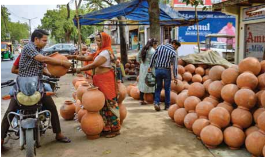
People purchase clay pots from a roadside shop during the summer season, in Agra