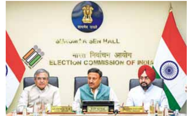
Chief Election Commissioner Rajiv Kumar with Election Commissioners Gyanesh Kumar and Sukhbir Singh Sandhu addresses the media in New Delhi on Monday