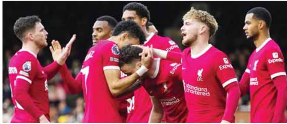
striking ability. First, he received the ball centrally and he delivered a first-time side-footed pass in behind Fulham full-back Antonee Robinson before Diaz's low cross to Jota was struck wide of the right-hand post. Then, after Joao Palhinha brought down Jota on the counterattack, Alexander-Arnold stood over the set-

as Liverpool joined Arsenal on 74 points - one more than defending champion Manchester City, which has a game in hand.