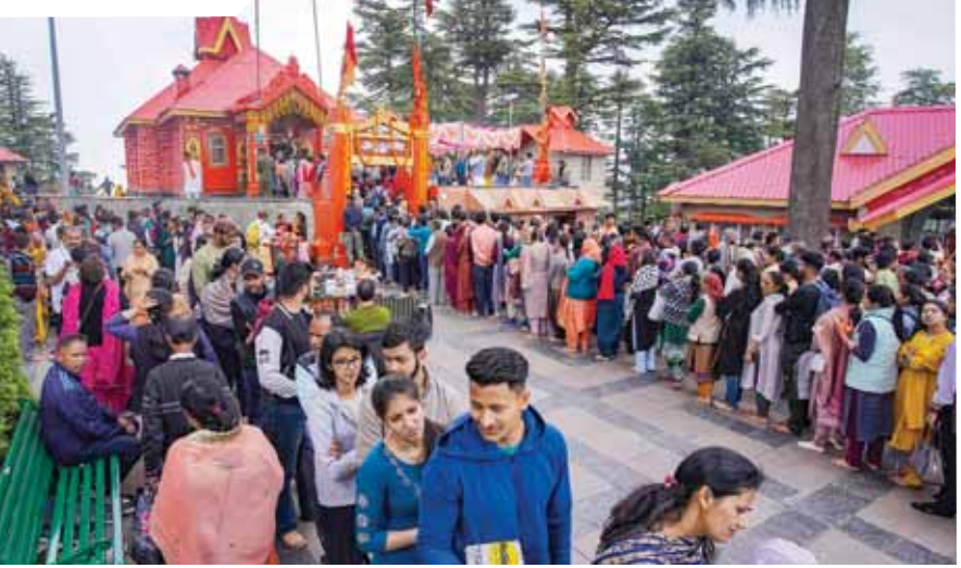
Devotees arrive at Jakhu temple to offer prayers on the occasion of 'Hanuman Jayanti', in Shimla