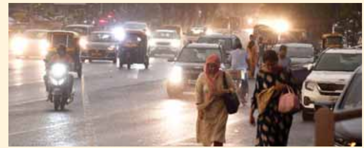
Gusty winds swept the national Capital as parts of Delhi received light rain on Tuesday, bringing respite to people