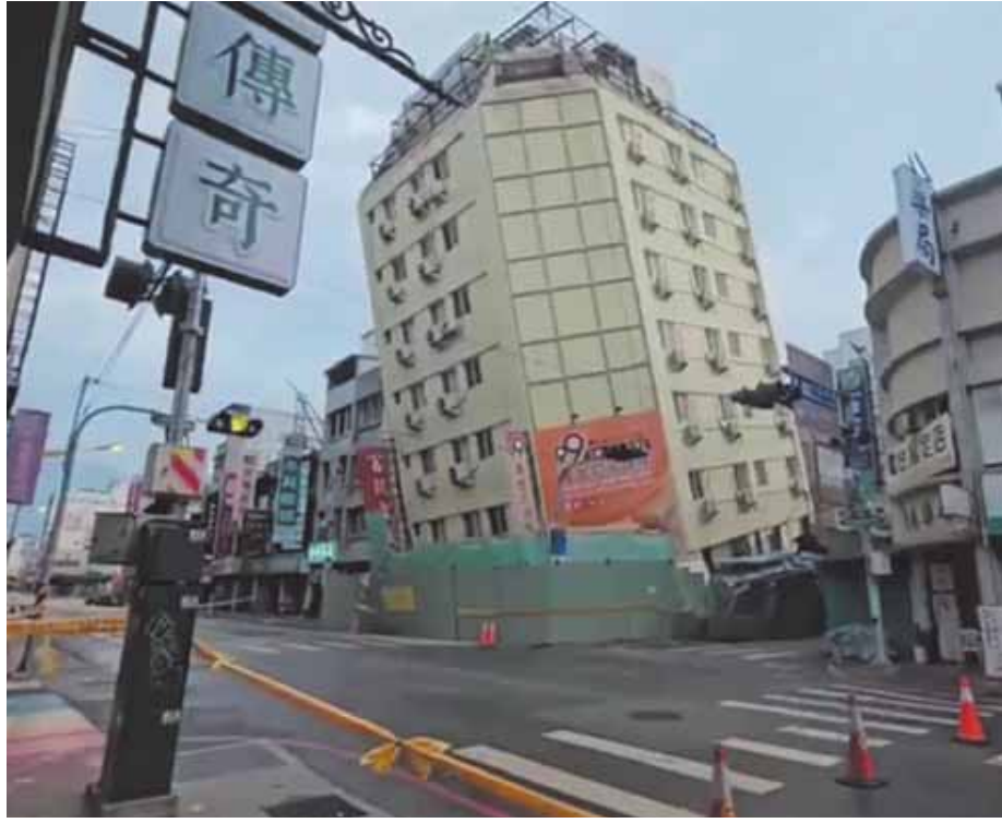
In this image from a video, roads in Hualien, Taiwan are cordoned off after a cluster of earthquakes struck the island early Tuesday.

being heavily damaged in the April 3 quake. Schools and offices in Hualien and the surrounding county were ordered closed on Tuesday as hundreds of aftershocks continued to strike on land and just off the coast in the Pacific Ocean, the vast majority below magnitude 3. Taiwan is no stranger to powerful earthquakes yet their toll