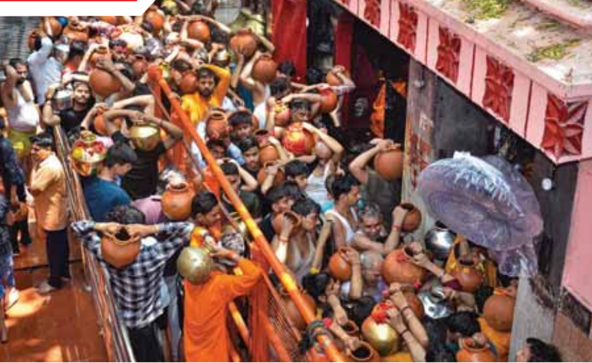
Devotees carrying holy water from Ganga river wait in queues to perform 'puja' at Vindhyachal Dham, in Mirzapur