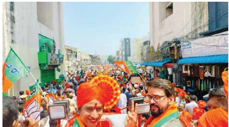
Union Information and Broadcasting Minister Anurag Thakur campaigning in a road show for the BJP Hyderabad Lok Sabha candidate on Wednesday.

interventions and innovation in service delivery," Wazed said. "On World Malaria Day 2024, we unite under the theme 'Accelerating the fight against malaria for a more equitable world,'" she said. This theme, which is in sync with this year's World Health Day theme -- "My Health, My Right" -- underscores the urgent need to address the stark inequities that persist in access to malaria prevention, detection and treatment services.