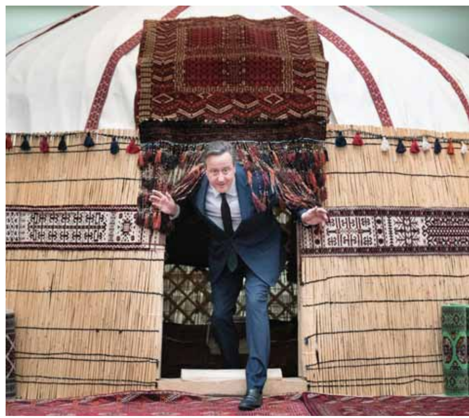
Foreign Secretary Lord David Cameron visits the National Carpet Museum in Ashgabat in Turkmenistan during his five day visit to Central Asia, on Wednesday.

They also advised her "gastroenterology review." The team remained at Bani Gala for at least 75 minutes to conduct the medical examination. Last week, a comprehensive medical evaluation of Bushra Bibi was performed under the observation of Khan's family physician, while the doctors at a private hospital declared Bushra Bibi, the former first lady, to be in good health. The former first lady stayed at a private hospital in Islamabad for six hours for diagnostic tests, including endoscopy, but refused to undergo a blood test and did not provide a blood sample, sources told Geo News.