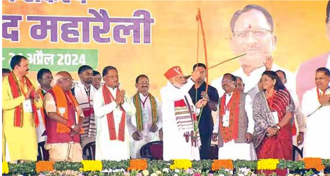
Prime Minister Narendra Modi during a public meeting for the Lok Sabha elections, in Surguja district, Chhattisgarh, on Wednesday

In his poll rallies, Modi framed Pitroda's comments in his wider onslaught against the Congress, asserting that they have exposed its hidden agenda and that the party has become so removed from the country's social and family values that it wants to legally rob people of their assets and lifelong savings they want to bequeath to their children. Pitroda had spoken about inheritance tax in the US while delving into the issue of