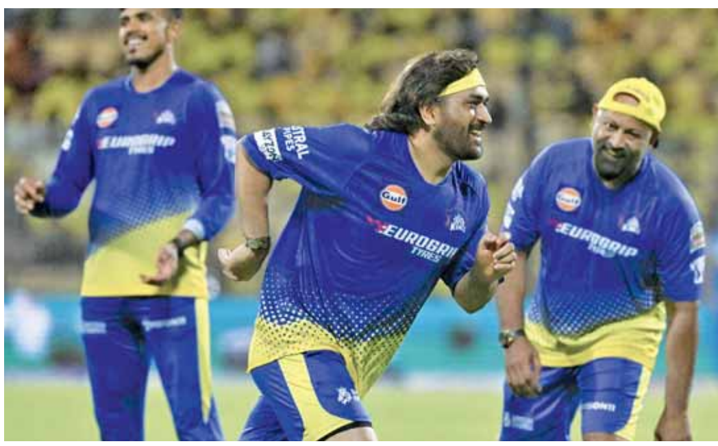
did not help them either. A high-flying SRH, on the other hand, were brought to the ground by RCB when they suffered only their third defeat of the season at home by 35 runs on Thursday. However, it is unlikely to deter the SRH batters who would fancy their chances against an inconsistent

Hyderabad, who have twice broken the record of the highest IPL total this season but are coming into the game following a failure of their ultra-aggressive batting approach against RCB. CSK's batting has hovered around skipper Gaikwad, who pulled off only his second IPL century the other day, and the in-form Shivam Dube, who once again impressed with yet another fifty. While Ravindra Jadeja too chipped in with the bat, the inconsistent form of top-order is a problem. Both Rachin Ravindra and Daryl Mitchell's lack of runs is a concern and it has forced CSK to shuffle their batting order. Considering their bowling, the hosts had to toil hard against LSG, given the unexpectedly huge amount of dew at Chepauk that took their spinners out of the game and the visitors made full advantage of it during their 213-run chase. While the CSK pacers managed to capture the four LSG wickets to fell, the spinners struggled to grip the ball, whereas the constant misfields