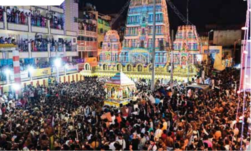
Veerakumars' gather to participate in the the Karaga festival at Sri Dharmarajana Swamy Temple, in Bengaluru