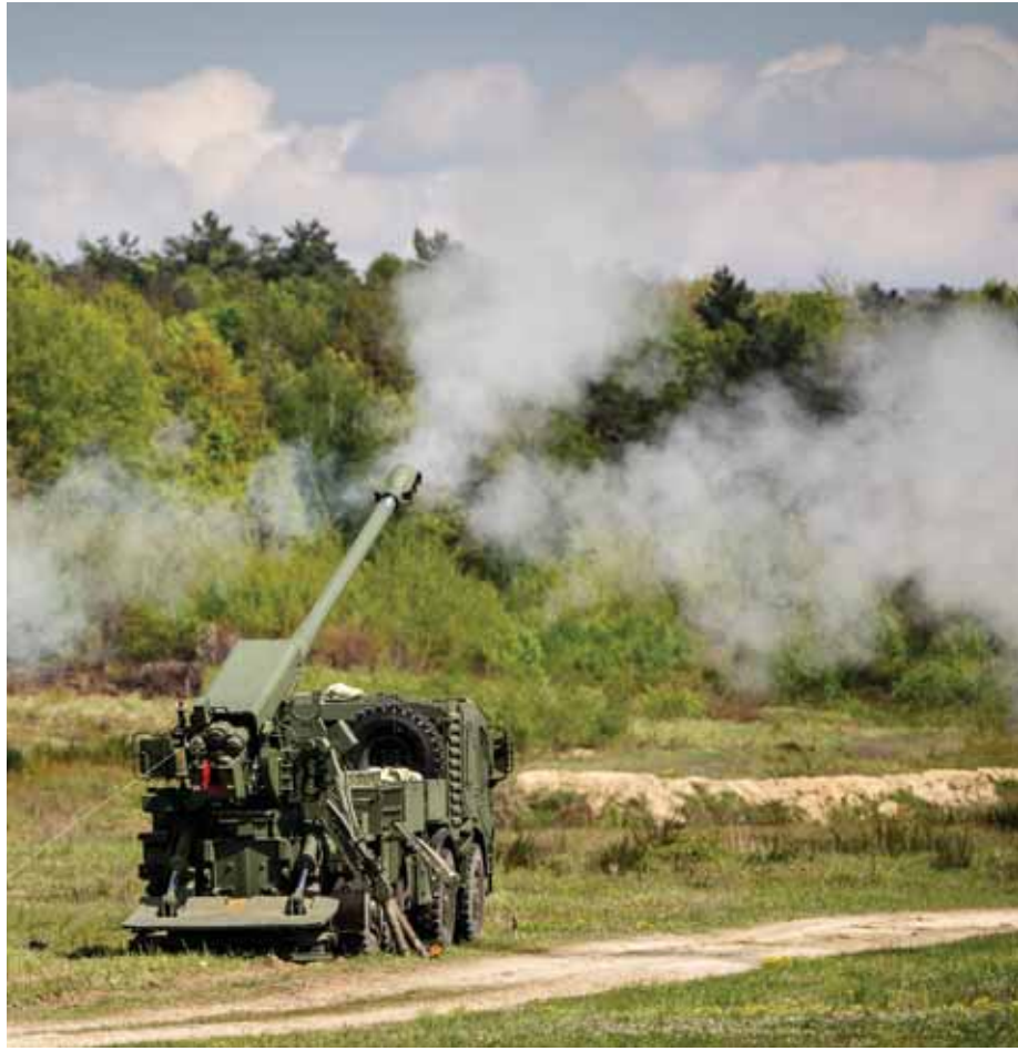
A Bohdana cannon fires in Lviv in Ukraine on Saturday. The Bohdana cannons are produced in Ukraine. Danish Foreign Minister Lars Løkke Rasmussen, Danish Defense Minister Troels Lund Poulsen and members of parliament met with Ukrainian colleagues during a visit to Lviv