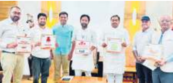
BJP State president Kishan Reddy, along with the members of the Forum for IT Employees, holding the poster

The Forum, besides sensitising the city voters, will reach out to voters in the IT companies, gated communi-