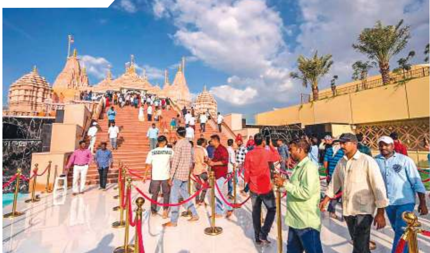
Devotees at BAPS Hindu Mandir, in Abu Dhabi