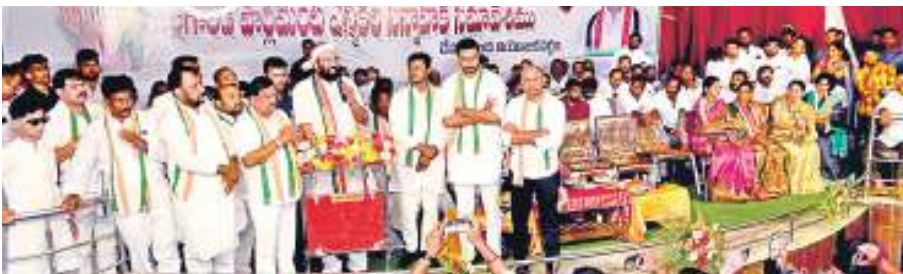
Irrigation Minister N Uttam Kumar Reddy participating in election meeting at Devarkonda under Nalgonda Lok Sabha constituency on Saturday

"During their 10-year rule, the BRS and the BJP neglected Telangana. Not a single promise made in the Andhra Pradesh