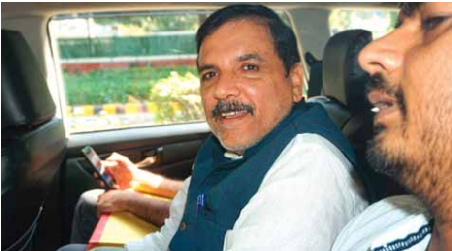
In this file photo, AAP MP Sanjay Singh being taken to the Rouse Avenue Court by the Enforcement Directorate officials in connection with the Delhi excise policy case, in New Delhi. Singh was on Tuesday granted bail in the case by the SC

The bench comprising Justices Sanjiv Khanna, Dipankar Datta and PB Varale passed the order to grant him bail, who has been in jail for six months, observing that no money has been recovered from his possession and there is no trace of it, while orally commenting that Singh would be entitled to indulge in