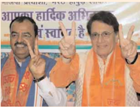
Arun Govil (right) with Deputy CM Keshav Prasad Maurya

Renowned actor Arun Govil, celebrated for his portrayal of the revered Lord Ram in the iconic TV series 'Ramayan', has ventured into the realm of politics by formally stepping into the electoral arena as the Bharatiya Janata Party (BJP) candidate for the Meerut Lok Sabha constituency. In a symbolic gesture marking his transition from the silver screen to the political stage, Govil filed nomination papers on Tuesday, flanked by Uttar Pradesh Deputy Chief Minister Keshav Prasad Maurya. Thousands of people who thronged the collectorate shouted the slogan 'Jai Sri Ram' as Govil, dressed in saffron, alighted from the open jeep. Expressing gratitude to the BJP leadership for the nomination, Govil acknowledged the overwhelming outpour of support from the public. "Today, I want to extend my heartfelt thanks to the BJP leadership for bestowing their trust upon me and for nominating me as the candidate from Meerut," said Govil. Maurya exuded confidence in Govil's candidacy, saying the BJP's is on firm footing in Uttar Pradesh. "Arun Govil has filed his nomination papers today.