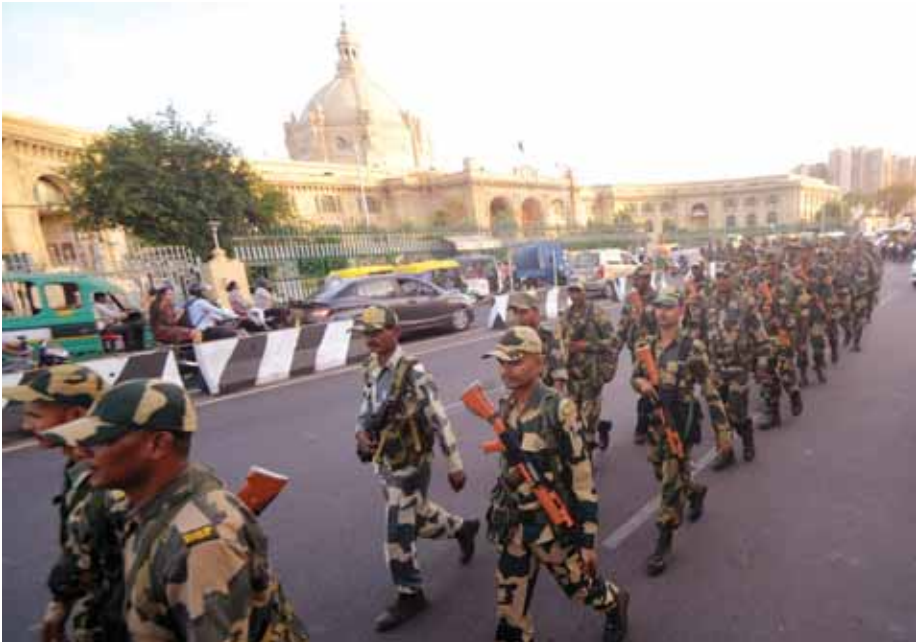
BSF personnel conducting a flag march in front of Vidhan Bhawan in Lucknow on Tuesday

5 KILLED IN COLLISION BETWEEN DUMPER TRUCK AND AUTORICKSHAW Meanwhile, a speeding dumper truck rammed an overloaded autorickshaw in Chitrakoot district on Tuesday, leaving five people dead and three others injured. According to police, the accident occurred on Tuesday morning and five people aboard the three-wheeler died on the spot while three others were grievously injured. Visuals showed the mangled remains of the autorickshaw which was completely crushed due to the impact of the collision. Other clips showed the mutilated bodies of the victims being removed from the site. Reports said that the victims were on their way to Chitrakoot when the accident occurred at the National Highway-35 (NH-35) near a