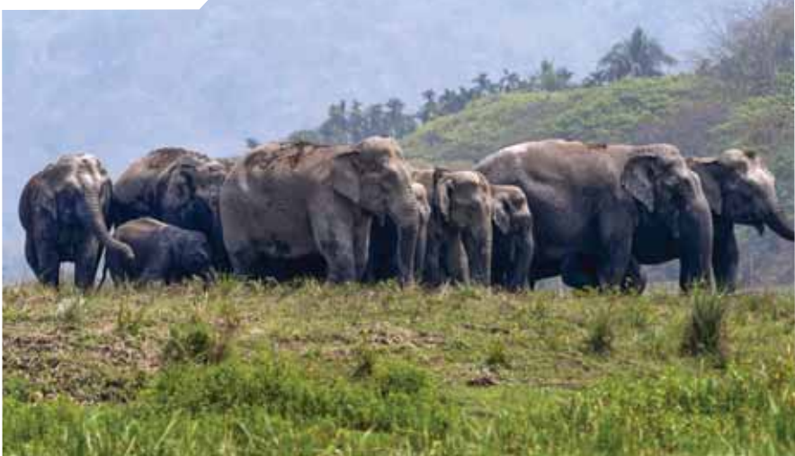
A herd of wild Asiatic elephants seen on the outskirts of Guwahati