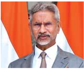
External Affairs Minister S Jaishankar

Responding to questions at a Press conference, External Affairs Minister S Jaishankar on Monday had said, "If today I change the name of your house, will it become mine? Arunachal Pradesh was, is and will always be a State of India. Changing names does not have an effect."