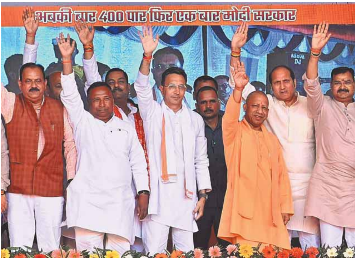
Chief Minister Yogi Adityanath at an intellectuals' meeting on Tuesday

The state has become riot-free, Adityanath said. "There is a complete control on curfew in the state. Kanwar Yatra is going on with much fanfare," the chief minister said, and added that India is working by better coordination between both its heritage and development. He also listed various welfare works accomplished in Pilibhit. By accepting all the proposals of medical college, road and bridge in Pilibhit, the government has worked to connect it with the new stream of development, he said. Not only this, the government is also working to promote Pilibhit as an excellent destination for eco-tourism. Electric fencing has been done around the farmers' land lying in the middle of the forest in the constituency to prevent human-wildlife conflict, he said. "This time this election is going to be between 'family first' versus 'nation first' and 'mafia raj' versus 'law and order'. Be it the SP or the Congress, the president of their party can be a person from only one family, whereas Prime Minister Narendra Modi is going to dedicate his entire life to the country after coming from an ordinary poor family. For him, 140 crore Indians are his family," he said.