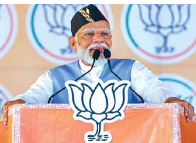
Prime Minister Narendra Modi addresses a public rally ahead of upcoming Lok Sabha elections in Udham Singh Nagar district in Uttarakhand, on Tuesday

"The Congress, with its Emergency-mindset, no longer has faith in democracy. Therefore, it is busy instigating