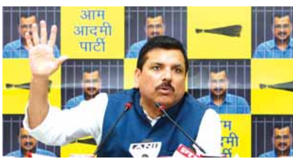
AAP leader Sanjay Singh addresses a Press conference in New Delhi on Saturday