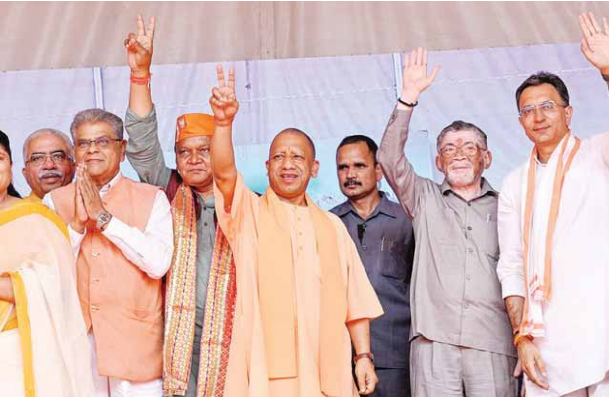
Chief Minister Yogi Adityanath during an election rally with BJP candidate Jitin Prasada (extreme right) and others in Pilibhit on Saturday

Yogi recounted the tragic 1980 Moradabad riot in which numerous lives were lost. He noted that details of this incident remained suppressed until 2017, when his investigation exposed the individuals behind the violence. Yogi went on to say, "Innocent traders, Hindus and Sikhs were killed as a result of the violence, and no one was held accountable. There was an anti-Sikh riot in Saharanpur in 2016, but the rioters are now hiding and begging for their lives. The BJP has given a model of development and good governance. Today there is no curfew, no riot in UP, everything is fine here. Curfew has been replaced by kanwar yatra." Addressing a public meeting in Haldwani, Chief Minister Yogi Adityanath said that the tenure of Narendra Modi as India's prime minister would be viewed as the golden period of India post-Independence. He criticised the Congress, asserting that the party is the root cause of India's problems, whereas Prime Minister Modi has addressed and resolved the issues of the nation. Continuing his criticism of the Congress, he said, "Congress is in deep anguish due to the implementation of the Uniform Civil Code in Uttarakhand, which should actually be embraced." Yogi highlighted that Uttar Pradesh is progressing towards becoming 'Uttam Pradesh', thanks to the water from rivers originating from Uttarakhand. He added: "The BJP does not create problems; rather, it solves them. In contrast, Congress has been synonymous with problems through-