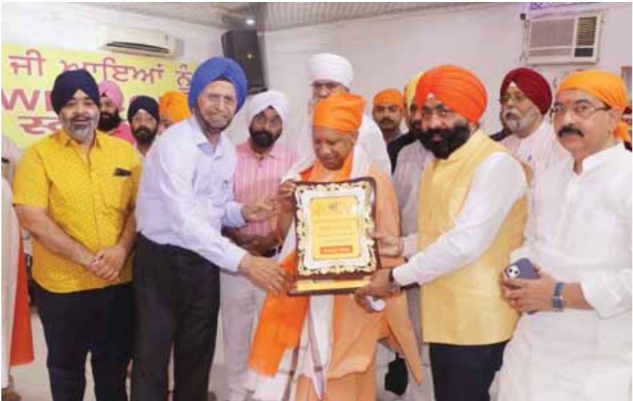
Chief Minister presented a memento at the Naka Hindola Gurdwara on the occasion of Baisakhi on Saturday