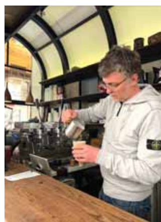
A local coffee maker

unearthed gems like Bean by Workshop Bros, discreetly marked by a modest overhead sign, and Industry Beans, celebrated for its trendy ambiance and revered for concocting velvety Aussie Flat Whites. In her relentless pursuit of culinary marvels, she unveils these well-kept secrets, enriching our expedition with tantalizing discoveries at every turn.