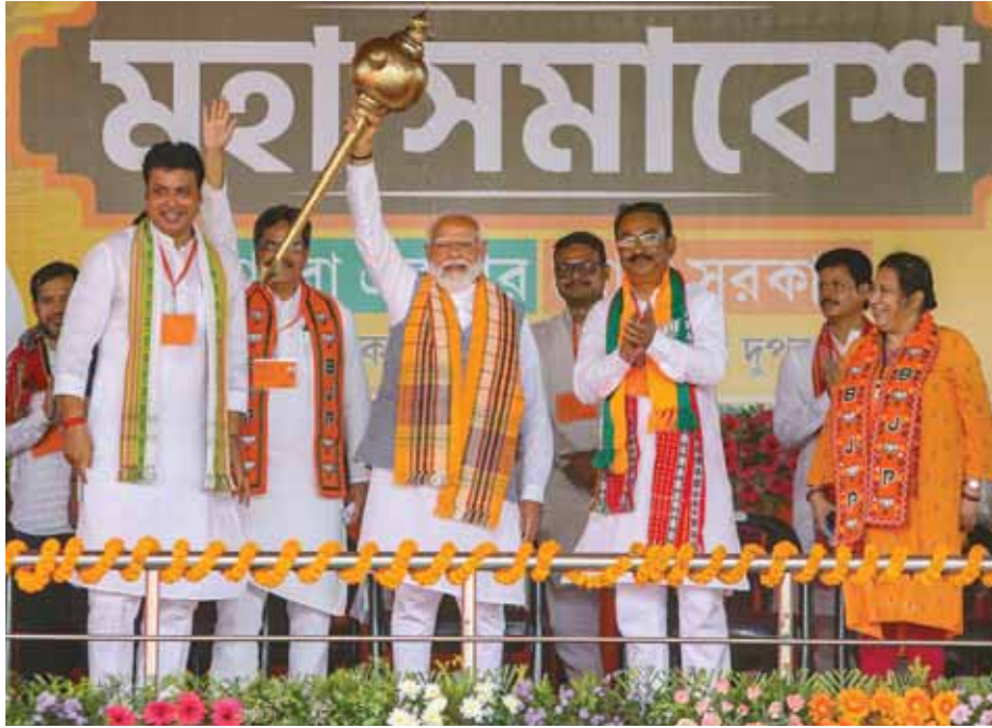
Prime Minister Narendra Modi being felicitated by Tripura Chief Minister Manik Saha, BJP candidate and former Chief Minister Biplab Kumar Deb and others during a public meeting ahead of the Lok Sabha elections in Agartala on Wednesday

Prime Minister Narendra Modi on Wednesday slammed the Congress, saying the party had adopted the 'loot' east policy while the BJP had turned it into the 'Act East' policy.