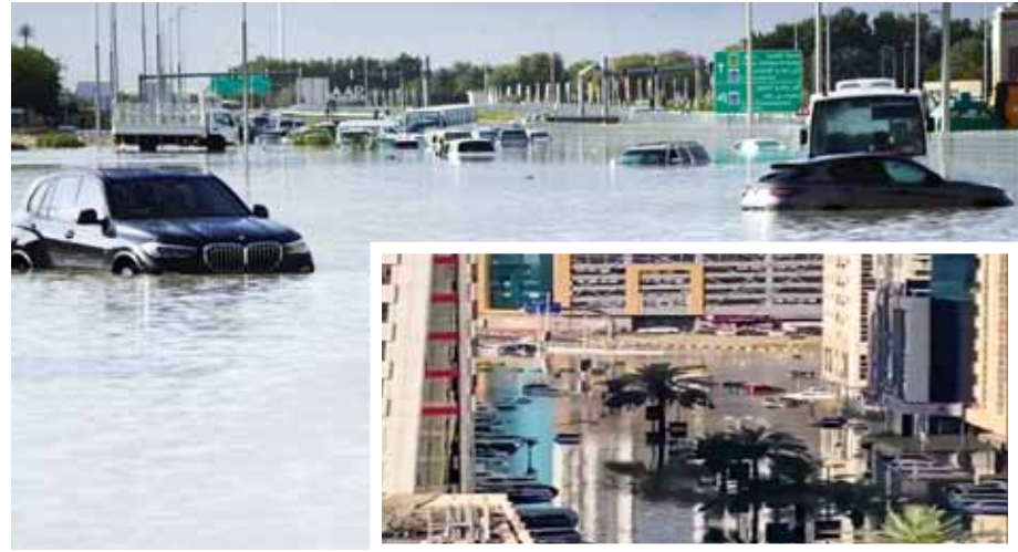
Vehicles sit abandoned in floodwater covering a major road in Dubai, United Arab Emirates, on Wednesday. Heavy thunderstorms lashed the United Arab Emirates on Tuesday, dumping over a year and a half's worth of rain on the desert city-State of Dubai in the span of hours as it flooded out portions of major highways and its international airport