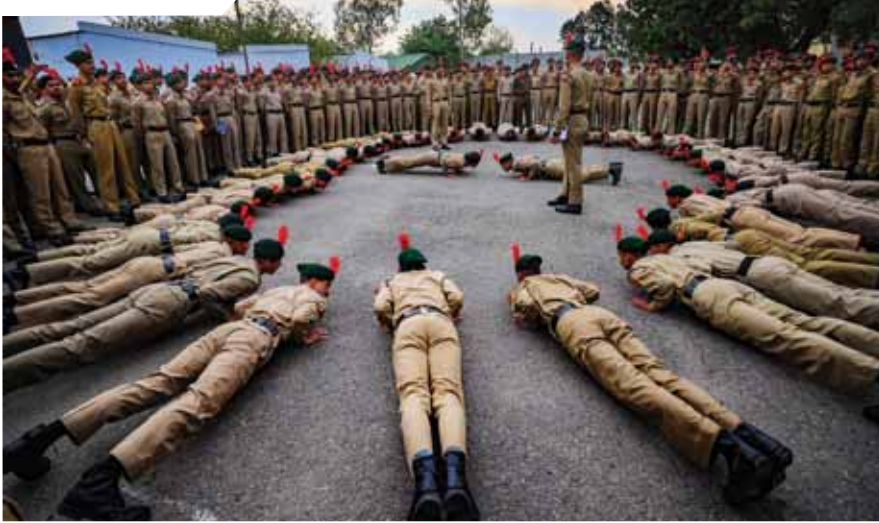
National Cadet Corps perform a drill during their 10-day summer season camp at Nagrota, in Jammu