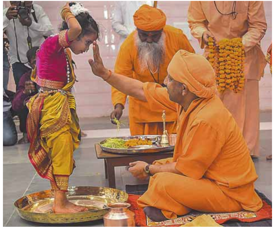
Chief Minister Yogi Adityanath performing kanya puja in Gorakhpur on Wednesday

'roli' (red powder), 'chandani' (sandalwood), and rice grains on the foreheads of the nine girls. He then sought their blessings by offering them 'chunari' and 'dakshina'.