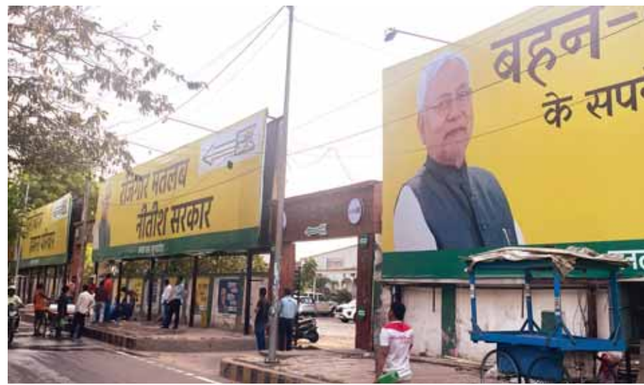
Usually a hub of political activity during elections, this is the scene outside the Janata Dal (U) head office in Patna on Wednesday

fervour, it is comprehensible that the BJP and the RJD will have a close finish against each other. The June 4 poll result may highlight any political misstep by the BJP in realigning with JD(U), as its tallest leader's popularity is waning. They also said that Nitish would be able save his skin a bit just in the name of the BJP led by Prime Minister Narendra Modi. "Am certain not only Nitish but his party JD(U) too, due to severe internal factionalism pre- and post-Lalan Singh era, is affected. The cadre is facing difficulties in explaining the voters of Bihar due to the lone instance of repeated flip-flops by a sitting Chief Minister in the history of Indian politics. Biharis don't like to be tagged as 'paltu', a more derogatory term than the old 'aayaa Ram, gayaa Ram'. But I have got feedback that people of the State