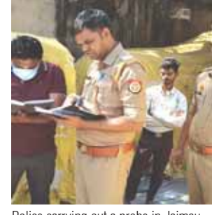
Police carrying out a probe in Jajmau.