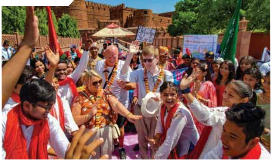
Foreign tourists during celebrations of World Heritage Day at the Agra Fort, in Agra