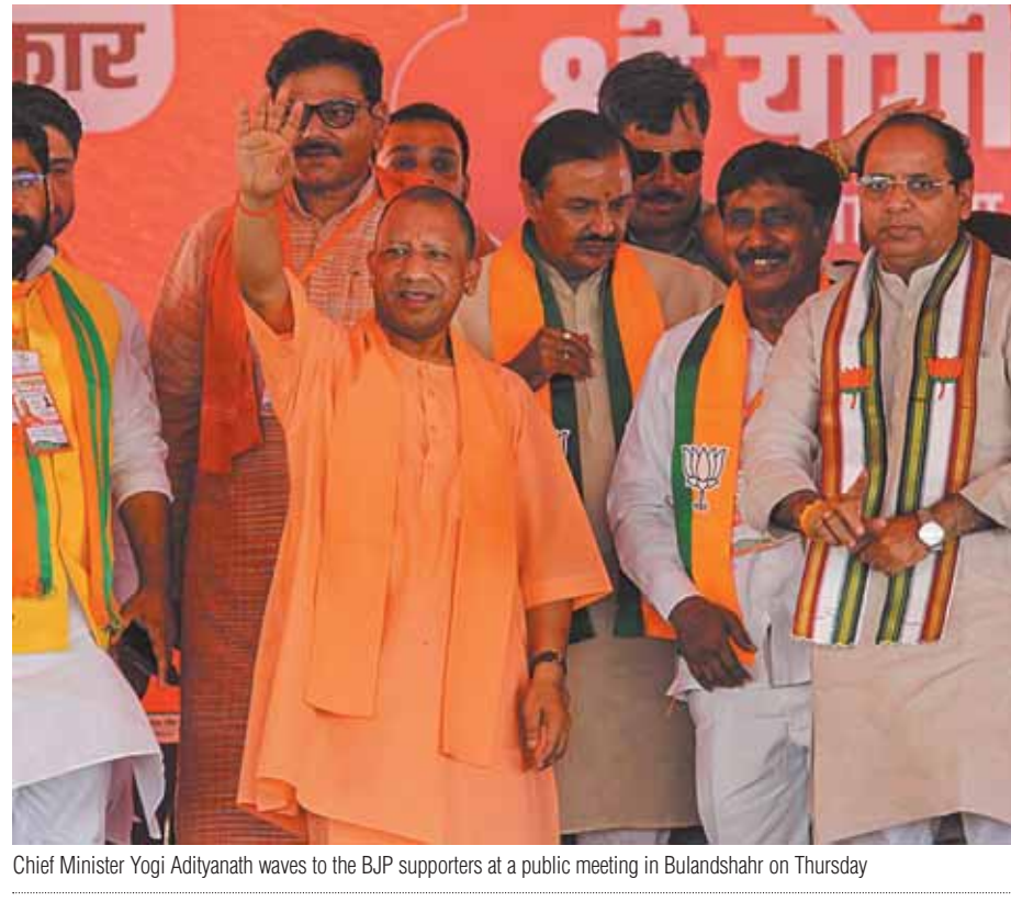
Chief Minister Yogi Adityanath waves to the BJP supporters at a public meeting in Bulandshahr on Thursday

Chief Minister Yogi Adityanath, on Thursday, accused the Samajwadi Party, Bahujan Samaj Party and Congress of following a 'danga (riot) policy', and said that the policy of the National Democratic Alliance government was that of development, which was in sharp contrast to the opposition's policy. Speaking at a public meeting in Secunderabad, Bulandshahr, the chief minister emphasised, "The BJP stands for faith, security and prosperity. Under the governance of SP, BSP and Congress, the state frequently saw curfews lasting for months. However, now there are no curfews in the state. These parties were known for stirring unrest through riots. They adopted a 'riot policy', while we prioritise 'development policy'." Chief Minister Yogi urged the public to vote for Dr Mahesh Sharma, Member of Parliament and the BJP candidate from Gautam Buddha Nagar. Many leaders of the SP also joined the BJP on the occasion.