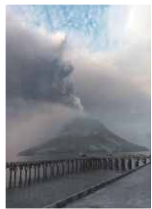
miles) from the 725-metre (2,378 foot) mountain. More than 11,000 people live in the affected area and were told to leave. At least 800 have done so.

Indonesian authorities closed an airport and residents left homes near an erupting volcano Thursday due to the dangers of spreading ash, falling rocks, hot volcanic clouds and the possibility of a tsunami. Mount Ruang on the northern side of Sulawesi Island had at least five large eruptions Wednesday, causing the Centre for Volcanology and Geological Disaster Mitigation to issue its highest level alert, indicating an active eruption. The crater emitted white-gray smoke continuously during the day Thursday, reaching more than 500 metres (1,640 feet) above the peak. People have been ordered to stay at least 6 kilometres (3.7