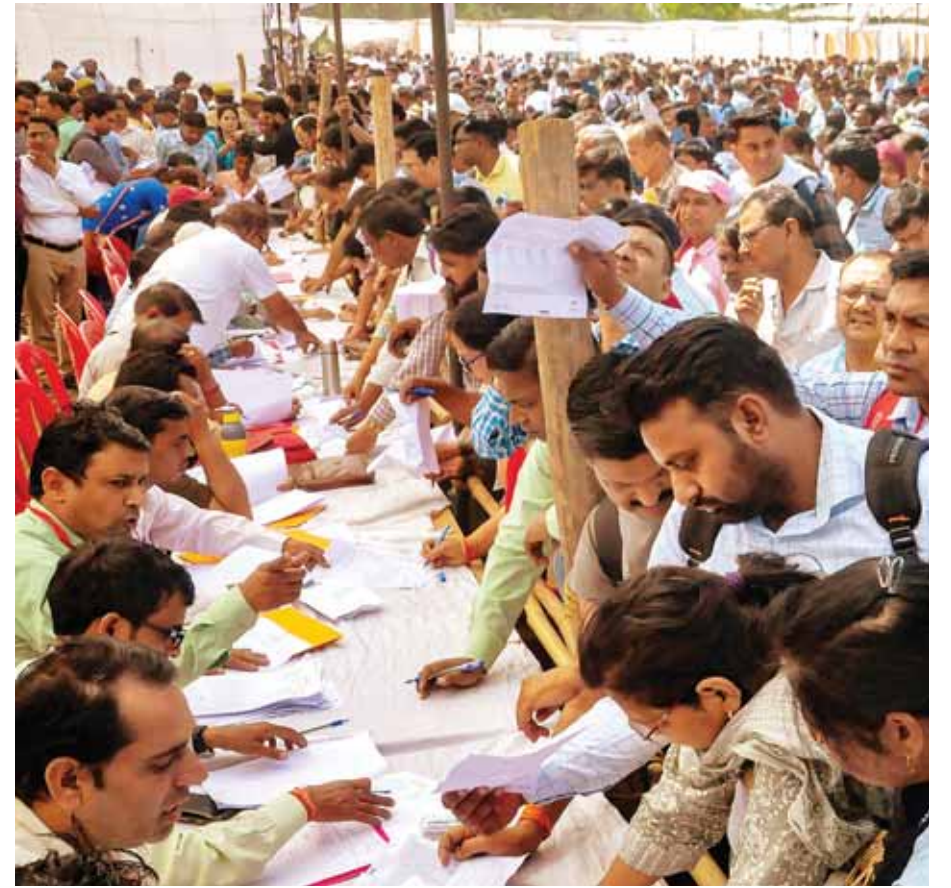
Polling officials collect EVMs and other election material at a distribution centre ahead of the first phase of voting for Lok Sabha elections, in Moradabad on Thursday

Nagina and Rampur. The Bharatiya Janata Party has joined hands with the Rashtriya Lok Dal while the Samajwadi Party has allied with the Congress for the election. The Bahujan Samaj Party has decided to go solo. In the 2014 Lok Sabha elections, the BJP swept all eight seats slated for the first phase of voting, contributing to its impressive tally of 71 seats, which rose to 73 in alliance with the Apna Dal (Sonelal). However, the 2019 elections saw a shift in the political landscape, with the BJP facing setbacks against the grand alliance of SP, RLD and BSP. Out of the eight seats it won in 2014, the BJP could secure only three in 2019, marking a significant decline from its previous dominance. This loss of momentum resulted in the BJP winning 62 seats overall, a decrease of nine from the 2014 elections, as SP and BSP made significant gains in Purvanchal. The SP-BSP alliance secured victory in five out of the eight seats contested in the first phase of the 2019 elections.