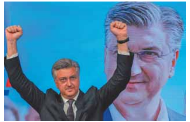
Prime Minister incumbent Andrej Plenkovic waves after claiming victory in a parliamentary election in Zagreb, Croatia on Thursday

Croatia's ruling conservatives said Thursday that talks have already started about the formation of a new governing majority following a highly contested parliamentary election that saw a far-right party emerge as a potential kingmaker. Prime Minister Andrej Plenkovic, who is the leader of the Croatian Democratic Union party, or HDZ, said that the party has contacted some of the potential future partners and more talks will take place on Thursday. Preliminary results of the vote on Wednesday showed that Plenkovic's HDZ won 61 seats in the 151-seat parliament, which means the party has to form a coalition government to stay in power. The main opponent, center-left Social Democratic Party, backed by President Zoran Milanovic, got 42 seats while the far-right Homeland Movement was third, with 14 seats, according to the