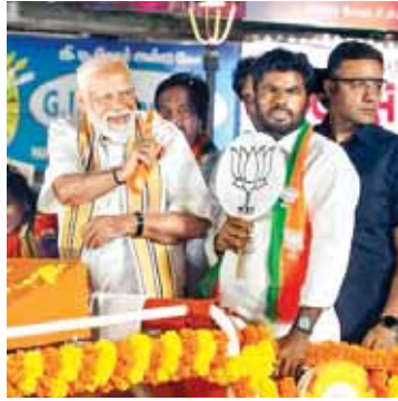
The Indian National Congress, CPI(M), CPI, and caste and community outfits like DMK,

Tamil Nadu and the Union Territory of Puducherry are set to witness one of the toughest electoral battles of recent times as both the State and the UT go to the polls to elect 40 representatives (39 from TN and a lone member from the UT) on Friday. What Tamil Nadu witnessed once the Election Commission of India announced the poll schedule was a gruelling campaign despite the scorching heat of the summer. There are three fronts vying with one another for the top honours. The main contender (at least on paper) is the DMK and its allies that include