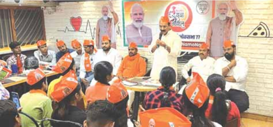
BJP holding a 'Namo Yuva Chaupal' in Chetganj area in Varanasi on Saturday.