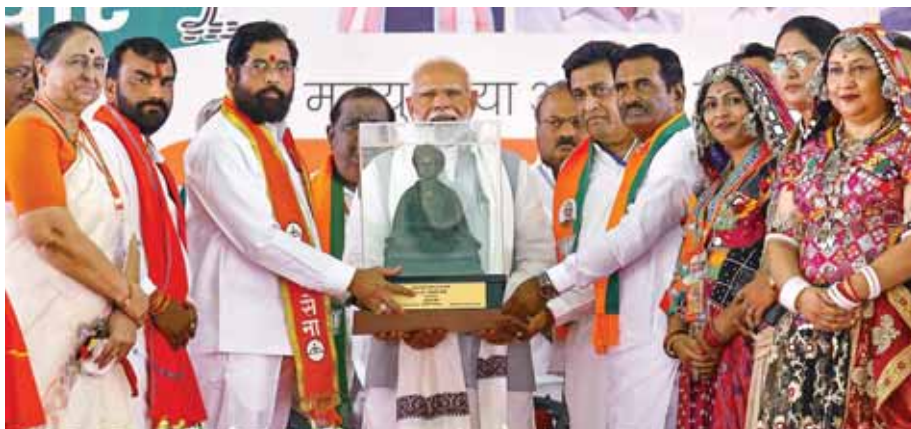
Nanded: Prime Minister Narendra Modi with Maharashtra Chief Minister Eknath Shinde during a rally for Lok Sabha polls, in Nanded, on Saturday

Modi said that the infighting was on within the Opposition INDIA bloc over the 25 per cent seats. "Come June 4, the INDIA alliance leaders will tear the clothes and hair of one another. Do you want to waste your votes on these leaders? That's why you should vote for the NDA. Voting for NDA is