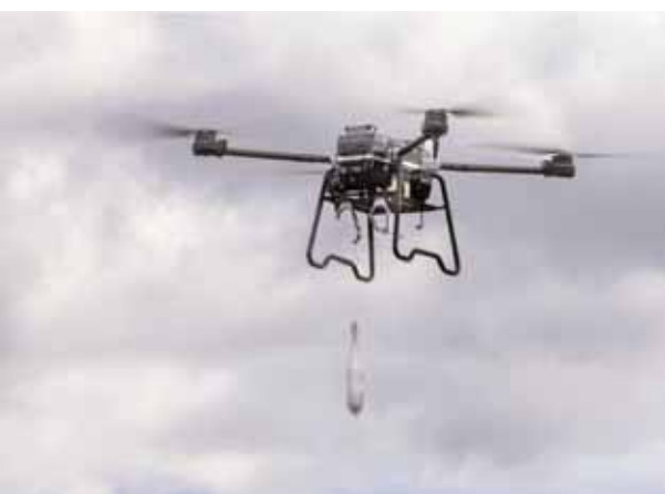
This photo released by the Russian Defense Ministry Press Service Saturday, April 20, 2024, shows an unmanned aerial vehicle drop a dummy bomb during its flight as Russian Defense Minister Sergei Shoigu visits the training ground of the Moscow Military District to check the implementation of instructions for the development of unmanned aerial vehicles and small arms, taking into account the experience of a special military operation, in Russia

Ukraine launched a barrage of drones across Russia overnight, the Defence Ministry in Moscow said Saturday, in attacks that appeared to target the country's energy infrastructure. Fifty drones were shot down by air defences over eight Russian regions, including 26 over the country's western Belgorod region close to the Ukrainian border. Two people — a woman with a broken leg and the man caring for her — died during the overnight barrage, after explosions sparked a blaze that set their home alight, Belgorod Gov. Vyacheslav Gladkov wrote on social media. A pregnant woman and her unborn child were also killed in shelling later Saturday, he said. Drones were also reportedly destroyed over the Bryansk, Kursk, Tula, Smolensk, Ryazan, Kaluga regions across Russia's west and south, as well as in the Moscow region. Russia's Defence Ministry said that it had shot down a Ukrainian Sukhoi Su-25 fighter jet. It provided no details and the claims could not be independently verified. Ukrainian officials normally decline to comment about attacks on Russian soil. However, many of the drone strikes appeared to be directed