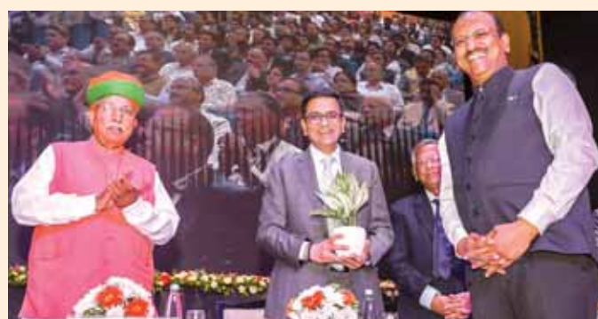
Chief Justice of India D.Y. Chandrachud and Union Minister of Law & Justice Arjun Ram Meghwal during the inauguration of a conference on 'India's New Criminal Justice System - A Progressive Step' organised by the Ministry of Law and Justice, at the Ambedkar International Centre, in New Delhi, on Saturday