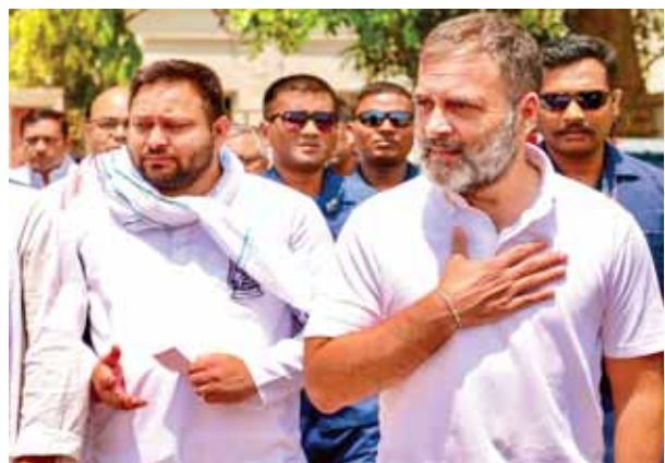
Bhagalpur: Congress leader Rahul Gandhi and RJD leader Tejashwi Yadav during an election campaign rally ahead of Lok Sabha polls, in Bhagalpur