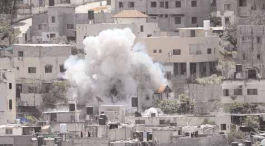
Smoke rises from an explosion during an Israeli military raid in the Nur Shams refugee camp, near the West Bank town of Tulkarem, on Saturday, April 20, 2024