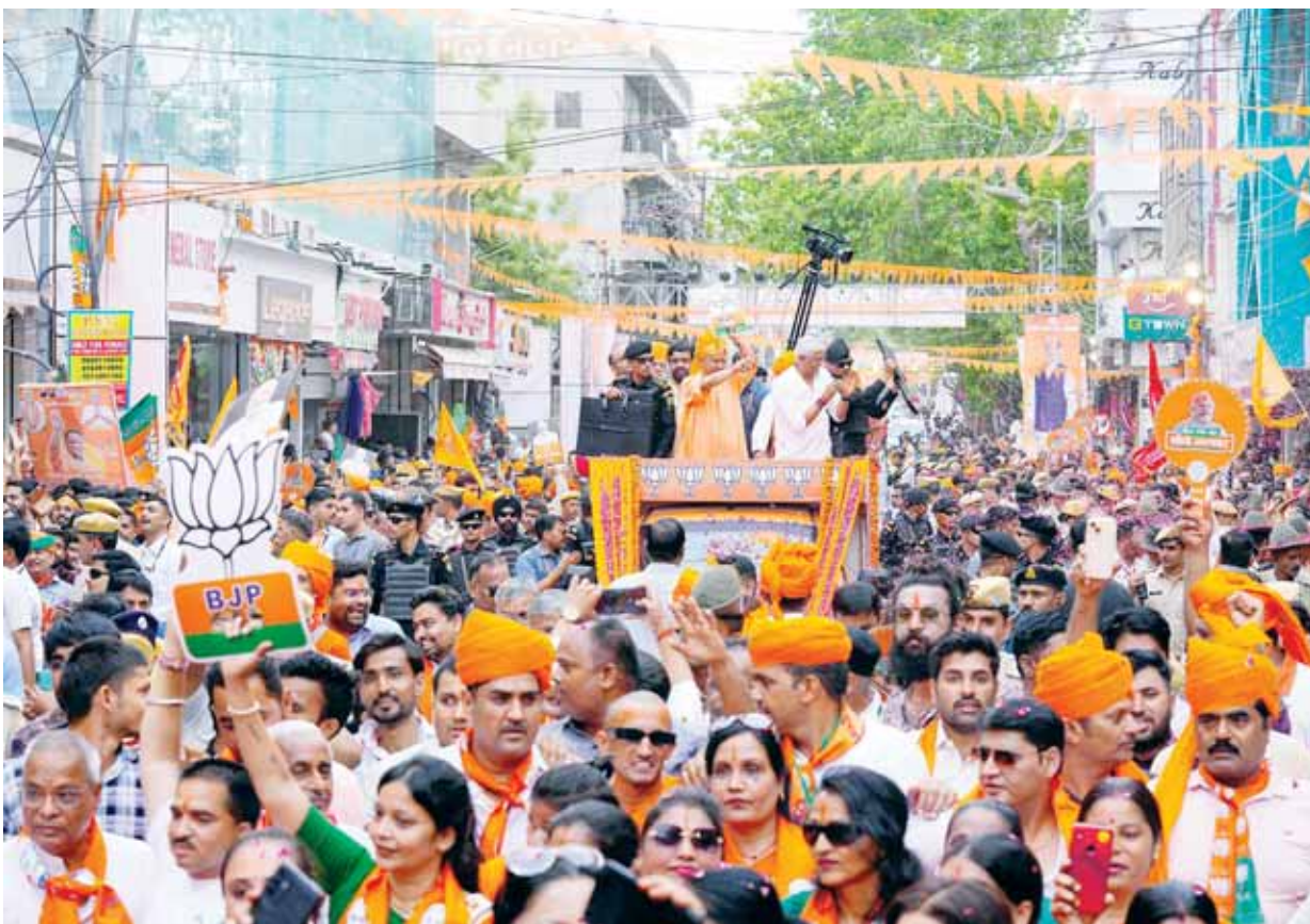
Uttar Pradesh Chief Minister Yogi Adityanath waves to supporters during a roadshow in Rajasthan on Saturday