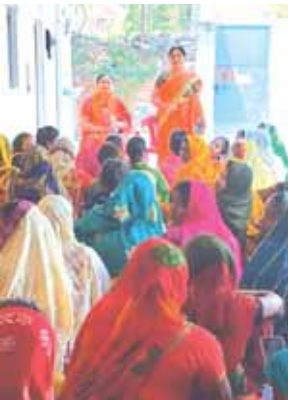
'Nari Shakti Chaupal' being held at Bhikharipur in Varanasi on Friday.