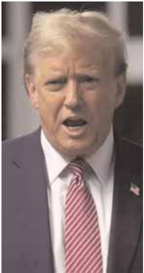
Former President Donald Trump speaks with the media following proceedings in his trial, at Manhattan Criminal Court in New York on Friday

A man who doused himself in an accelerant and set himself on fire outside the courthouse where former President Donald Trump is on trial has died, police said. The New York City Police Department said the man was declared dead by staff at an area hospital. The man was in Collect Pond Park around 1:30 pm Friday when he took out pamphlets espousing conspiracy theories, tossed them around, then doused himself in an accelerant and set himself on fire, officials and witnesses said. A large number of police officers were nearby when it happened. Some officers and bystanders rushed to the aid of the man, who was hospitalised in critical condition. The man, who police said had travelled from Florida to New York in the last few days, hadn't breached any security checkpoints to get into the park. The park outside the courthouse has been a gathering spot for protesters, journalists and gawkers throughout Trump's trial, which began with jury selection Monday. Through Friday, the streets and sidewalks in the area around the courthouse were generally wide open and crowds have been small and largely orderly. Authorities said