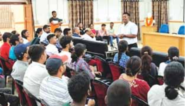
A workshop on out of the box career being held at BHU in Varanasi on Friday.