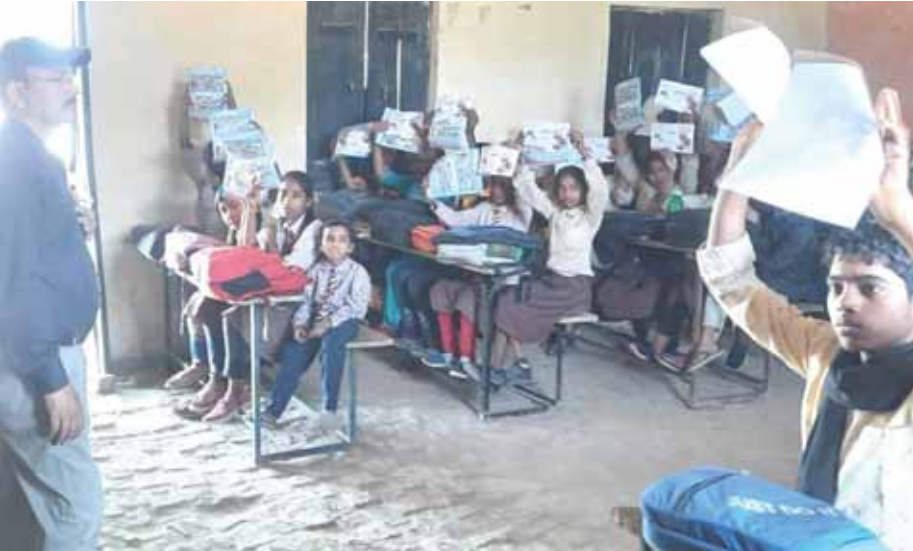
Children of a school being informed about safety at level crossings by Varanasi Division of NER on Friday.