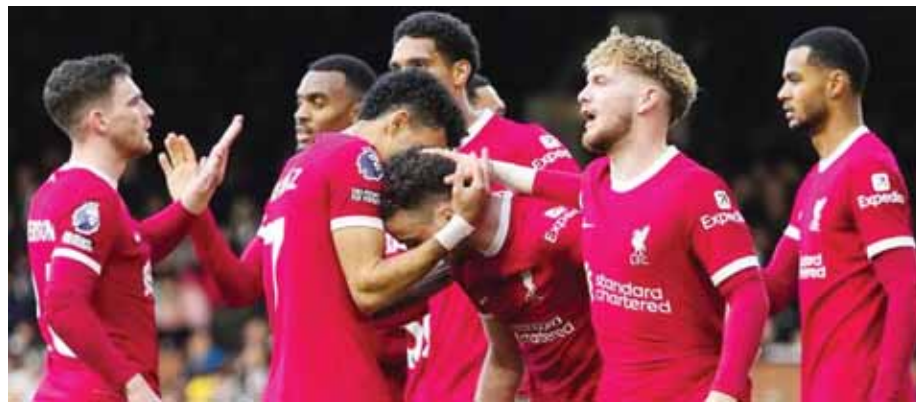
striking ability. First, he received the ball centrally and he delivered a first-time side-footed pass in behind Fulham full-back Antonee Robinson before Diaz's low cross to Jota was struck wide of the right-hand post. Then, after Joao Palhinha brought down Jota on the counterattack, Alexander-Arnold stood over the set-

as Liverpool joined Arsenal on 74 points - one more than defending champion Manchester City, which has a game in hand. Fulham academy graduate Harvey Elliott, who swapped London for Merseyside in 2019, was galvanized by jeers from the home fans as he helped his side create the first chance of the match. The attacking midfielder player instinctively picked out Alexander-Arnold, whose cross could not be directed in by Luis Diaz's glancing header as the ball narrowly missed the inside of the post. Alexander-Arnold then showed off his elite ball-