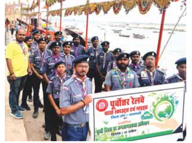
Scouts and Guides launching a campaign at Dashashwamedh Ghat on World Earth Day in Varanasi on Monday.

North Eastern Railway (NER) Bharat Scouts staged a