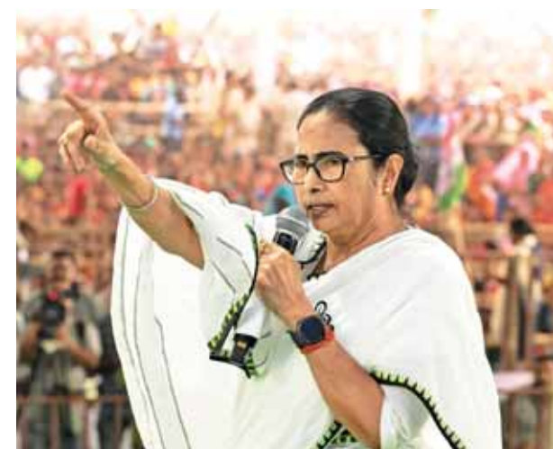
West Bengal Chief Minister Mamata Banerjee during an election campaign meeting for Lok Sabha polls, in North Dinajpur district.

In a major blow to the Trinamool Congress in the midst of general elections the Calcutta High Court on Monday ordered the cancellation of appointments of 25,753 teachers and non-teaching staff made through the recruitment process of State Level Selection Test-2016 (SLST) in West Bengal Government-sponsored and aided schools, declaring the selection process as "null and void". The court directed the "illegal recruits" to return their emoluments drawn in the past several years within four weeks.