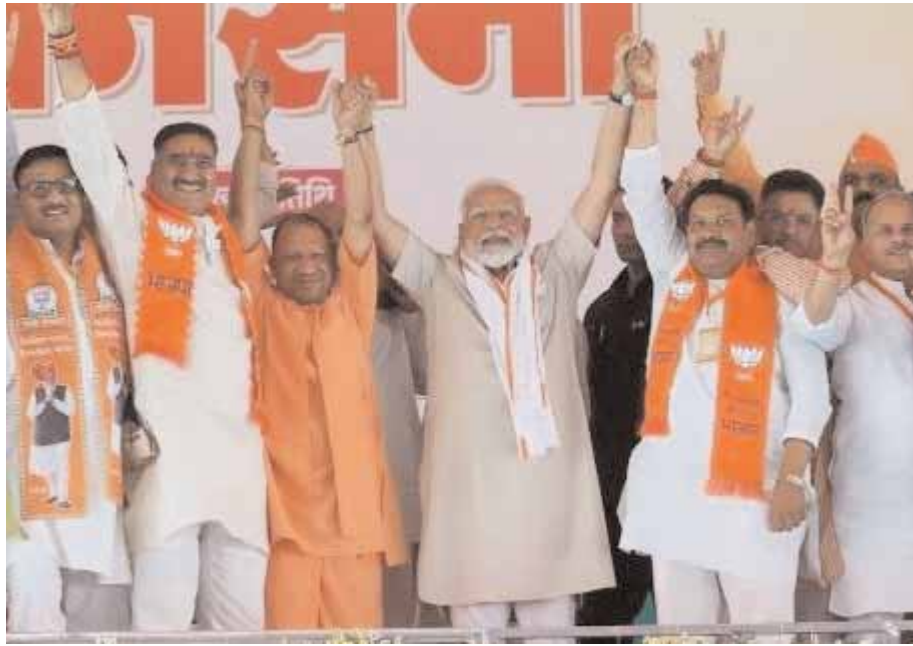
PM Narendra Modi with CM Yogi Adityanath and others in Aligarh on Monday

nity. During a discourse on welfare programmes, the prime minister lashed out at the Congress and SP for neglecting the concerns of the populace. Specifically addressing the issue of inadequate ration distribution despite payments, he highlighted the prevalent exploitation by middlemen. Contrastingly, the prime minister asserted that current initiatives have provided relief to numerous residents of Aligarh and Hathras, who now benefit from free ration distribution. Additionally, he pointed out the accessibility of free healthcare services under the Ayushman Bharat scheme, benefitting thousands of families in the regions above. Notably, the prime minister reiterated his administration's commitment to providing healthcare security to senior citizens, guaranteeing free treatment worth up to Rs 5 lakh for individuals aged 70 and above. Accusing the Congress of har-