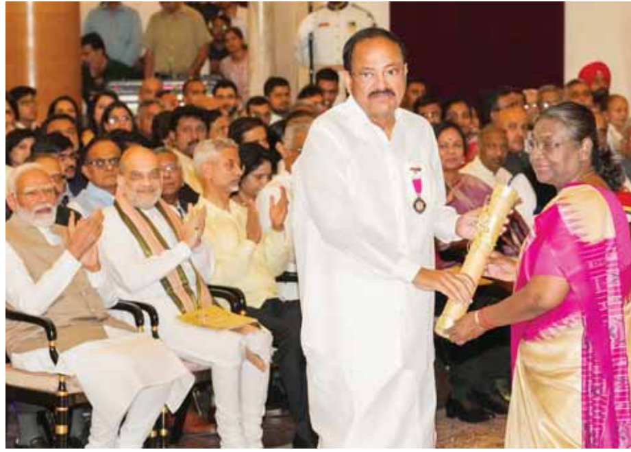
Former Vice President M Venkaiah Naidu, founder of Sulabh International Bindeshwar Pathak and a host of other prominent persons were conferred with Padma Awards by President Droupadi Murmu at a ceremonial function held at the Rashtrapati Bhavan here on Monday. Actor Mithun Chakraborty, singer Usha Uthup, former Uttar Pradesh governor Ram Naik and industrialist Sitaram Jindal were conferred with the Padma Bhushan

right to live as a human irrespective of caste, creed and religion. It believes in equality and unity. The NCP has faith in social reformer Sane Guruji's quote, 'The true religion is to offer love to the world. We must bring the deprived and backward sections of society into the mainstream. We will demand for a caste-based census,' the manifesto stated. "We will continue to push for the implementation of measures and funds to ensure that the students from the minority communities will get opportunities of higher education, entrepreneurship and employment through the institution," the manifesto stated.