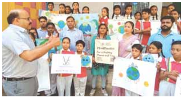
A talk show being organised on World Earth Day in Varanasi on Monday.

With an aim to raise public awareness about the harmful effects of plastic pollution on the environment and inhabitants of the Earth, the activists of Namami Gange removed plastic waste from the Ganga on World Earth Day here on Monday. They appealed to the people to make the river plastic free. On the occasion the toxic polythene waste was also taken out from the Ganga and then dumped in dustbin. The theme of Earth Day 2024 is 'Planet vs Plastic' and its aim is to promote a global movement to significantly reduce the use and manufacture of plastics.