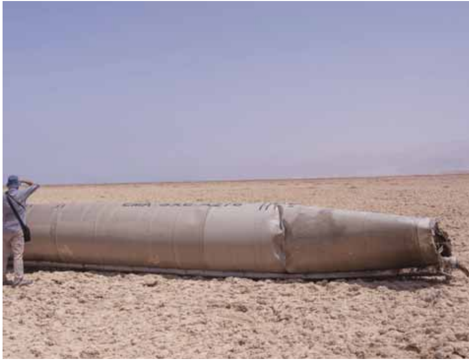
A photojournalist looks at part of the intercepted ballistic missile that fell near the Dead Sea in Israel, Sunday. The suspected Israeli killing of Iranian generals at an Iranian diplomatic compound in Syria on April 1 prompted Iran's retaliatory barrage last weekend of more than 300 missiles and drones that the U.S., Israel and regional and international partners helped bat down without significant damage in Israel. And then came Friday's apparent Israeli

Israel's Military Intelligence Chief Major General Aharon Haliva resigned on Monday, taking responsibility for his unit's failures during the unprecedented October 7 Hamas attacks on the Jewish state. Haliva is the first General of the Israeli army's general staff to leave his position due to the failures that led to the massive attack by the Palestinian militant organisation Hamas and the subsequent war in Gaza. In his resignation letter written in Hebrew, Haliva said, "The Intelligence Division did not live up to the task we were entrusted with. Throughout my duties, I knew that alongside authority comes heavy responsibility." The General said he would like to "take responsibility" for what happened on October 7 and promised to do his best to complete as many of the war's goals as possible. Haliva also called for the establishment of a state investigative committee, "that can probe and find out in a thorough, in-depth, comprehensive and precise manner all the fac-