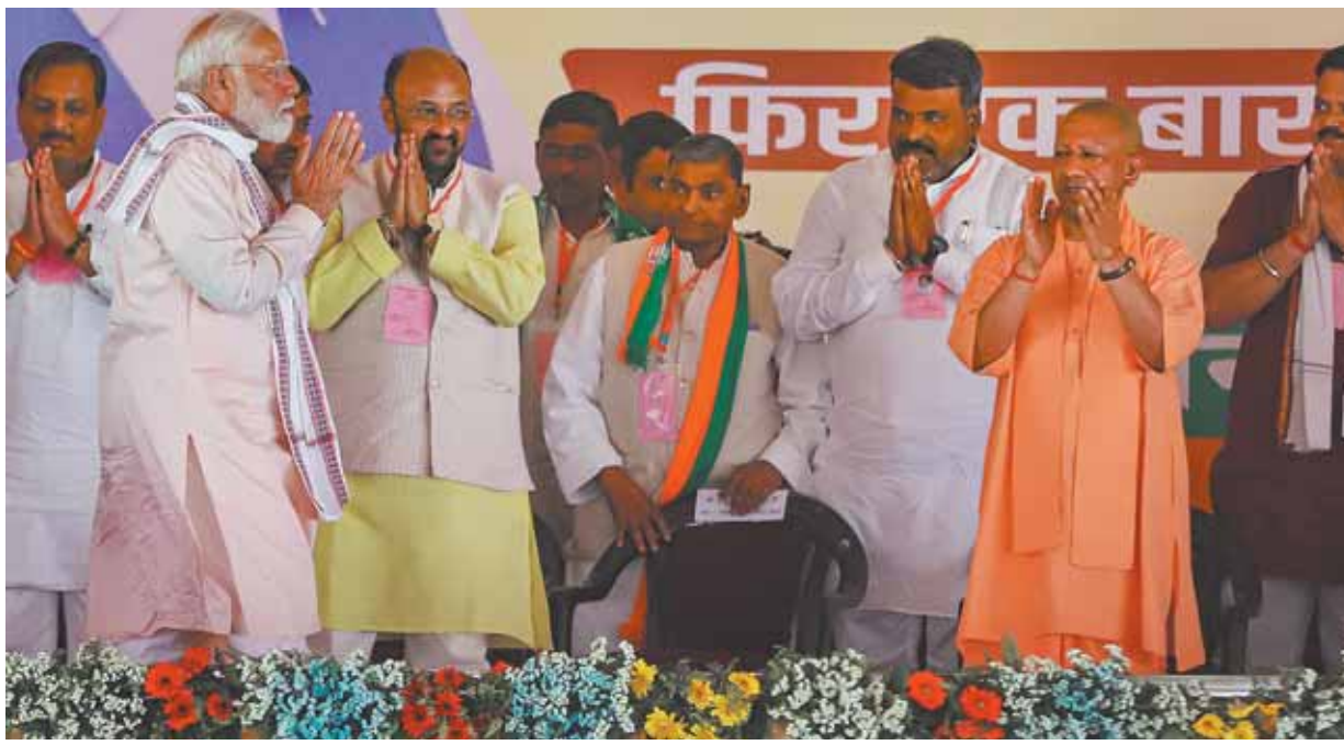
Prime Minister Narendra Modi, Chief Minister Yogi Adityanath and others during an election rally in Agra on Thursday

The prime minister highlighted concerns regarding Congress and its allies' alleged conspiracy to deprive Other Backward Classes (OBCs) of their reservation rights. He also criticised the Samajwadi Party for purportedly colluding with the Congress in this endeavour, which he claimed betrayed the Yadavs and the OBCs. Modi further cautioned against the intentions of Congress to expropriate people's ancestral properties, reiterating his commitment to a prosperous India and seeking the blessings of the electorate for progress and development. Discussing the Defence Industrial Corridor in Agra, Modi remarked on the unease among individuals accustomed to amassing wealth through ties with international arms dealers,