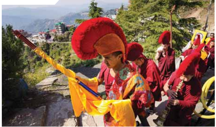
Tibetan monks during special prayers for the long life of the 11th Panchen Lama on his birthday, in Shimla