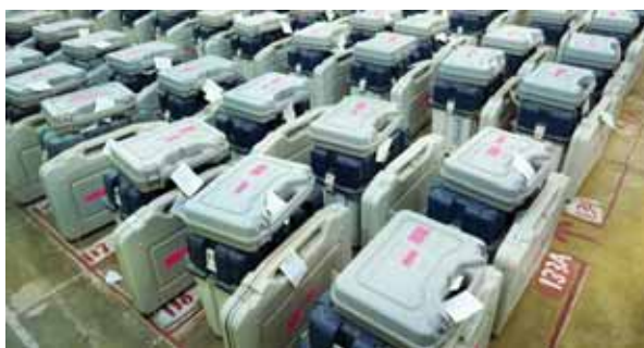
EVMs and other material at a distribution centre on the eve of the second phase of General Elections, in Ajmer on Thursday