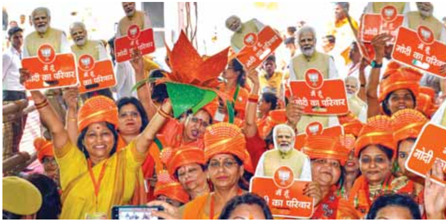
BJP supporters during Prime Minister Narendra Modi's election campaign rally for Lok Sabha polls, in Agra, on Thursday.

Taking cognisance for the first time of a model code conduct violation complaint against Prime Minister Narendra Modi, the Election Commission has issued notice to BJP national president JP Nadda and sought his response by April 29. The commission has also served a notice to Congress president Mallikarjun Kharge, asking him to respond to the complaints filed by the BJP against him and the main Opposition party's senior leader Rahul Gandhi regarding their remarks. Both the BJP and the Congress had raised allegations of causing hatred and division based on religion, caste, community, or language. This is the first time that notices were issued to party presidents for violation of model code of conduct by star campaigners, this election. Notably, this marks a departure from the past, where notices of alleged MCC violations were served directly to the candidate or star campaigner concerned. Even during the ongoing campaign for the Lok Sabha election 2024, all MCC notices served by the EC have been issued directly to party leaders, including Dilip Ghosh of the BJP, Congress leaders Randeep Surjewala and Supriya Shinate, and AAP leader Atishi. The EC notices to the two-party presidents did not directly name either Modi,