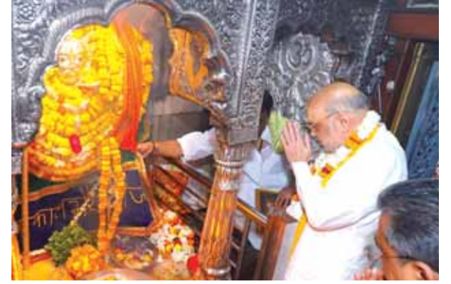
Union Home Minister Amit Shah offering prayers at Kal Bhairav Temple in Varanasi on Thursday.

Union Home Minister Amit Shah offered prayers at Kal Bhairav Temple here on Thursday morning before leaving this holy city for his Lok Sabha election campaign in Telangana and Odisha. Shah was on a two-day visit to this parliamentary constituency of Prime Minister Narendra Modi, who is going to seek his third consecutive victory from the Varanasi Lok Sabha seat. Shah arrived in the city on Wednesday evening and inaugurated the party's central election office of Varanasi Lok Sabha constituency at Tulsi Udyan (Mahmoorganj). Later, a few hundred yards away in the same Mahmoorganj locality, he addressed the BJP workers of the five assembly constituencies