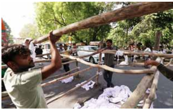
PNS ■ LUCKNOW