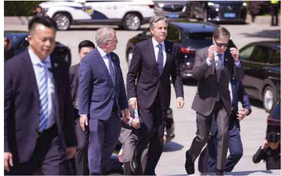
U.S. Secretary of State Antony Blinken, center, U.S. Ambassador to China Nicholas Burns, right, and Scott Walker, second left, visit a waterfront area called The Bund on Thursday.

"The two sides reaffirmed the importance of ties between the people of the United States and (China), including the expansion of exchanges between students, scholars, and business," it said. China's multibillion-dollar trade surplus with the US along with accusations of intellectual property theft and other prac-