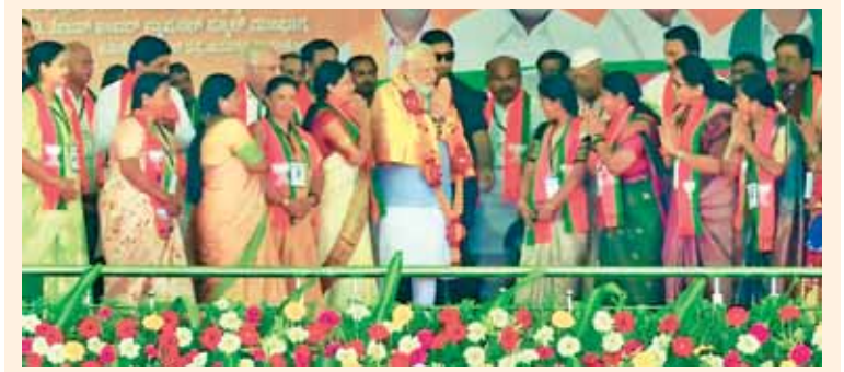
Prime Minister Narendra Modi being felicitated during a public meeting for Lok Sabha elections, in Bagalkote, Karnataka, on Monday