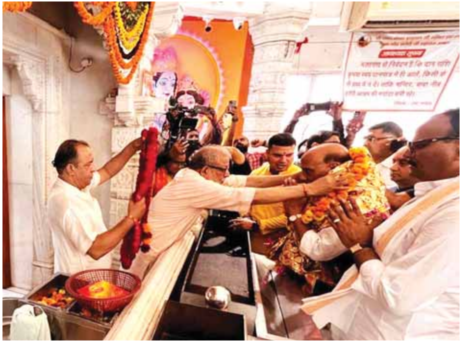
Defence Minister Rajnath Singh visited Hanuman temple to seek blessings of the deity and then undertook a massive roadshow on his way to collectorate to file nomination papers on Monday