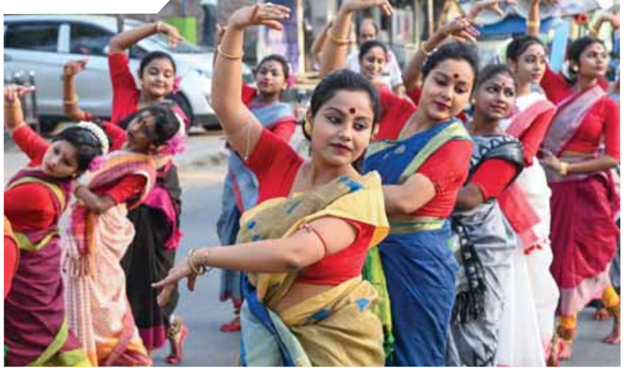
Members of a dance group perform on a road on International Dance Day, in Nadia