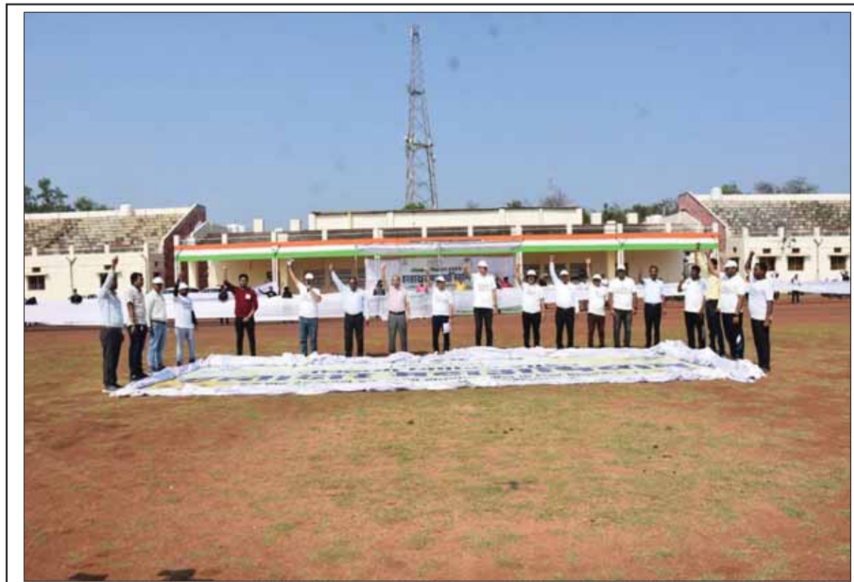
Over 6 lakh citizens in Kabirdham district in Chhattisgarh signed on a 4-kilometer-long cloth to spread the message of voting without fail in the Lok Sabha polls. Voting is to be held in Kabirdham on April 26.

Security forces have launched a crackdown on Maoists in Chhattisgarh.