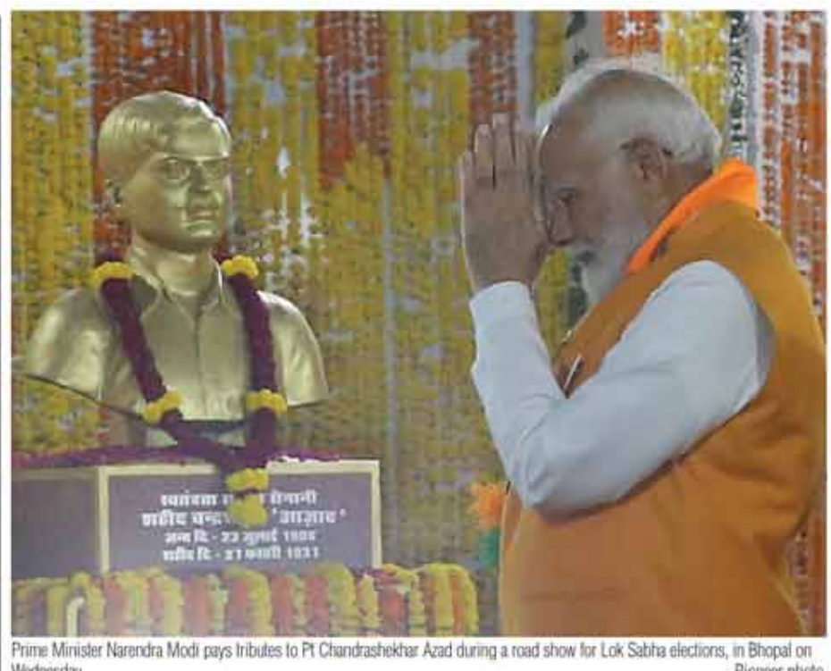
Prime Minister Narendra Modi pays tributes to Pt Chandrashekhar Azad during a road show for Lok Sabha elections, in Bhopal on Wednesday.

the tribals, the Muslims, that is why we appoint them to the highest positions in the country. This work was never done during the Congress government. He never made any tribal or Muslim the President of the country. We love the poor, that is why people from poor families become Prime Ministers and Chief Ministers here. Only Bharatiya Janata Party and Prime Minister Shri Narendra Modi can do this work. Congress people keep fighting each other and their politics runs on this basis. They have been doing this work for years. Their mentality has been like this since the country's independence. When the country became independent, they first got India-Pakistan divided and then continued to rule by creating division between Hindus and Muslims.