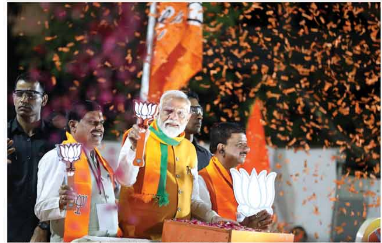
Prime Minister Narendra Modi during a road show for Lok Sabha elections, in Bhopal on Wednesday.

Jabalpur, Neemuch, Mandsaur, Ratlam, Jabua, Alirajpur, Barwani, Dhar, Khargone, Ratlam, Agar-Malwa, Rajgarh, Shajapur, Dewas, Harda, Khandwa, Burhanpur, Sehore, Narmadapuram, Betul, Chhindwara, Pandhurna, Seoni, Mandla, Narsinghpur, Raisen, Damoh, Sagar, Vidisha, Ashoknagar, Guna, Sheopur, Shivpuri, Niwari, Tikamgarh districts in the next 24 hours. In the next two days Indore, Gwalior, Jabalpur, Neemuch, Mandsaur, Dhar, Khargone, Khandwa, Burhanpur, Harda, Narmadapuram, Betul, Raisen, Vidisha, Ashoknagar, Guna, Shivpuri, Sheopur Kalan, Pandhurna, Chhindwara, Narsinghpur, Sagar, Tikamgarh, Chhatrapur, Damoh, Seoni, Mandla, Balaghat, Dindori, Anuppur, Shahdol, Umaria, Katni, Maihar, Panna, Satna, Rewa districts would witness rainfall. There is no warning of rain in the state on April 27, but it will remain cloudy. These include Agar-Malwa, Rajgarh, Guna, Khargone, Khandwa, Burhanpur, Harda, Betul, Narmadapuram, Raisen, Pandhurna, Chhindwara, Narsinghpur, Sagar, Tikamgarh, Chhatrapur, Panna, Damoh, Jabalpur, Dindori, Mandla and Balaghat districts. Many rainfall records were broken in April. About two and a quarter inches of rain fell in Bhopal. At the same time, a record of rain for 11 consecutive days in April has also been made. There has been continuous rain in the state from April 7 to April 17. Now the state is getting drenched again. It is expected to rain till April 27. It has rained from the second system for five consecutive days.