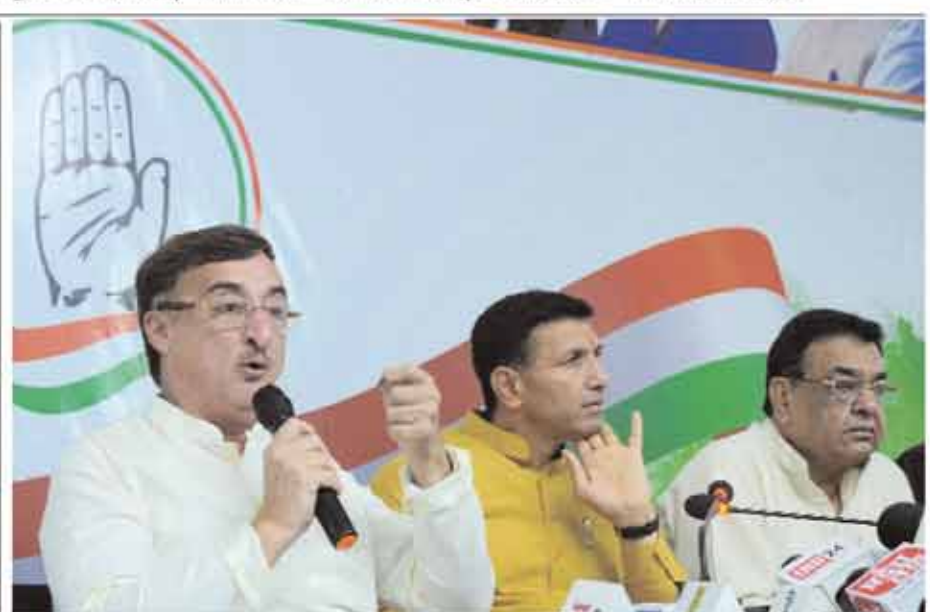
Senior Congress leader and Rajya Sabha MP Vivek Tankha with Congress State President Jitu Patwari addresses a press conference at PCC headquarters in Bhopal on Wednesday.