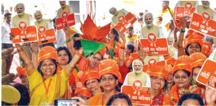
BJP supporters during Prime Minister Narendra Modi's election campaign rally for Lok Sabha polls, in Agra, on Thursday

Taking cognisance for the first time of a model code conduct violation complaint against Prime Minister Narendra Modi, the Election Commission has issued notice to BJP national president JP Nadda and sought his response by April 29.