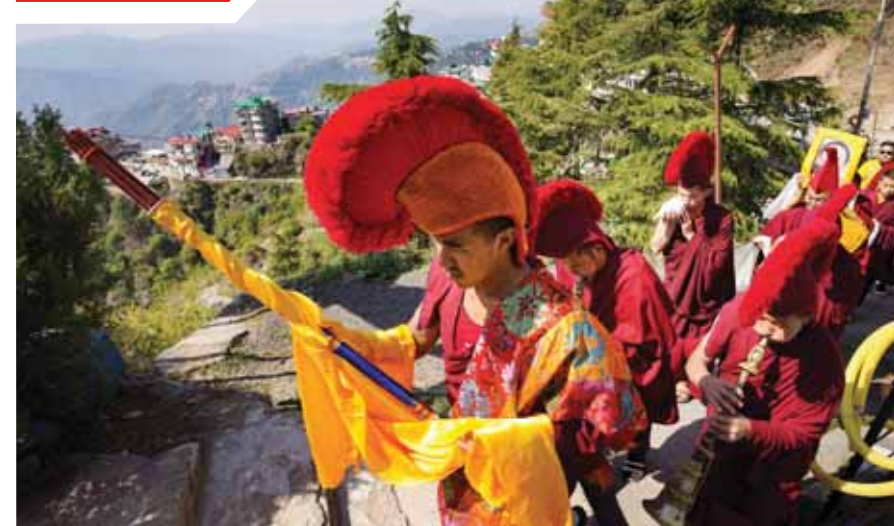
Tibetan monks during special prayers for the long life of the 11th Panchen Lama on his birthday, in Shimla