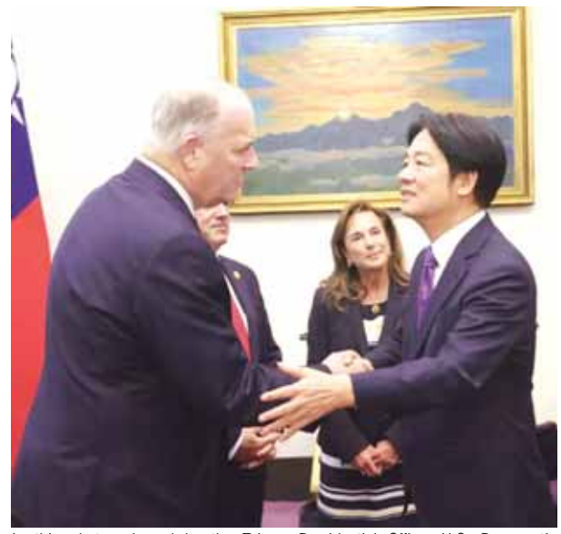
In this photo released by the Taiwan Presidential Office, U.S. Democratic Congressman Dan Kildee, left, meets with Taiwan President-elect and Vice President Lai Ching-te in Taipei, Taiwan on Tuesday.

Along with stepping up its threat to annex Taiwan by force, China has whittled down the number of Taiwan's formal diplomatic allies to