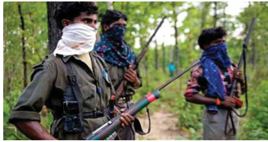
STAFF REPORTER ■ DANTEWADA

A District Reserve Guard (DRG) Constable was killed and another policeman injured due to an accidental discharge of a firearm in Chhattisgarh's Dantewada dis-