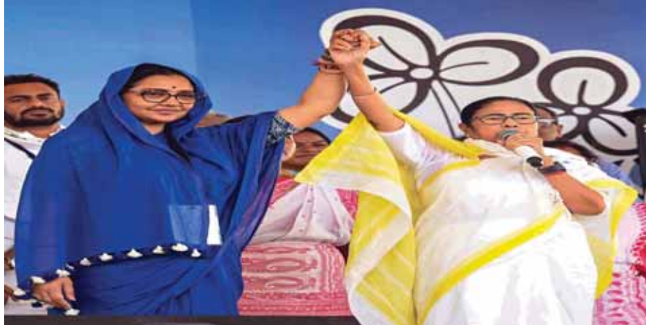
Dasmunshi to Parliament. Usually considered to be a violence-prone district, Raiganj has 418 sensitive booths most of which are around Goalpokhar, Chakulia and Dalkhola bordering Bihar. The area witnessed massive violence

The fates of 47 candidates, including two sitting BJP MPs -- Sukanta Majumdar the State BJP president, his Darjeeling counterpart Raju Bista -- will be decided even as three North Bengal constituencies of Darjeeling, Balurghat and Raiganj go to second phase polling on Friday.