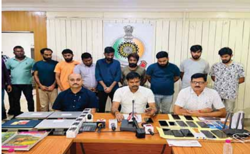
STAFF REPORTER ■ RAIPUR