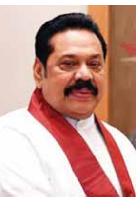
Inquiry on the Easter Sunday attacks was handed over to the former president, he had spoken to him over the phone and said that he had difficulties in implementing the recommendations in that report as it would entail the arrest of individuals and even the banning of organisations that were supportive of him. In response, Rajapaksa said, "I categorically state that I did

The former president noted that at a recent media conference, Cardinal Ranjith alleged that the day after the report of the Presidential Commission of