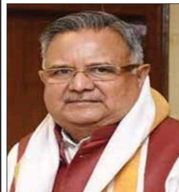
STAFF REPORTER ■ RAIPUR

Senior BJP leader and former Chief Minister Raman Singh on Thursday said Congress leader and former Chief Minister Bhupesh Baghel will lose the Lok Sabha election from Rajnandgaon, Raman Singh's political turf. Baghel is pitted against outgoing MP Santosh Pandey. "Baghel's performance will be poor in all eight Assembly segments," Singh said in a statement. "Months after facing a shock defeat in the Chhattisgarh Assembly elections, Baghel is set to lose from