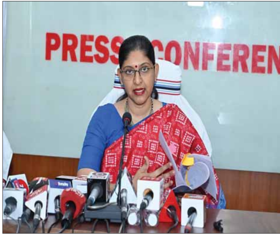
STAFF REPORTER ■ RAIPUR

Fate of bigwigs Bhupesh, Tamradhwaj to be locked in EVMs