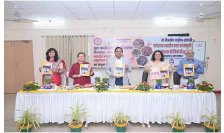
STAFF REPORTER ■ BILASPUR