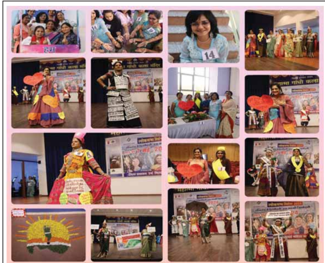
Glimpses of the women's voter awareness event held at the Mahatma Gandhi Kala Mandir in Bhilai on Saturday to encourage voters ahead of the May 7 Lok Sabha elections in Chhattisgarh.