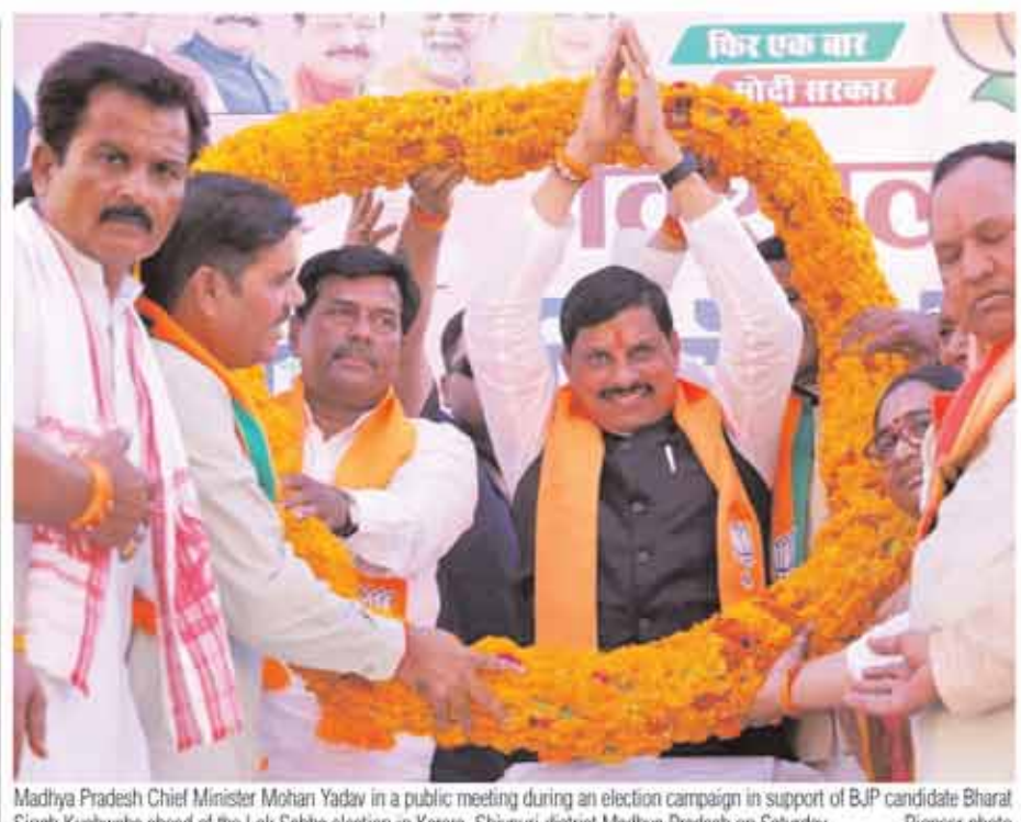
Madhya Pradesh Chief Minister Mohan Yadav in a public meeting during an election campaign in support of BJP candidate Bharat Singh Kushwaha ahead of the Lok Sabha election in Karera, Shivpuri district Madhya Pradesh on Saturday.

from Gwalior to Guna six lane, which was earlier two lane, was done at a cost of Rs 5000 crore. Union Minister Shri Scindia said that today Shivpuri is connected to the main stream of development. There were only a few trains from Shivpuri railway station, but today there are trains for every corner of the country. There are trains for Indore, Bhopal, Amritsar, Chandigarh and even Mumbai. Big institutions were established in the fields of education and health. Today the medical college is at the district headquarters at a cost of Rs 200 crore. Apart from this, NTPC's engineering college and power sector college have opened in Satnawada, the benefits of which are being availed by local students.