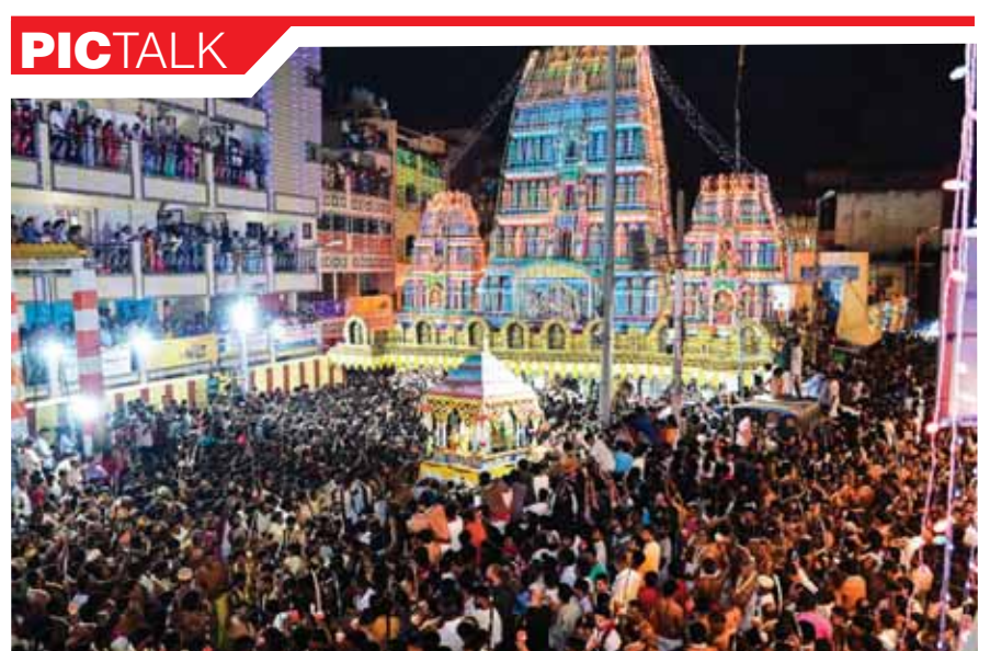
Veerakumars' gather to participate in the the Karaga festival at Sri Dharmarayana Swamy Temple, in Bengaluru

From food and shelter to lending a helping hand in evacuation efforts, the collective response has underscored the strength of solidarity in the face of adversity. However, these forest fires carry grave environmental implications. The loss of precious flora and fauna, coupled with the release of harmful pollutants into the atmosphere, underscores the urgent need for proactive measures to mitigate future fire outbreaks. Strengthening forest management practices, implementing early warning systems and fostering community awareness are paramount in safeguarding the region's biodiversity and mitigating the risk of catastrophic wildfires. It is about time that a comprehensive policy was framed to fight the wildfire menace. The Uttarakhand Government must draw from the US experiences in California, where such fires are frequent but they manage them rather well and swiftly with an early warning system, besides a mechanism for controlled burns. As the battle against the Nainital forest fire rages on, it serves as a stark reminder of the fragility of our natural ecosystems as also the resilience of the human spirit. With the combined efforts of authorities, armed forces and local communities, there is hope that the flames will soon be extinguished. However, the aftermath of this crisis should serve as a catalyst for concerted action towards building a more resilient and sustainable future for Uttarakhand and beyond.