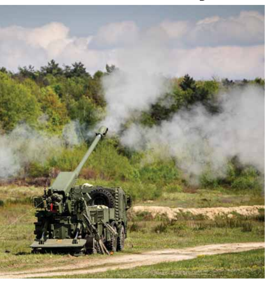
A Bohdana cannon fires in Lviv in Ukraine on Saturday. The Bohdana cannons are produced in Ukraine. Danish Foreign Minister Lars Loekke Rasmussen, Danish Defense Minister Troels Lund Poulsen and members of parliament met with Ukrainian colleagues during a visit to Lviv

Russian shelling on Saturday and overnight wounded at least seven civilians across Ukraine,