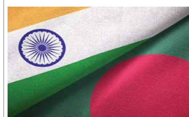
PIONEER NEWS SERVICE NEW DELHI

A Central Government delegation is on a three-day visit to Bangladesh beginning Sunday to further boost bilateral ties on governance matters, according to an official state-