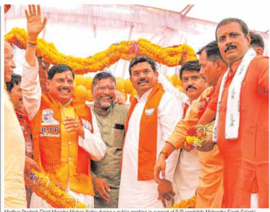
ahead of the Lok Sabha elections in Kalapipal, Shajapur district Madhya Pradesh on Sunday

ed it on time. The work which you people did not say but was necessary for the development of the area, I and the BJP government have also done that work in this area. On the coming 7th May, you people have to give your blessings to BJP by pressing the lotus button to make Shri Narendra Modi the Prime Minister for the third time with a historic majority. Lok Sabha elections are also a kind of struggle. This is a new age war, in which one has to press the EVM button and not the sword and defeat the opponents with current. Union Minister Scindia has also addressed street meetings in Narayanpur, Khajuria Kala, Mhow, Alampur, Banskhedi, Ghat Bamuria.