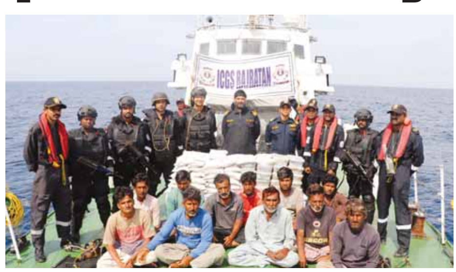
Indian Coast Guard (ICG) personnel with 14 crew members of a Pakistani boat after apprehending them from Indian waters. ICG also seized narcotics from the boat