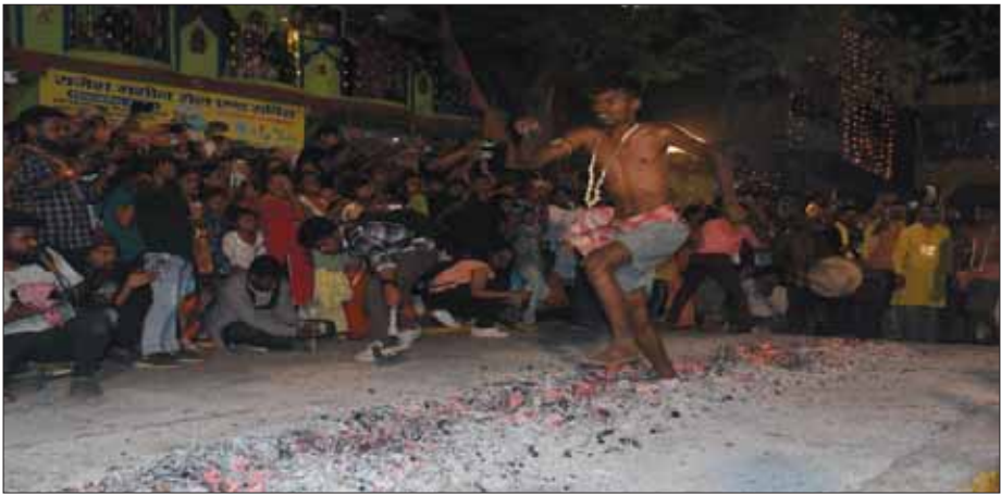
A Tribal man walks on burning coal to pay tribute to the Lord Shiva during Manda festival in Ranchi on Saturday early morning.