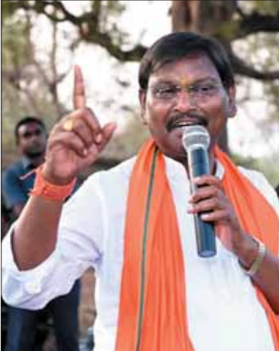
Arjun Munda, Union Minister for Tribal Affairs and Minister of Agriculture and Farmers Welfare cum BJP candidate for MP seat from Khunti Parliamentary constituency, addressing a public meet ahead of Parliamentary Election-2024 at Tamar area under Ranchi district on Saturday.