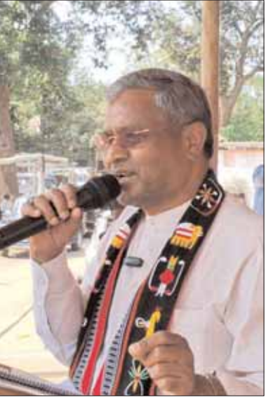
State BJP President Babul Marandi addresses a gathering during a public meeting ahead of the upcoming Lok Sabha election in Gumla on Saturday.