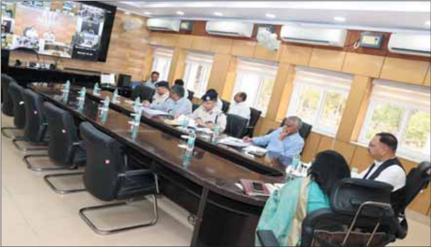
Senior police officials during a meeting ahead of Ram Navami at police headquarters in Ranchi on Saturday.