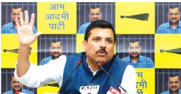
AAP leader Sanjay Singh addresses a Press conference in New Delhi on Saturday