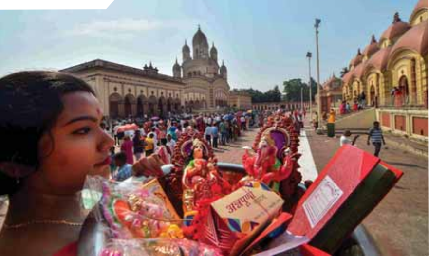
Devotees stand in a queue to offer prayers at Dakshineswar Kali Temple on Bengali New Year, in Kolkata