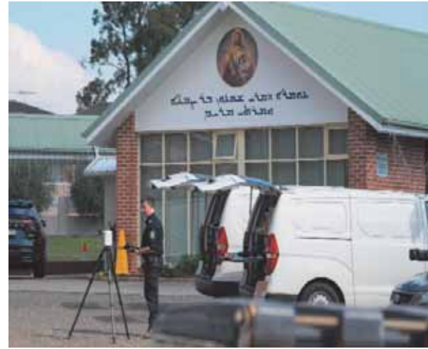
A police forensic officer works at a crime scene at the Christ the Good Shepherd Church in suburban Wakeley in western Sydney, Australia on Tuesday.