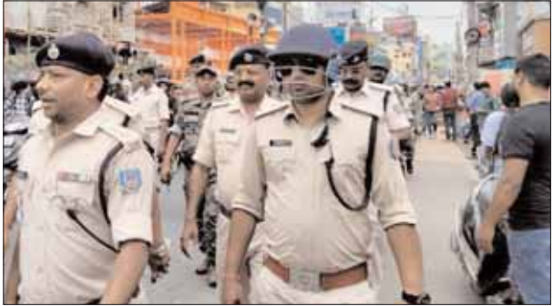
Police personnel conduct flag march ahead of Ram Navami festival in Ranchi on Tuesday.