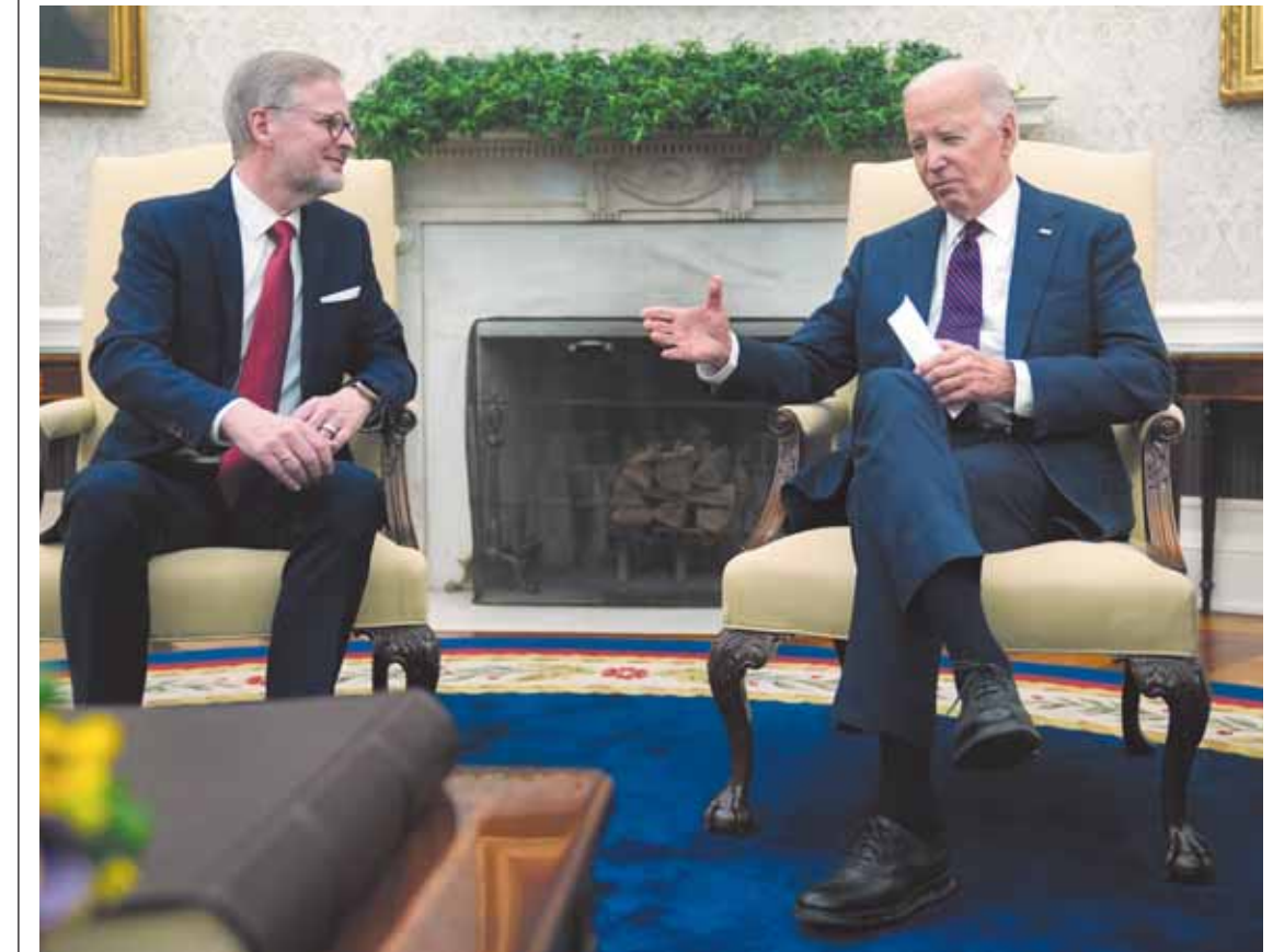
President Joe Biden, right, meets with Prime Minister Petr Fiala of the Czech Republic in the Oval Office at the White House, Monday.