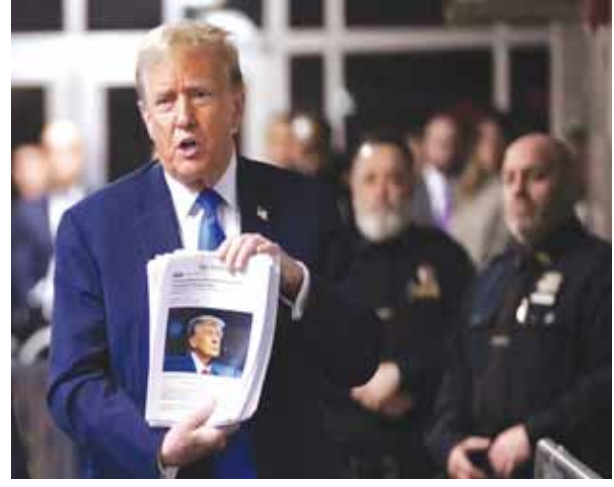
Former President Donald Trump holds up news clippings as he speaks following his trial at Manhattan criminal court in New York on Thursday.

Lawyers worked Friday to round out the panel of 12 jurors and six alternates who will hear Donald Trump's hush money trial, as the former president railed against a gag order that has prosecutors seeking to hold him in contempt of court. After a jury of 12 New Yorkers was seated Thursday, lawyers turned their attention to picking alternates who can vow to set aside their personal views and judge the presumptive Republican presidential nominee. Thursday's proceedings demonstrated unpredictability in the jury selection process of such a high-profile case, with two jurors who had been seated a day earlier being dismissed from the panel. The judge has suggested that opening statements could begin as early as Monday, before prosecutors begin laying out their case alleging a scheme to cover up negative