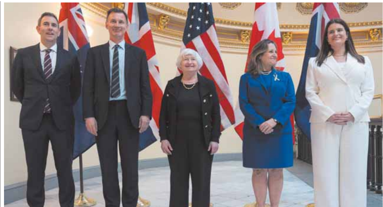
Treasurer Jim Chalmers of Australia, from left, Britain's Chancellor of the Exchequer Jeremy Hunt, Treasury Secretary Janet Yellen, Deputy Prime Minister and Finance Minister Chrystia Freeland of Canada, and Finance Minister Nicola Willis of New Zealand, pose for a photograph after a Five Eyes Finance Ministers meeting at the Treasury Department, on Thursday in Washington.

giant Siemens. Prosecutors allege a former executive with the company used entities created by Mossack Fonseca to transfer funds for bribes. A Siemens spokesperson declined to comment, noting that it is not a party to the Panama case and that it involves former Siemens employees in their private capacity. The 71-year-old Fonseca has not been present for the trial, because his lawyer said he is hospitalized. But he had previously said his firm did not control how their clients used the shell companies the firm created for them. Its role was simply the creation and sale of the companies. Mossack, a 76-year-old lawyer originally from Germany, said in a statement "we categorically reject that we have committed any crime, nor Mossack Fonseca nor the subsidiaries... and we hope that can be proved in the trial."