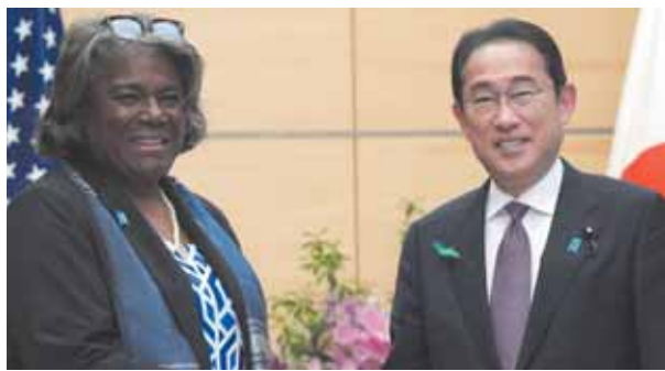
US Ambassador to United Nations Linda Thomas-Greenfield, left, and Japan's Prime Minister Fumio Kishida, right, shake hands during a meeting on Friday

"For those of us who already have those weapons, we must pursue arms control. We can and must work to ensure that Nagasaki is the last place to ever experience the horror of nuclear