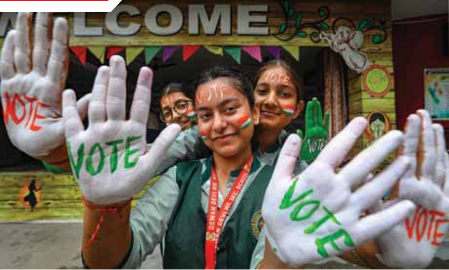
School students with their faces and hands painted as part of voter awareness campaign pose for photos, in Jammu