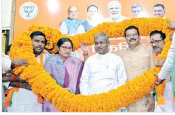
State BJP President-cum former Jharkhand Chief Minister Babul Marandi alongwith Union State Minister-cum party Koderma Lok Sabha candidate Annapurna Devi and newly joined party leaders garlanded by party workers, ahead of the upcoming Lok Sabha elections, at party State HQ in Ranchi on Friday.

people. He said that this alliance is formed only to earn money. It is in their nature to loot the country and the state after gaining power. He said that the people of the country do not trust the INDI Alliance. The public is trusting Modi's guarantees. He said that BJP is determined to make Jharkhand a separate state and serve the villages, the poor and the farmers. Modi government