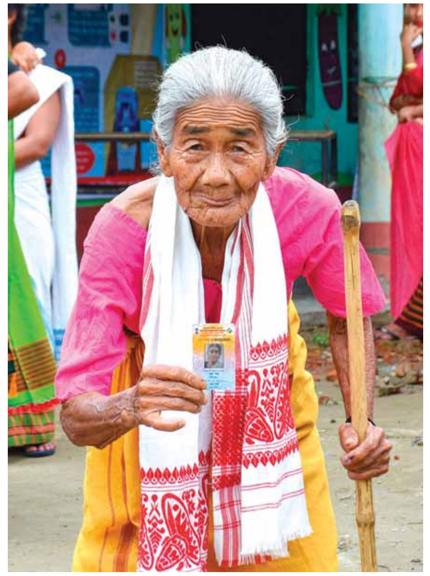
An elderly woman along with others waits to cast votes for the first phase of Lok Sabha polls, in Sivasagar, Assam, on Friday

Nana Patole exercised his franchise along with his family members at Sukli village in Bhandara district. Talking to media persons after he cast his vote, Patole said that the BJP-led government had "cheated" people for 10 years and they were determined to end the 10-year dictatorship of Prime Minister Narendra Modi. "The people of Vidarbha have always stood firmly behind the Congress. We are receiving great support from the people this time as well. I am confident that we will win all the five Lok Sabha seats that went to poll today," he said. Barring Nagpur where voter turn-out was the lowest, there was considerable enthusiasm among voters in four other poll-constituencies of Chandrapur, Bhandara-Gondiya, Ramtek (SC), Gadchiroli-Chimur (ST). Lakhs of people, including large numbers of first-time voters, youth, senior citizens and transgenders, exercised their voting rights. In a heart-warming sight witnessed in Gadchiroli-Chimur constituency, nine handicapped senior citizens were brought in a 'rath yatra' by people, accompanied by a brass band playing on the roads, to cast their votes at a polling station.