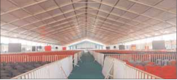
Venue of India Alliance's Ulgulan Nyaya Maharally at Dhurwa in Ranchi on Saturday.