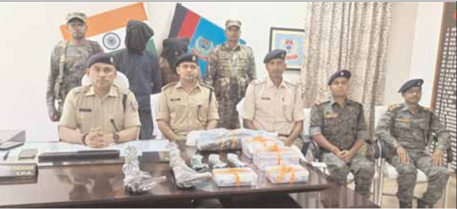
PNS : JAMSHEDPUR

In a significant breakthrough, the Chaibasa Police have arrested