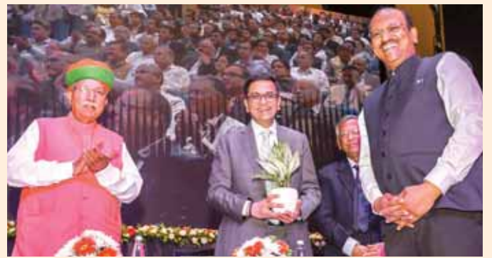
Chief Justice of India D.Y. Chandrachud and Union Minister of Law & Justice Arjun Ram Meghwal during the inauguration of a conference on 'India's New Criminal Justice System - A Progressive Step' organised by the Ministry of Law and Justice, at the Ambedkar International Centre, in New Delhi, on Saturday

"The voter turnout in Bihar is low because the Opposition here is in a state of atrophy. Although the NDA is going to do well everywhere, at least it has some competition in, say, West Bengal, which is a reason why voters there turned up in large numbers yesterday," he told reporters.