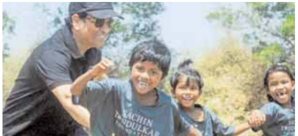
Former cricketer Sachin Tendulkar plays with budding football players of Yuva Foundation in Ranchi on Saturday.