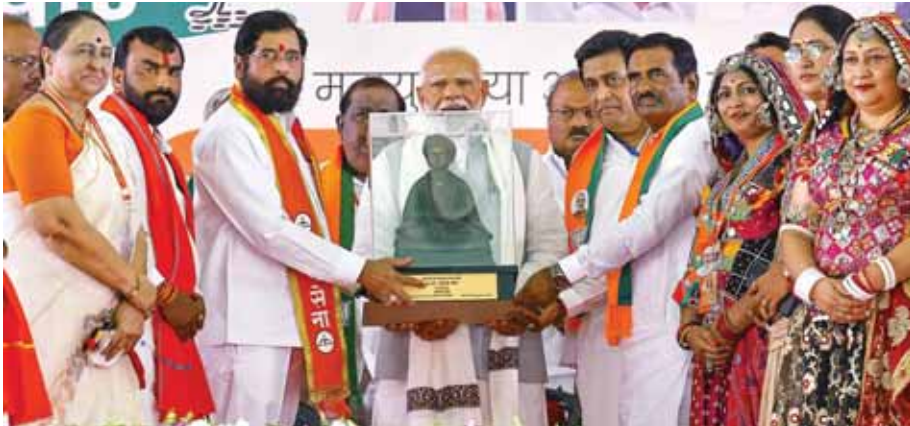
Nanded: Prime Minister Narendra Modi with Maharashtra Chief Minister Eknath Shinde during a rally for Lok Sabha polls, in Nanded, on Saturday

Modi said that the infighting was on within the Opposition INDIA bloc over the 25 per cent seats. "Come June 4, the INDI alliance leaders will tear the clothes and hair of one another. Do you want to waste your votes on these leaders? That's why you should vote for the NDA. Voting for NDA is