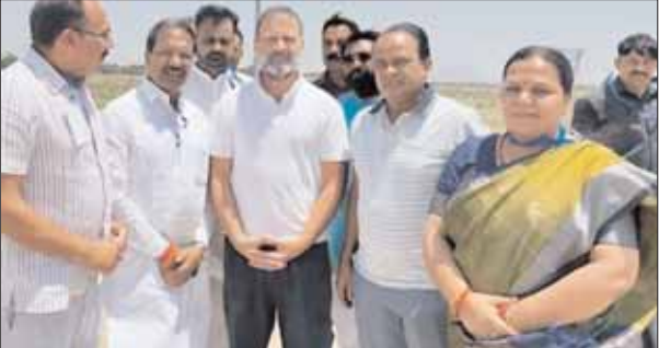
Congress leader Rahul Gandhi being welcomed by Congress MLAs at Deoghar Airport on Saturday.

Kharge, Rahul Gandhi, RJD supreme Lalu Prasad Yadav, former Jammu and Kashmir Chief Minister Farooq Abdullah, Aam Aadmi Party's Sunita Kejriwal, Punjab Chief Minister Bhagwant Mann, former Uttar Pradesh Chief Minister