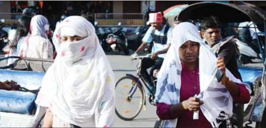
Girls wear scarves to protect themselves from the scorching sun during a hot afternoon in Ranchi on Saturday. The maximum temperature in Ranchi was 39.5 degree celsius on Saturday.