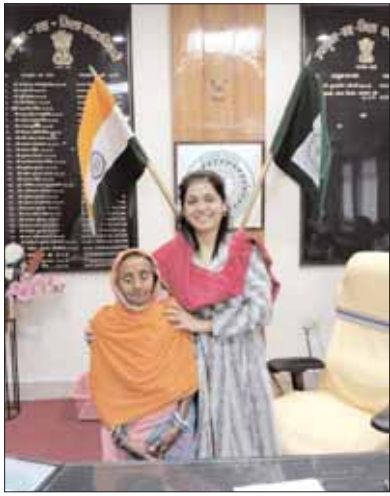
commitment to the mission of "No Voter Left Behind."

The overarching goal of such extensive initiatives is to educate as many people as possible about the upcoming voting day on May 25th. It's crucial to ensure that no eligible voter is excluded from exercising their democratic right. The district administration is steadfast in its