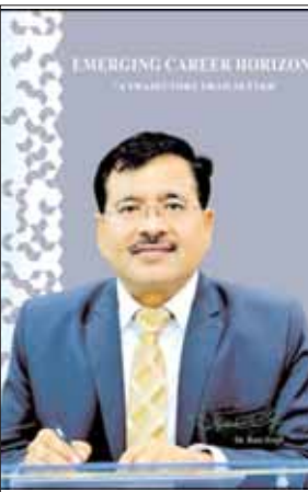
PNS : RANCHI

WITH A CAREER SPANNING TEN YEARS, THE WRITER HAS SOLIDIFIED HER EXPERTISE IN HR, ENTREPRENEURSHIP AND INNOVATION ECOSYSTEM DEVELOPMENT. SHE IS A PRINT AND RAMP MODEL WHO WAS ALSO FEATURED IN VOGUE AND GLADRAGS MAGAZINES.