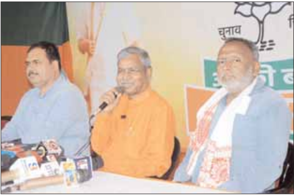
State BJP President Babul Marandi addressing media persons at Media centre in Ranchi on Saturday.

Those who loot and destroy the lands and resources of the tribal society should avoid using the sacred word like Ulgulan and the friends of Indi Coalition should once again read the Ulgulan rebellion by looking into the history. The Ulgulan rebellion arose in protest against the snatching of the natives' resources, their lands and their rights by the landlords and moneylenders. Today, the Indi alliance, like the same moneylenders and landlords, is trying to mislead the public by usurping the lands of the tribal community and politicizing it by using words like Ulgulan. Today, under the leadership of Hemant, the dream of building a banquet hall by illegally occupying the ancestral lands of the same tribal community is being nurtured; Lord Birsa Munda is being insulted by a revolution-