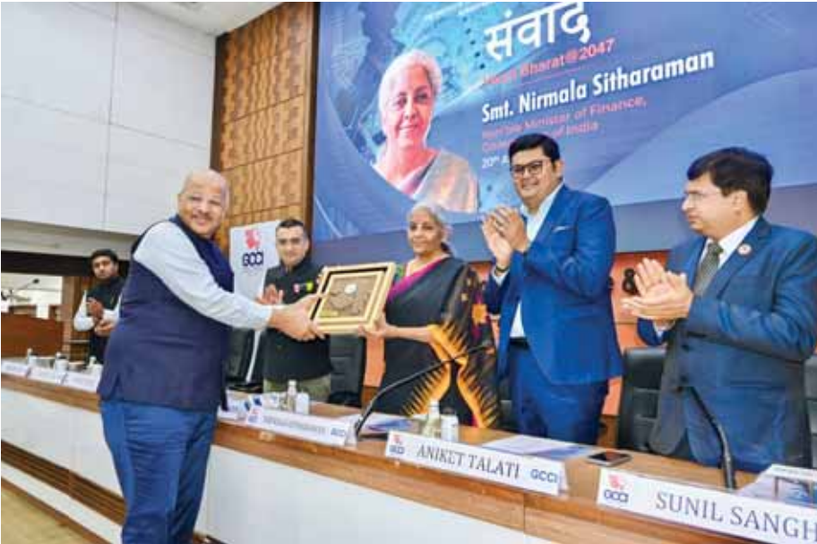
Union Finance Minister Nirmala Sitharaman during an interaction with Gujarat Chamber of Commerce & Industry (GCC) members, in Ahmedabad

approach has helped especially after China plus one started being a concern for many industry experts, she said policies have been tailored in such a way so as to make India an attractive destination for manufacturing and for services. Speaking about inflation, she said it never crossed the tolerance band, except for one month, under the Narendra Modi government, whereas before that (pre-2014) the economy was in a bad shape and inflation was in double digits. “At that time (pre 2014) nobody had any expectations from the country. After much hard work, we have emerged as the world’s fifth largest economy and are confidently saying we will be third in the next two to two-and-half years,” the Union minister said. On employment, Sitharaman said there was lack of complete data from both the formal and informal