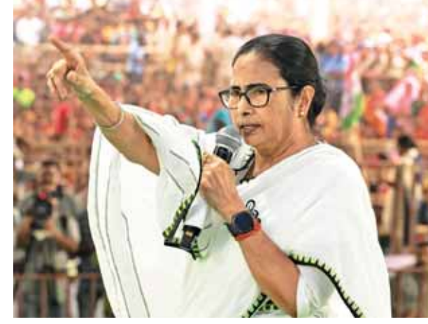
West Bengal Chief Minister Mamata Banerjee during an election campaign meeting for Lok Sabha polls, in North Dinajpur district

In a major blow to the Trinamool Congress in the midst of general elections the Calcutta High Court on Monday ordered the cancellation of appointments of 25,753 teachers and non-teaching staff made through the recruitment process of State Level Selection Test-2016 (SLST) in West Bengal Government-sponsored and aided schools, declaring the selection process as "null and void". The court directed the "illegal recruits" to return their emoluments drawn in the past several years within four weeks. As the order came barely a couple of days after Bengal Opposition Leader Suwendu Adhikari presaged a "massive explosion that will shake the foundations of the TMC," Chief Minister Mamata Banerjee immediately called the court order "illegal" and vowed to move the Supreme Court for justice. "Now you can see the relationship between what he (Adhikari) said about a possible explosion and the order that has come today... this is an illegal order... I am not talking about the Judges but the order... we do not accept this order dictated by the BJP... We do not accept this order that will throw 26,000 people out of their jobs affecting 1.5 lakh or even more people directly... we will go to the higher court," Banerjee said at an election rally in North Dinajpur. Bengal SSC Chairman