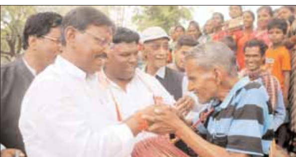
Union Minister-cum BJP candidate from Khunti constituency Arjun Munda during an election campaign rally at a village in Khunti on Monday.

Munda said that those who ruled the country for 60 years blocked the development of villages. For development we have to take tradition and change together. For a developed India, we have to bring dynamism in development. On one hand we talk