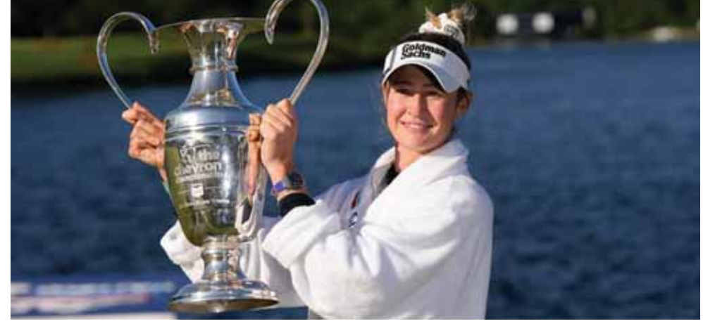
"I'm going to enjoy this right now and then I'll think about that," she said. "But yeah, it's been an amazing time. Hopefully keep the streak alive. But I've been so grateful to compete week in and week out and get the five in a row, too." Masters champion Scottie Scheffler is on a similar tear, on his way to a fourth victory in five starts until rain interrupted the final round of the RBC Heritage. He couldn't help but check in on Korda. "I actually was checking the scores this afternoon when we were in the rain delay," he said. "I'm extremely happy for her and proud of her. That's some pretty special stuff. It's been a treat to watch."