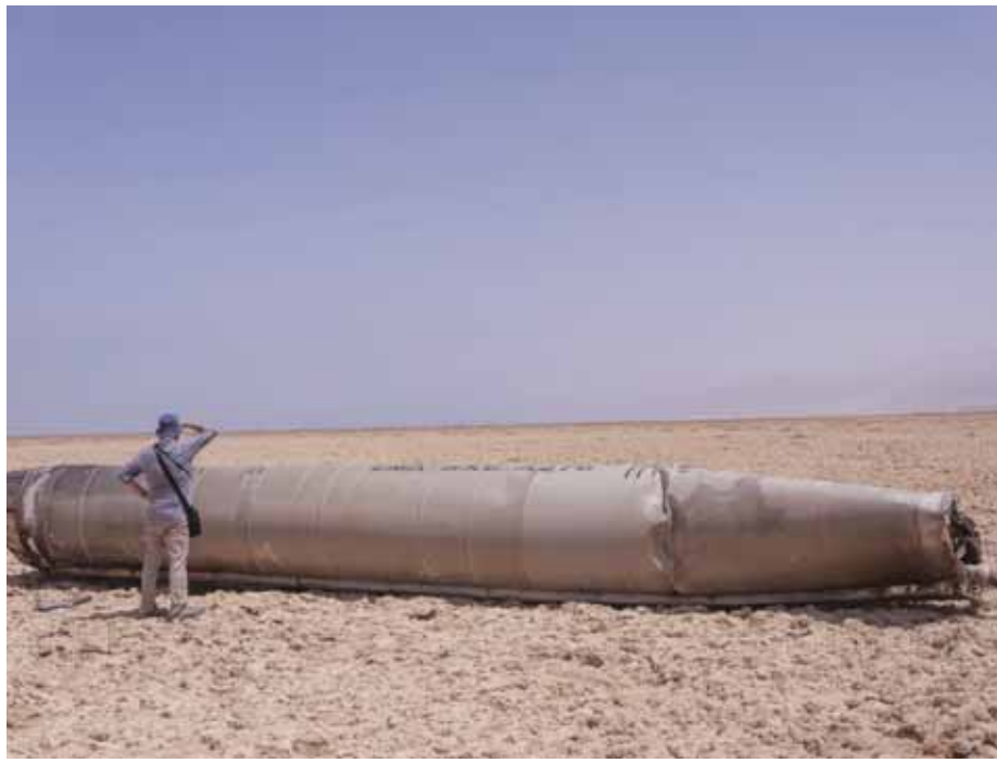
A photojournalist looks at part of the intercepted ballistic missile that fell near the Dead Sea in Israel, Sunday. The suspected Israeli killing of Iranian generals at an Iranian diplomatic compound in Syria on April 1 prompted Iran's retaliatory barrage last weekend of more than 300 missiles and drones that the U.S., Israel and regional and international partners helped bat down without significant damage in Israel. And then came Friday's ads apparent Israel.

Israel's Military Intelligence chief Major General Aharon Haliva resigned on Monday, taking responsibility for his unit's failures during the unprecedented October 7 Hamas attacks on the Jewish state. Haliva is the first General of the Israeli army's general staff to leave his position due to the failures that led to the massive attack by the Palestinian militant organisation Hamas and the subsequent war in Gaza. In his resignation letter written in Hebrew, Haliva said, "The Intelligence Division did not live up to the task we were entrusted with. Throughout my duties, I knew that alongside authority comes heavy responsibility." The General said he would like to "take responsibility" for what happened on October 7 and promised to do his best to complete as many of the war's goals as possible. Haliva also called for the establishment of a state investigative committee, "that can probe and find out in a thorough, in-depth, comprehensive and precise manner all the fac-