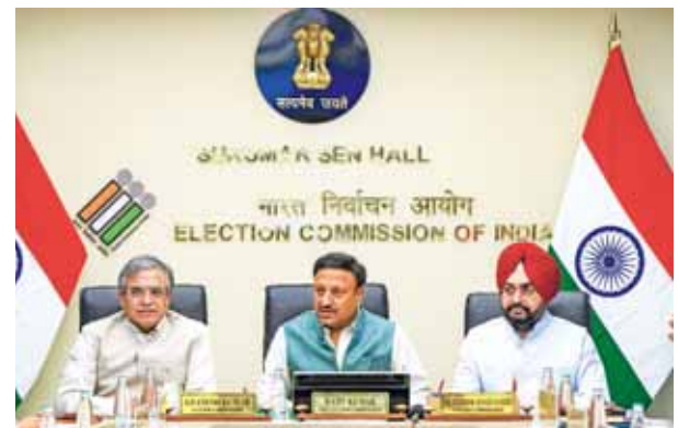
Chief Election Commissioner Rajiv Kumar with Election Commissioners Gyanesh Kumar and Sukhbir Singh Sandhu addresses the media in New Delhi on Monday