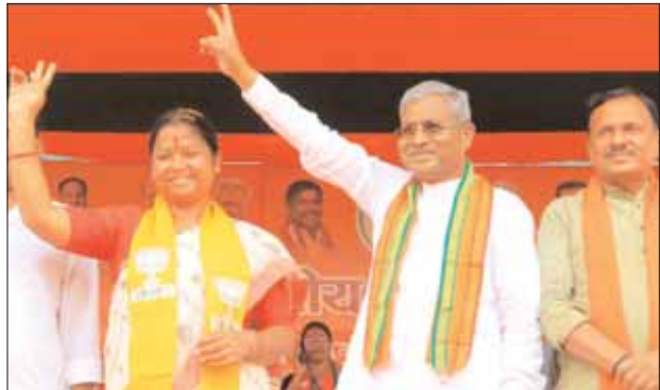
Former Jharkhand Chief Minister Babul Marandi alongwith BJP candidate from Chaibasa constituency Geeta Koda show victory sign after she filed her nomination papers for the Lok Sabha elections, in West Singhbhum district on Monday.

State BJP President and former Chief Minister Babul Marandi said that this time the NDA alliance has to win 14 seats. "I have come to request that Prime Minister Narendra Modi take over the reins of the country for the third time by taking 400 seats," he said while addressing people in Chaibasa on Monday. Marandi reached Chaibasa on the occasion of nomination of MP candidate Geeta Koda. He said that BJP has done a lot of work for the country and Jharkhand in the last 10 years. The party has given the slogan of Sabka Saath, Sabka Vikas and Sabka Vishwas. During this period he worked for all sections of society. No previous government did so much work during its tenure. Whatever BJP says, it does. The separate