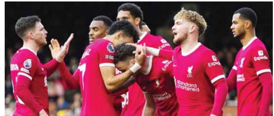
striking ability. First, he received the ball centrally and he delivered a first-time side-footed pass in behind Fulham full-back Antonee Robinson before Diaz's low cross to Jota was struck wide of the right-hand post. Then, after Joao Palhinha brought down Jota on the counterattack, Alexander-Arnold stood over the set-

as Liverpool joined Arsenal on 74 points - one more than defending champion Manchester City, which has a game in hand. Fulham academy graduate Harvey Elliott, who swapped London for Merseyside in 2019, was galvanized by jeers from the home fans as he helped his side create the first chance of the match. The attacking midfielder player instinctively picked out Alexander-Arnold, whose cross could not be directed in by Luis Diaz's glancing header as the ball narrowly missed the inside of the post. Alexander-Arnold then showed off his elite ball-