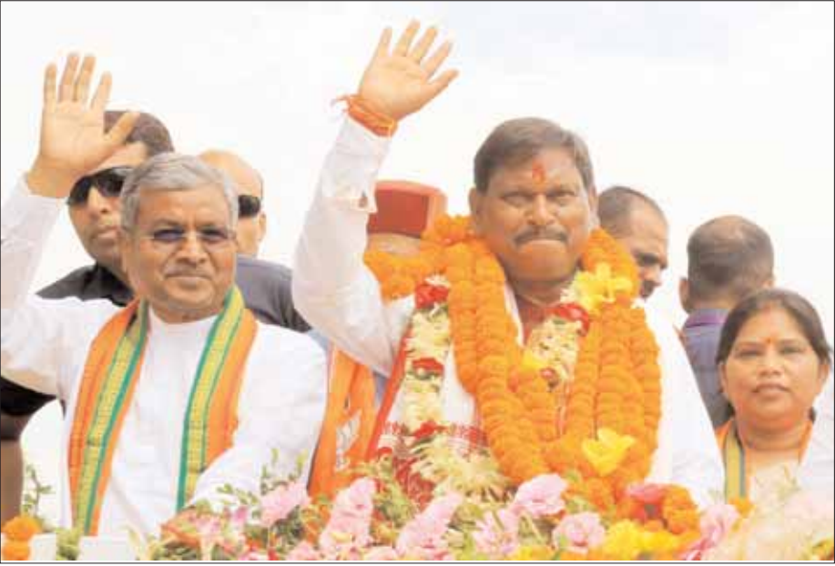
Arjun Munda Union Minister for Agriculture and Farmers Welfare and Khunti Lok Sabha candidate Arjun Munda and State BJP President Babul Marandi during a road show after filling his nomination papers for Khunti Lok Sabha election 2024 in Khunti on Tuesday.