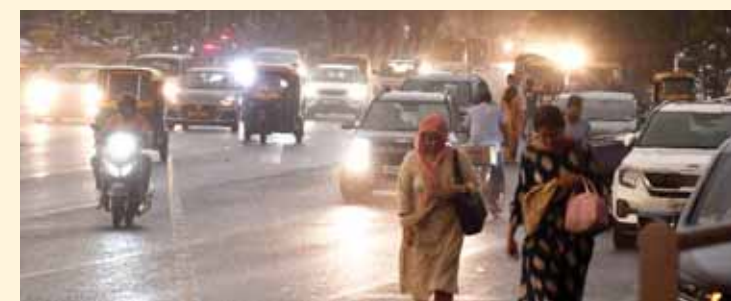
Gusty winds swept the national Capital as parts of Delhi received light rain on Tuesday, bringing respite to people