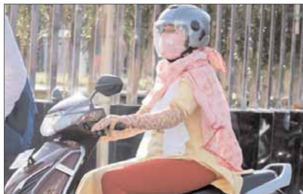
A woman covers herself to get protection from scorching sun on a hot summer day in Ranchi on Tuesday.

The Meteorological Centre has forecast loo in Jharkhand for four days from April 24. This will impact many districts of the state. An alert has been issued regarding this. The information was given by the Ranchi Meteorological Center on 23 April.