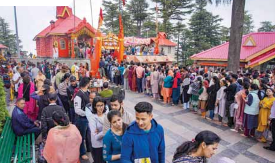
Devotees arrive at Jakhu temple to offer prayers on the occasion of 'Hanuman Jayanti', in Shimla