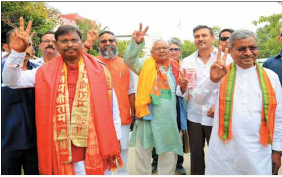
Arjun Munda Union Minister for Agriculture and Farmers' Welfare and Khunti Lok Sabha candidate Arjun Munda, State BJP President Babulal Marandi, AJSU Party Chief Sudesh Mahto along with others during a road show after filing his nomination papers for Khunti Lok Sabha election 2024 in Khunti on Tuesday.