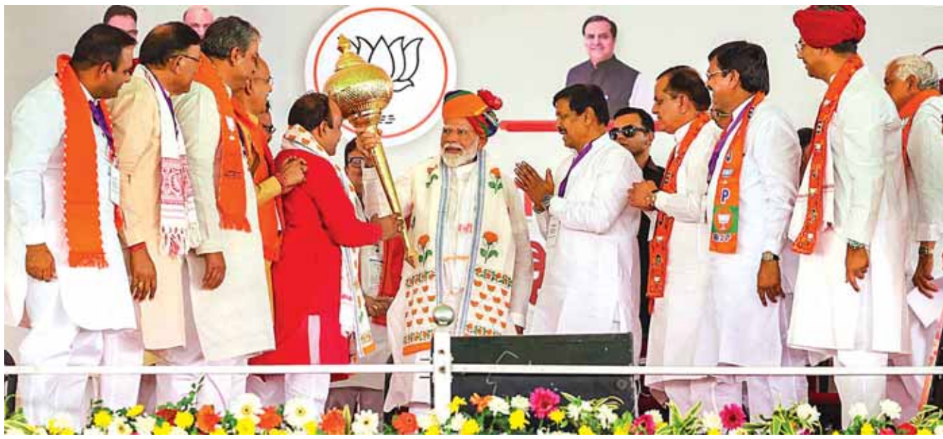
Prime Minister Narendra Modi being felicitated by BJP leaders during a public meeting for Lok Sabha elections in Tonk district Rajasthan on Tuesday

it could not fulfil its intention," Modi claimed.