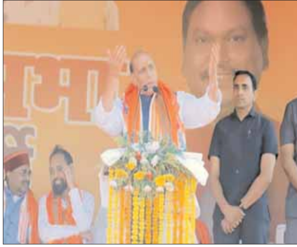
Defence Minister Rajnath Singh addresses public meeting in Khunti Lok Sabha on Tuesday.

from Jharkhand. The Union Home Minister said that the people of Indi Alliance do politics for the family. They do not make society and country. BJP does politics to build society and country. The PM has dedicated his entire life to the people of the country. He still works 18 hours a day. It is because of PM Modi that India is being celebrated all over the world today. India's respect in the world has increased. Singh said that the