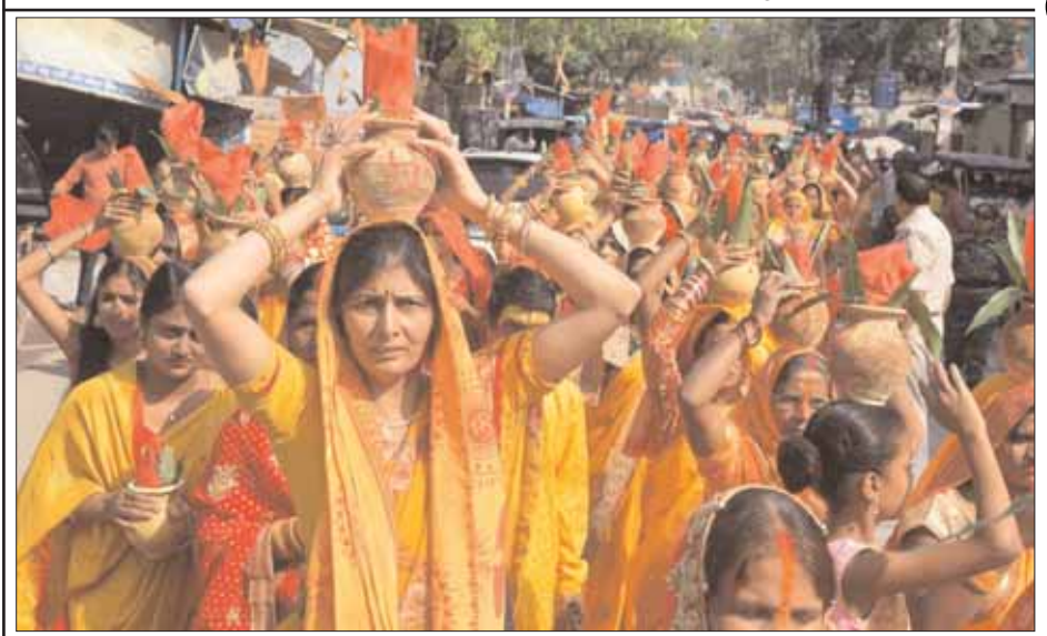
Women devotees participate in 'Kalash Yatra' for the 'Veer Hanumana, Maa Banglamukhi and Baba Bholenath temple' life consecration ceremony, outside Ranchi railway station in Ranchi on Saturday.

The central team expressed satisfaction over the work being done to prevent bird flu. Let us tell you that H5N1 avian influenza has been confirmed in the course of examination of poultry at the Regional Poultry Farm, Hotwar, Ranchi, since then, as a precautionary measure, the purchase, sale and transportation of any live/dead poultry/poultry product and eggs within a radius of one kilometer from the Regional Poultry Farm, Hotwar, Ranchi (infected area) is prohibited till further orders.