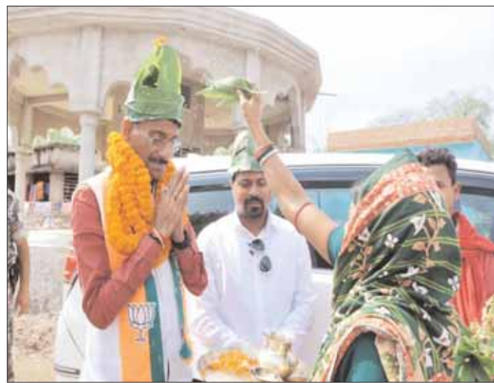
Ranchi MP and Ranchi Lok Sabha candidate Sanjay Seth being welcomed by a woman during an election campaign at Patratu on Saturday.