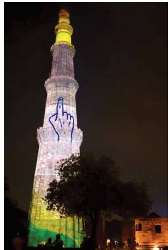
Qutub Minar lights up in spirit of Jashn-e-matdan to celebrate Lok Sabha polls