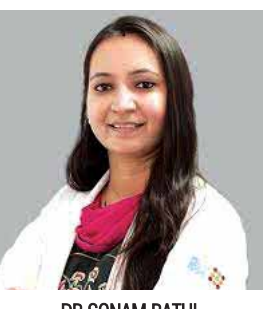
Consultant, ENT Apollomedics Super Speciality

Microtia can affect hearing- if the canal is narrow or completely blockedconductive hearing loss. Also, sensorineural hearing loss is associated malformation/deformity of