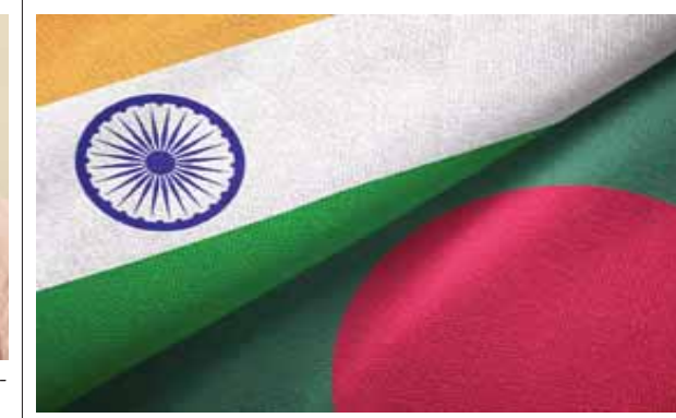
PIONEER NEWS SERVICE NEW DELHI

A Central Government delegation is on a three-day visit to Bangladesh beginning Sunday to further boost bilateral ties on governance matters, according to an official state-