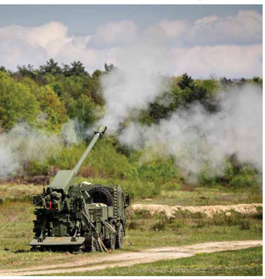
A Bohdana cannon fires in Lviv in Ukraine on Saturday. The Bohdana cannons are produced in Ukraine. Danish Foreign Minister Lars Loekke Rasmussen, Danish Defense Minister Troels Lund Poulsen and members of parliament met with Ukrainian colleagues during a visit to Lviv

Russian shelling on Saturday and overnight wounded at least seven civilians across Ukraine,