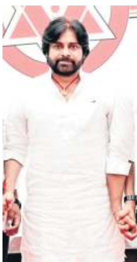
icipate in the election meetings of Prime Minister Narendra Modi.

Meanwhile, Pawan Kalyan will resume his election meetings on April 20. He will address two election meetings every day. He will address constituencies where the alliance's candidates are contesting. Pawan Kalyan will also partic-