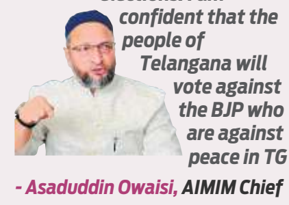
-Asaduddin Owaisi, AIMIM Chief P4

The people of Hyderabad have seen BJP's intentions. They will not accept the vulgar actions of the BJP and the RSS. Is this the 'Viksit Bharat' BJP is talking about? The peace of Hyderabad is more important than elections. I am confident that the people of