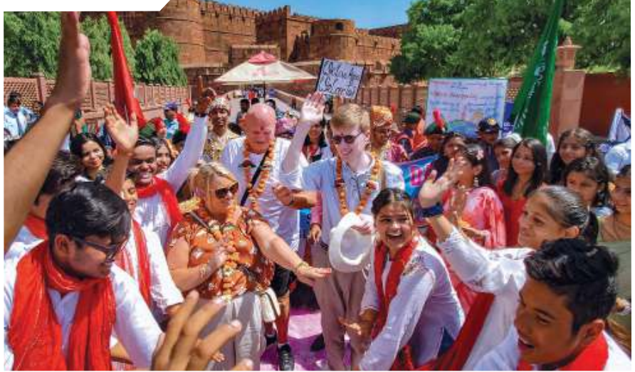
Foreign tourists during celebrations of World Heritage Day at the Agra Fort, in Agra