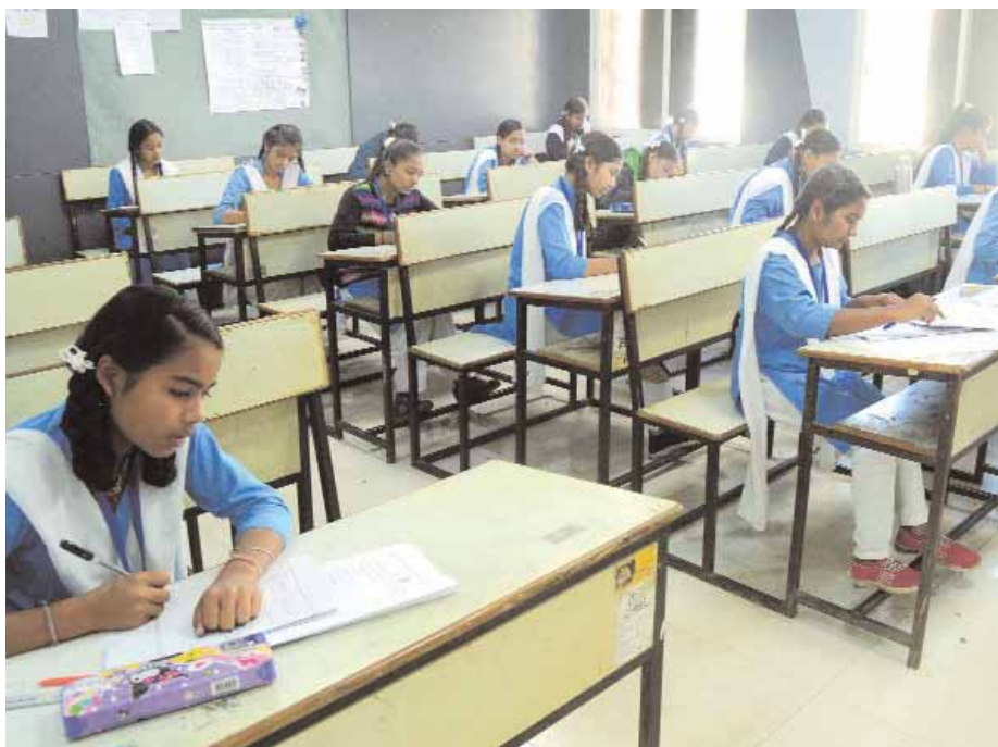
Students appear in the half yearly exams of class 10th and 12th of Madhya Pradesh Board of Secondary Education, in Bhopal on Monday.

Bhopal: Police Commissioner Harinarayan Chari Mishra on Monday imposed a ban on the use, sale, and storage of Chinese thread for kite flying within the city limits. The thread is known to cause harm to avian and human life. On several occasions, it has even led to the death of birds. This thread also causes injuries to pedestrians and two-wheeler riders on the roads during the traditional kite-flying season. The strength of this thread and the glass shards attached to it are the main causes of these accidents. The order, passed under Section 163(2) of the Indian Civil Defence Code, 2023, comes into immediate effect. This order will remain in force for the next two months unless revoked earlier.