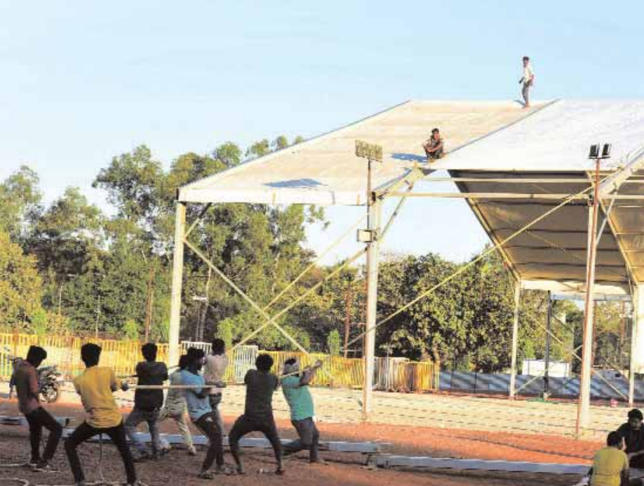
Preparations underway ahead of the Gita Jayanti celebration at Motilal Nehru Police Stadium in Bhopal on Monday.

Service Commission and Union Public Service Commission are included. Similarly, target based schemes include PM Swanidhi, National Livestock Mission (Entrepreneurship Development), Kisan Credit Card (Animal Husbandry), Kisan Credit Card (through Commercial Banks), Kisan Credit Card (through Cooperative Banks), Kisan Credit Card Issuance, Fisherman Credit Card Scheme, Chief Minister Rural Roadside Vendor Loan Scheme, Mukhya Mantri Udyam Kranti Yojana and Chief Minister Economic Welfare, Micro Irrigation and Under Intervention under Drop More Crop under Pradhan Mantri Krishi Sinchai Yojana and Special Financial Assistance