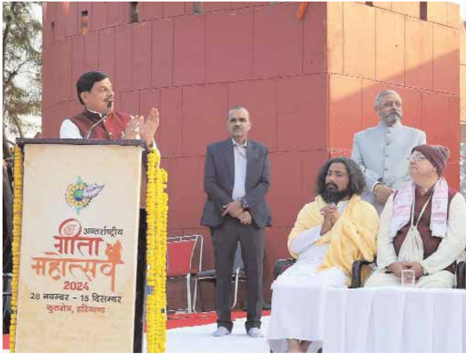
Madhya Pradesh Chief Minister Mohan Yadav addresses the International Gita Mahotsava in Kurukshetra, Haryana on Monday.

the general public with all the pastimes of Lord Krishna. Along with this, a museum named Krishnayana has been developed in Ujjain. Yadav said that activities were conducted on various topics related to the life of Lord Shri Krishna in educational institutions on Janmashtami in Madhya Pradesh. Janmashtami was organized with great pomp by the state government. Lord Shri Krishna has shown us a unique way of worshipping nature through Govardhan Puja. Accepting this, Govardhan Puja was organized everywhere in Madhya Pradesh. To take care of handicapped, destitute, and sick cows, it was decided that cow shelters in the state will be operated by the state government. The grant to cow shelters run by social organizations has been doubled.