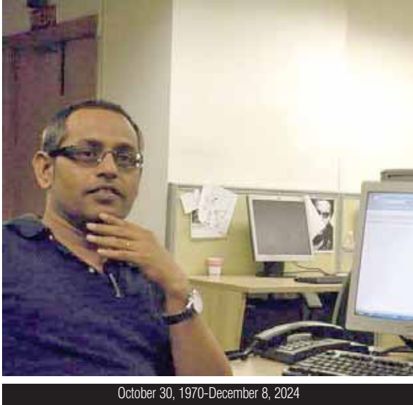
October 30, 1970–December 8, 2024

rial and op-ed pages, setting high standards for every piece. His ruthlessness when it came to quality was legendary—stories that didn't meet his standards were dropped, regardless of the writer's stature. This unwavering commitment to excellence was a rarity and something I greatly respected. His journey in journalism was neither easy nor conventional. He rose through the ranks, trying his hand at various roles—from marketing to circulation—before finding his true calling in journalism. A self-taught professional, he had an intuitive understanding of the craft, coupled with integrity and an unmatched dedication to his work. In his early days of career