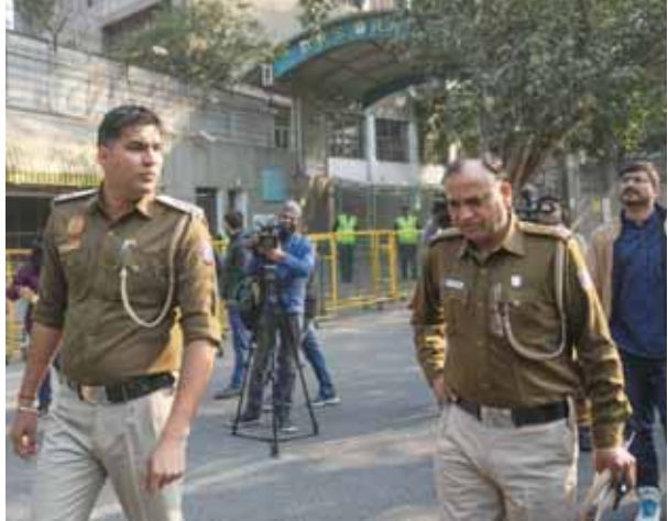
Police personnel outside DPS RK Puram, New Delhi during an investigation after the school received a bomb threat