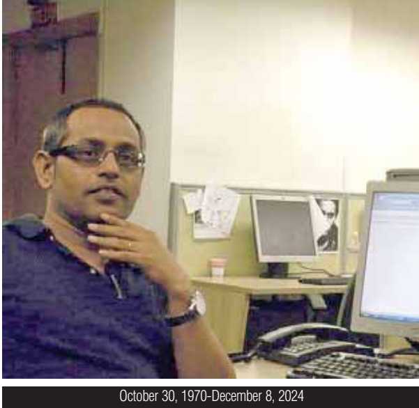
October 30, 1970–December 8, 2024

rial and op-ed pages, setting high standards for every piece. His ruthlessness when it came to quality was legendary—stories that didn't meet his standards were dropped, regardless of the writer's stature. This unwavering commitment to excellence was a rarity and something I greatly respected. His journey in journalism was neither easy nor conventional. He rose through the ranks, trying his hand at various roles—from marketing to circulation—before finding his true calling in journalism. A self-taught professional, he had an intuitive understanding of the craft, coupled with integrity and an unmatched dedication to his work. In his early days of career