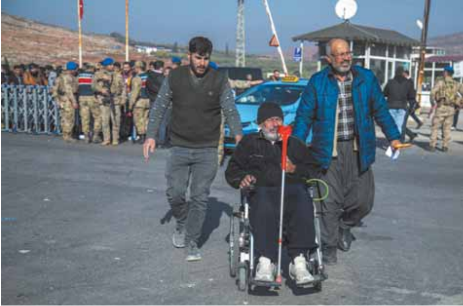
Syrians arrive to cross into Syria from Turkey at the Cilvegözü border gate, near the town of Antakya, southern Turkey.

Observatory for Human Rights said it was not clear if he was killed or died by suicide. Maher Assad, whose whereabouts are unknown, led the army’s 4th Armored Division, which played a major role in the civil war that erupted in 2011, after a popular uprising against Assad led to a violent crackdown on dissent and the rise of an insurgency. Turkey says its allies have taken northern town: Officials in Turkey, which is the main supporter of the Syrian opposition to Assad, say its allies have taken full control of the northern Syrian city of Manbij from a US-supported and Kurdish-led force known as the Syrian Democratic Forces, or SDF. The SDF said a Turkish drone struck in the village of al-Mistriha in eastern Syria, killing 12 civilians, including six children. Turkey views the SDF, which is primarily composed of a Syrian Kurdish militia, as an extension of the banned Kurdistan Workers’ Party, or PKK, which has waged a decades-long insurgency in Turkey. The SDF has also been a key ally of the United States in the war against the Islamic State group.