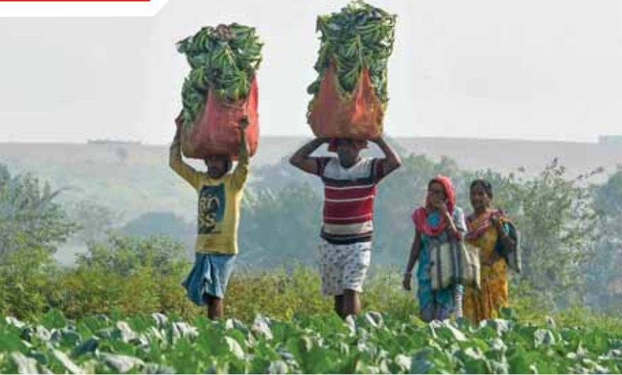
Farmers carry harvested cauliflower at a field on a winter morning, in Kolkata