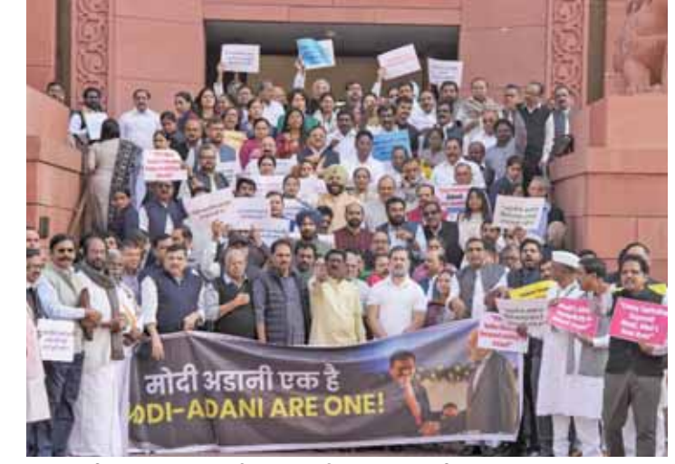
Leader of Opposition in the Lok Sabha Rahul Gandhi and other Opposition MPs stage a protest during the Winter session of Parliament