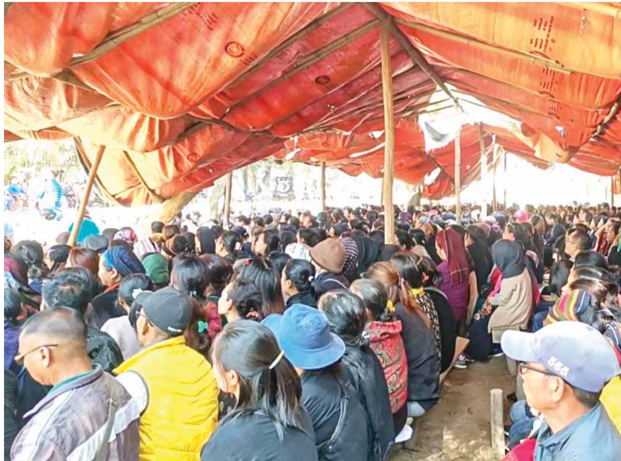
Members of the United Zou Organization (UZO) stage demonstration against the decision to scrap the Free Movement Regime and fence the India-Myanmar border.

Chandigarh has become the country's first administrative unit where 100 per cent implementation of the three criminal laws has been done with Prime Minister Narendra Modi on Tuesday saying these new legislations are becoming protector of citizen's rights and the basis of ease of justice. The laws -- Bharatiya Nyaya Sanhita, Bharatiya Nagrik Suraksha Sanhita and Bharatiya Sakshya Adhiniyam - came into effect on July 1, replacing the British-era Indian Penal Code, Code of Criminal Procedure and the Indian Evidence Act, respectively. Chandigarh has become the country's first administrative unit where 100 per cent implementation of the three laws has been done. Speaking on the occasion, the prime minister said the new criminal laws represent a concrete step towards realising the ideals enshrined in the Constitution for the benefit of all citizens. He said the new laws came into effect at a time when country is moving ahead with the pledge of "Viksit Bharat" and 75 years of adoption of Constitution have been completed, thus the launch of the Bharatiya Nyaya Sanhita, rooted in constitutional values, is a significant occasion.