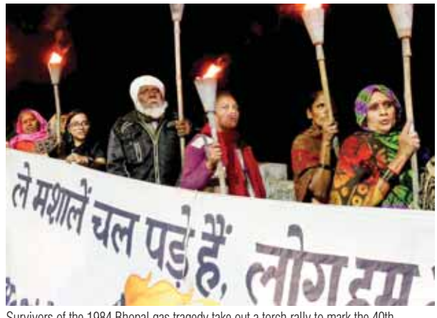
Survivors of the 1984 Bhopal gas tragedy take out a torch rally to mark the 40th anniversary of the disaster.