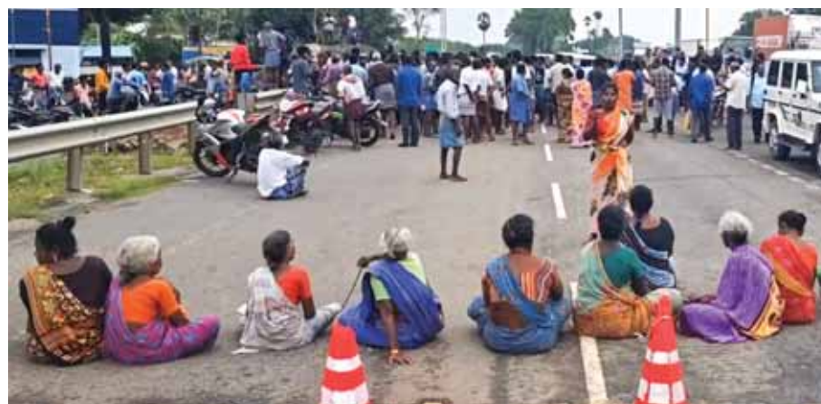
Residents affected by cyclone Fengal in Villupuram block Chennai-Tiruchirappalli National Highway demanding relief from the government.