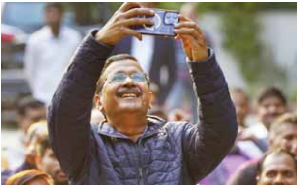
Arvind Kejriwal takes selfies with auto-rickshaw drivers at his residence.

The Government on Monday appointed Revenue Secretary Sanjay Malhotra as the 26th Governor of the Reserve Bank of India. Malhotra, a 1990 Batch Rajasthan Cadre IAS Officer, will replace Shaktikanta Das, whose tenure ends on Tuesday. The Appointments Committee of the Cabinet cleared Malhotra's name, who has been appointed as the RBI Governor for three years, starting Wednesday. Malhotra is an engineering graduate in computer science from the Indian Institute of Technology, Kanpur, and has a Master's in Public Policy from Princeton University, US. In his career of over 33 years, he has worked in multifarious sectors, including power, finance and taxation, information technology, and mines, among others.