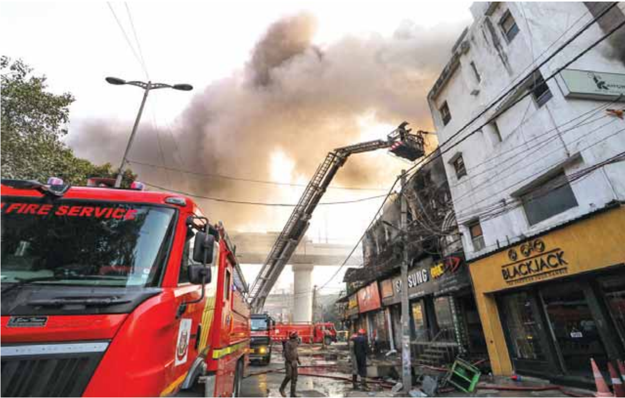
Firefighters try to douse a fire that broke out in a restaurant near Rajouri Garden metro station.