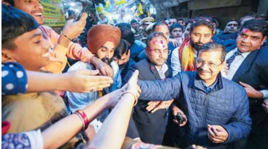
Arvind Kejriwal meets supporters during his 'padyatra' in Karol Bagh area ahead of the Delhi Assembly election.