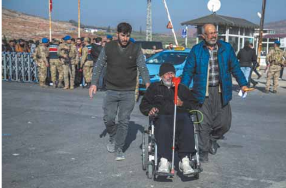
Syrians arrive to cross into Syria from Turkey at the Cilvegözü border gate, near the town of Antakya, southern Turkey.

to have weathered an Arab Spring uprising-turned-civil war. Iraqi insurgents killed US troops with Iranian-designed roadside bombs. Yemen's Houthi rebels fought a Saudi-led coalition to a stalemate. Syria, at the crossroads, played a vital role. Early in Syria's civil war, when it appeared Assad might be overthrown, Iran and its ally, Hezbollah, rushed fighters to support him — in the name of defending Shiite shrines in Syria. Russia later joined with a scorched earth campaign of airstrikes. The campaign won back territory, even as Syria remained divided into zones of government and insurgent control. But the speed of Assad's collapse the past week showed just how reliant he was on support from Iran and Russia — which at the crucial moment didn't come. "What was surprising was the Syrian's army's failure to counter the offensive, and also the speed of the developments,"