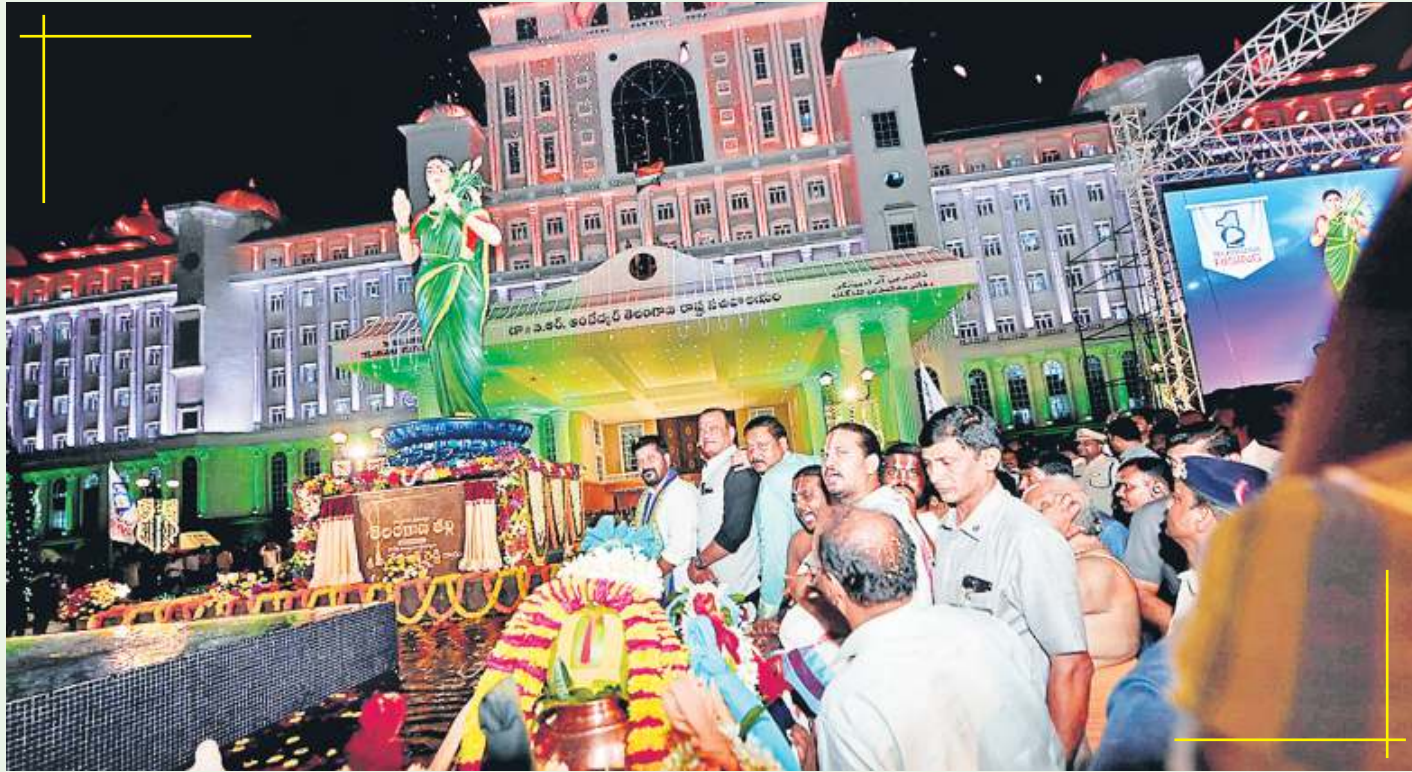
CM Revanth Reddy unveiling the statue of Telangana Thalli on Monday at Secretariat

● Will organise Telangana Thalli celebrations on Dec 9 every year: Revanth