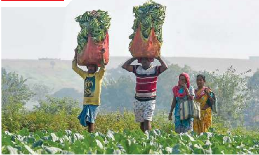
Farmers carry harvested cauliflower at a field on a winter morning, in Kolkata