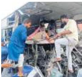
Fire Service staff extricating the body of RTC driver trapped in the cabin following an accident at Dandu Malkapuram in Yadadri Bhuvanagiri district on Monday

The police said that 10 passengers were injured in the accident. They were rushed to hospital. There were 40 passengers at the time of the accident. A massive traffic jam occurred following the accident. Driver dies as bus rams into lorry.