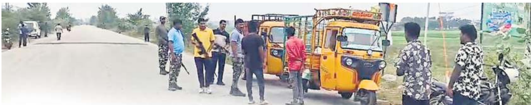
Police personnel keeping watch on a highway in Mulugu district on Monday