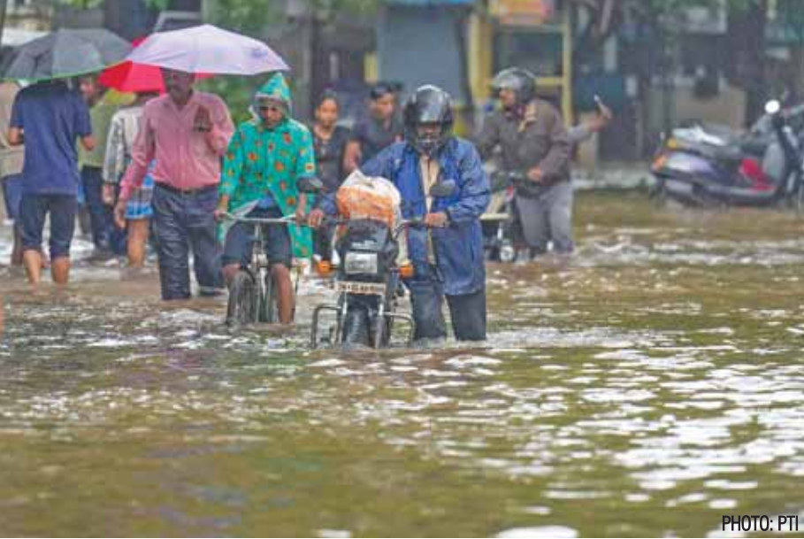
PTI ■ CHENNAI