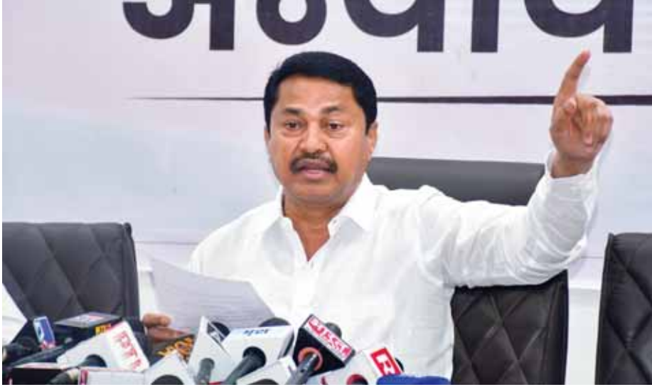
Maharashtra Cong chief Nana Patole wrote to the ECI seeking details and evidence of voter turnout.

The poll-body asserted that a transparent electoral roll updation process was undertaken with the involvement of all political parties. Responding to the issue regarding the voter turnout data, the ECI asserted