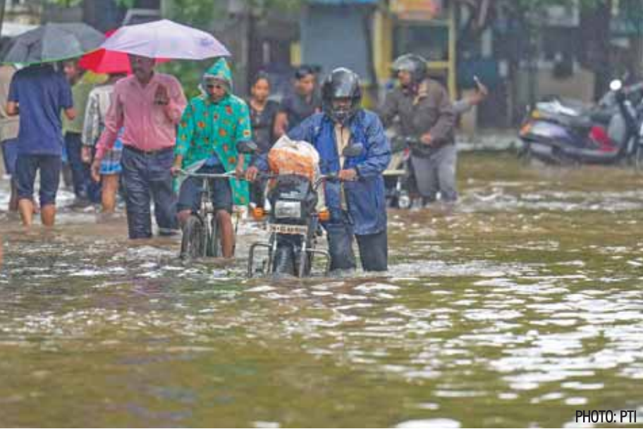
CHENNAI