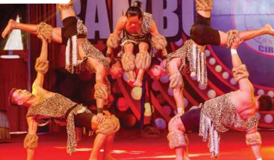
Artistes perform during a show of Rambo Circus, in Mumbai