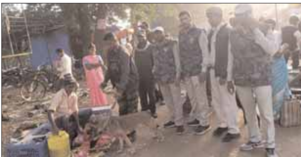
PTR's tracking dog Honey on the prowl for detecting meat of deer and wild boar at Chhipadohar village market.

The Palamu Tiger Reserve has embarked on a mission driving a point home if a poacher gives a slip to guards in the tiger reserve, he is set to be caught in the village market when found with meat of deer and wild boar. Officials of the tiger reserve Palamu are now pressing in its highly trained dog squad to detect sale of meat of deer and wild boar at the village markets which are held in the vicinity of the tiger reserve. The tracking dog Honey, having months long rigorous training at K9 training centre at Panchkula ITBP was on