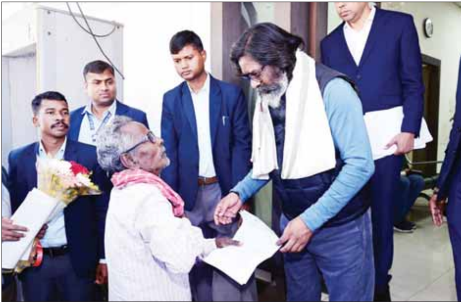
Chief Minister Hemant Soren listening to people's problems in Ranchi on Tuesday.

The State Migrant Control Room received a complaint on 24 September 2024 about 70 Jharkhandi workers stranded in Malaysia's Leadmaster Engineering and Construction Company. It was told that the workers' salary is pending for four months, they are facing problems of non-availability