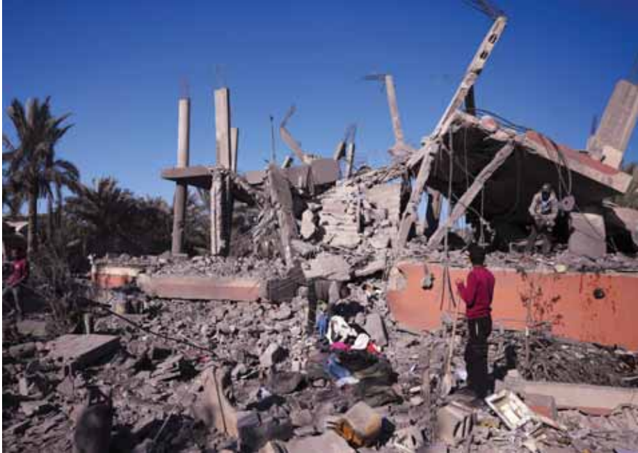
Palestinians check the rubble of a destroyed building following an overnight Israeli strike in Deir al-Balah, Gaza Strip, Wednesday.

Israel's blistering retaliatory offensive has killed at least 44,500 Palestinians, more than half of them women and children, according to Gaza's Health Ministry, which does not say how many of the dead were combatants. Israel says it has killed over 17,000 militants,