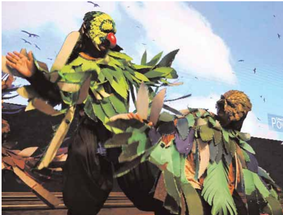
Artists from Rang Sri Little Ballet Troupe theatre perform a ballet 'Jeevan Dhara' during 15th conference of Indian Society of Landscape Architects (ISOLA) at Kushabhau Thackeray convention center in Bhopal on Friday.