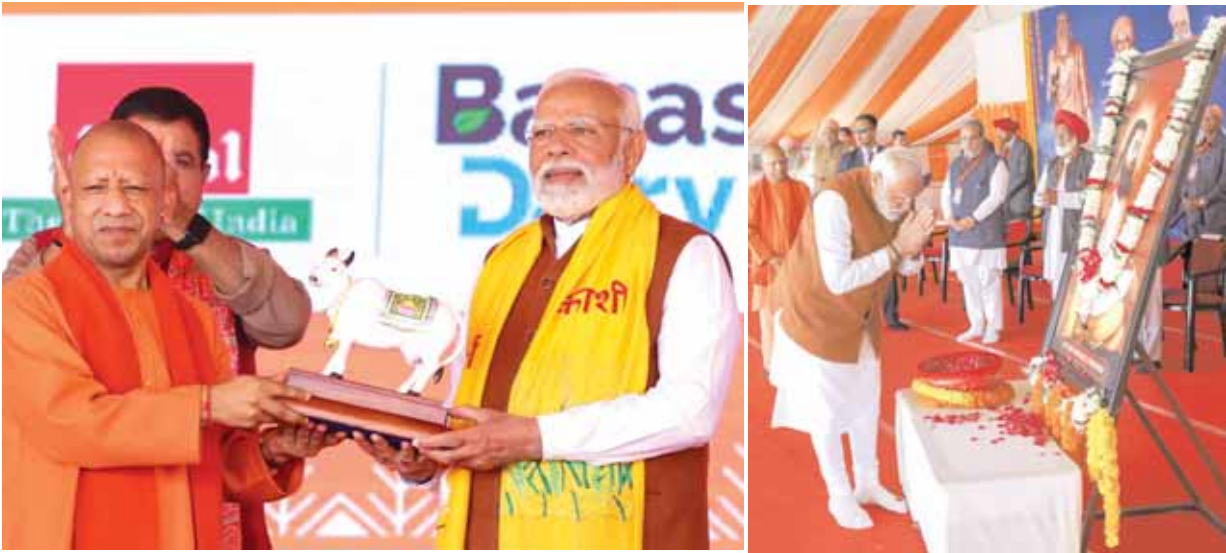
Prime Minister Narendra Modi being presented a memento by UP Chief Minister Yogi Adityanath during dedication ceremony of Kashi Complex of Banas Dairy Plant in Varanasi on Friday. (Right) Prime Minister Narendra Modi pays tribute to Sant Ravidas during his 647th birth anniversary celebrations

Prime Minister Narendra Modi rallied supporters in Varanasi on Friday, outlining his vision for the prospective third term of the National Democratic Alliance (NDA), promising a transformation that would propel India to become the world's third-largest economy. Addressing an enthusiastic crowd at the Banas Dairy Complex, PM Modi pledged to secure all 80 seats in Uttar Pradesh, asserting that the NDA's return to power would elevate India's stature across economic, social, strategic, and cultural fronts. Highlighting the strides made during his tenure, PM Modi emphasised India's ascent from the 11th to the 5th largest economy globally over the past decade, with ambitious plans to further climb the rankings in the next five years. Amid applause, he launched a scathing attack on Opposition leaders, implicitly referencing Congress scion Rahul Gandhi's recent remarks targeting local youths. Modi condemned what he termed as "frustrated" leaders resorting to divisive tactics due to dwindling political fortunes, accusing them of peddling dynasty, appeasement, and caste-based politics. Assuring accelerated developmental initiatives, PM Modi underscored the