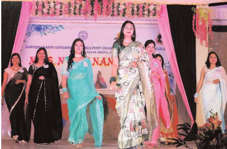
Students walk the ramp during Miss Nutan Nandini contest-2024, in an annual day celebration 'Alankrita' at Government Sarojini Naidu Girls College in Bhopal on Friday.