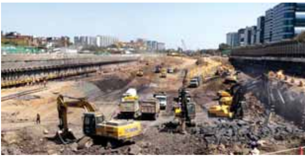
Construction work at the Bandra Kurla Complex Station, a key component of the Mumbai-Ahmedabad High-Speed Rail corridor

The BJP is all set to showcase the ambitious Mumbai-Ahmedabad Bullet Train as the success story of Prime Minister Narendra Modi's third term at the Centre in August 2026 as the party is confident of returning to power. Railway Minister Ashwini Vaishnaw told The Pioneer that a section of about 50 km of the high-speed corridor will be thrown open to the public in August 2026. Vaishnaw said that the Surat-Bilimora section on the 508-