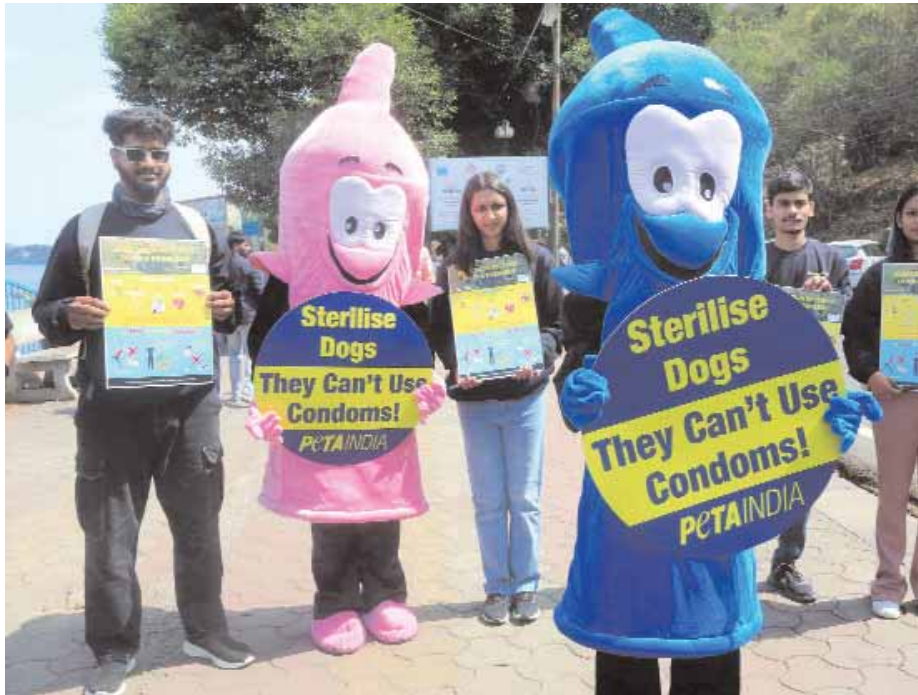
People for the Ethical Treatment of Animals (PETA) activists dressed as giant condoms during an awareness campaign to promote animal birth control ahead of the World Spay Day, at Boat Club in Bhopal on Friday.

of newly constructed sub health centre buildings and CMHO residence at a cost of Rs 0.49 crore in Dhangaon, Kaujya, Barwada, Devran and Palasia. Along with this, a workshop for employment built at a cost of Rs 0.44 crore in village Medhki under the Livelihood Mission and farmer facility centres built under the Pradhan Mantri Agriculture Irrigation Scheme at a cost of Rs 0.37 crore in village Junapani, Badhwa and Luhariya Jat were dedicated. CM Dr. Yadav also dedicated the construction work of Chief Minister Sanjeevani Clinic constructed at a cost of Rs 0.32 crore in Ward Number 7 of Neemuch Municipality and Lawn Tennis Sports Ground costing Rs 0.28 crore in Police Lines Kanavati.