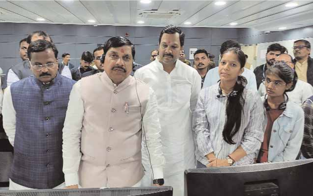
Madhya Pradesh Chief Minister Mohan Yadav speaks on telephone with the complainants of CM Helpline in Ujjain, Madhya Pradesh on Friday.

Even before the system, light rain continues in many districts of the state. There was light rain in Damoh and Sidhi on Thursday. Temperature in many districts including Bhopal, Indore, Guna Due to the jet stream, a drop in day temperature was seen in many districts of the state on Thursday. The day temperature in Bhopal was 27.7 degrees. There was a drop of 3.2 degrees in a single day. Maximum mercury was recorded at 27.8 degrees in Indore, 26.7 degrees in Gwalior, 29 degrees in Ujjain and 28.4 degrees in Jabalpur. Pachmarhi was the coldest in the state on Thursday. The day temperature here was recorded at 23.2 degrees. There has been a drop of 2.2 degrees in 24 hours. It was 24.3 degrees in Raisen, 26 degrees in Tikamgarh, 26.2 degrees in Shivpuri, 26.3 degrees in Guna, 26.8 degrees in Khajuraho.