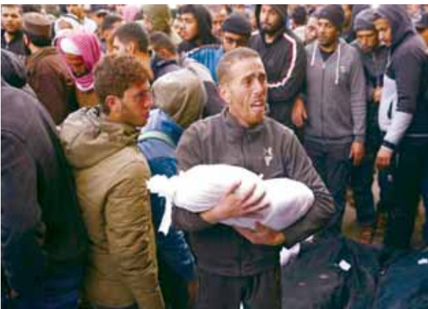
A Palestinian holds the body of a child killed in the Israeli bombardments of the Gaza Strip in front of the morgue to pray over them at Al Aqsa Hospital in Deir al Balah on Friday.