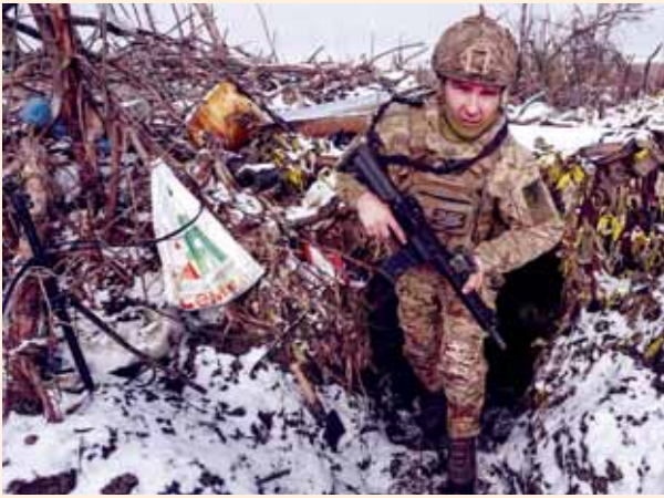
A Ukrainian soldier takes his position on the frontline near Klischchiivka the Donetsk region, in Ukraine on Friday