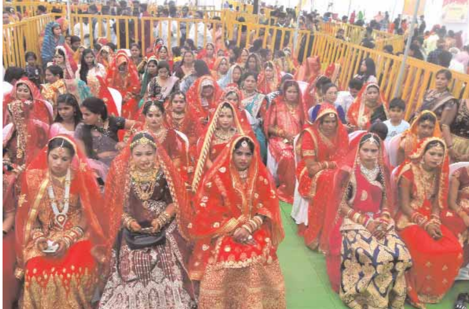
Brides of Ahirwar Community during a mass marriage ceremony under Mukhyamantri Kanyadan Yojana on the occasion of Sant Ravidas Jayanti in Bhopal on Saturday.

for blessings and in the middle there is a Vajra shaped handle and on the lower end there is a triangular blade like structure which completely eliminate ignorance, greed and hatred which are the three obstacles in the path of spirituality and gives control over the three periods of time – present, past and future and it does maintain stability and energetic continuity. Phurba is used to establish stability in the prayer space during ceremonies, as well as in various cultural contexts, such as exorcism, to cure illness, control of weather such as heavy rains, hailstorms, Tantra Sadhana and paving the way for rebirth by freeing wandering souls. It is widely practiced by exorcists, magicians, shamans, and lamas for purposes such as meditation and blessings. The association of the implement with Vajrakilaya represents the transformation of negative energies into positive energies. Its energy is fiery and connects the fundamental processes of the sky with the earth, thereby establishing an energetic continuity. Phurba is Usually made of brass and meteorite but other materials such as metal, wood, bone, horn, or crystal are also used.