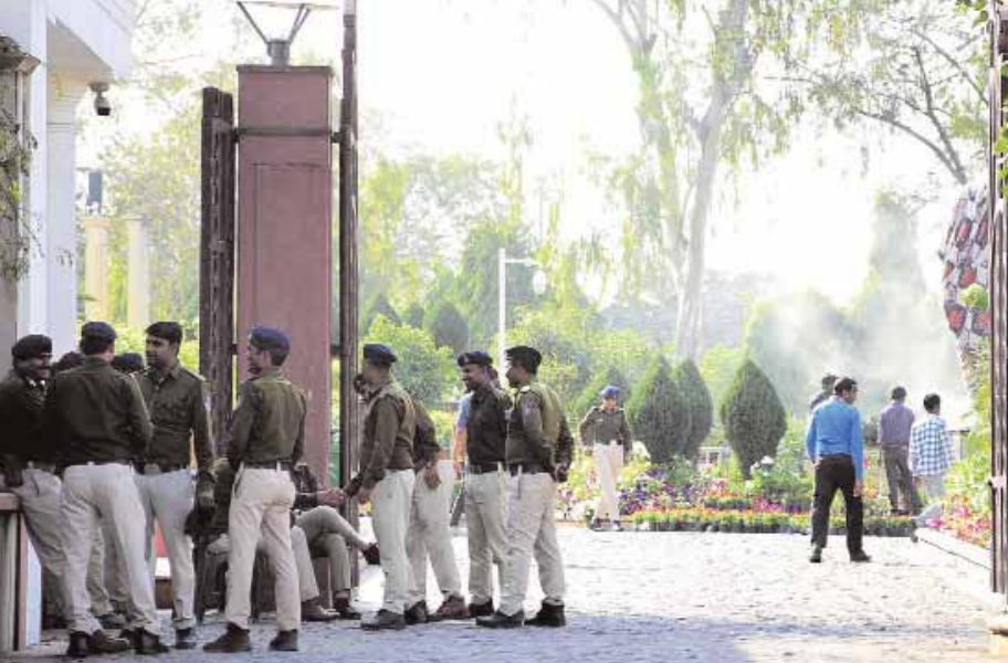
Security beefed up at Kushabhau Thackeray convention center ahead of the visit of Union Home Minister Amit Shah in Bhopal on Saturday.