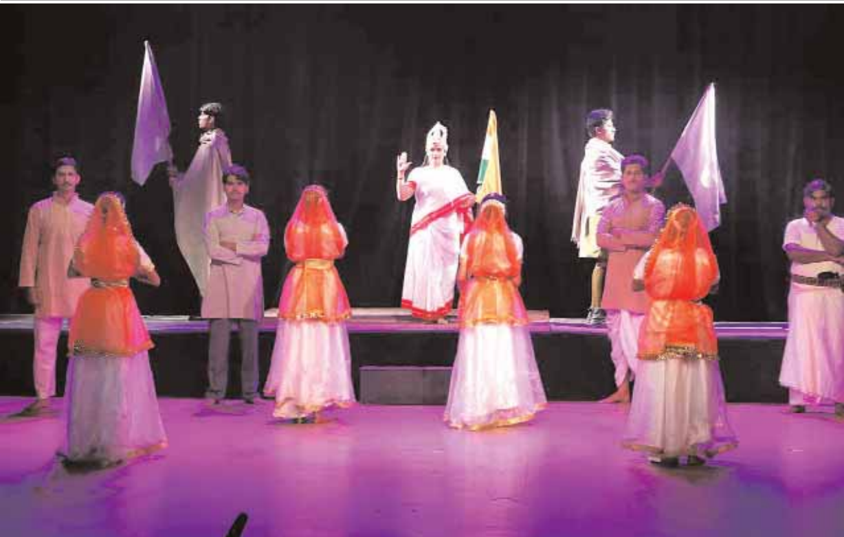
A scene from the play 'Kakori' staged at Shaheed Bhawan in Bhopal on Saturday.

Gwalior-Chambal division. However, there may be clouds in some districts. Earlier on Friday, Pachmarhi remained the coldest day. The maximum temperature recorded here was 23.4 degrees. Whereas, Khargone was the hottest and the mercury reached 32.4 degrees Celsius. Talking about big cities, mercury was recorded at 27 degrees in Bhopal, 27.4 degrees in Indore, 26.6 degrees in Gwalior, 26.7 degrees in Jabalpur and 28.5 degrees in Ujjain. The temperature remained below 28 degrees in Shivpuri, Nowgong, Sagar, Chhindwara, Khajuraho, Guna, Satna and Malajkhand. The mercury remained more than 30 degrees in Mandla, Ratlam, Narmadapuram, Khandwa and Khargone.