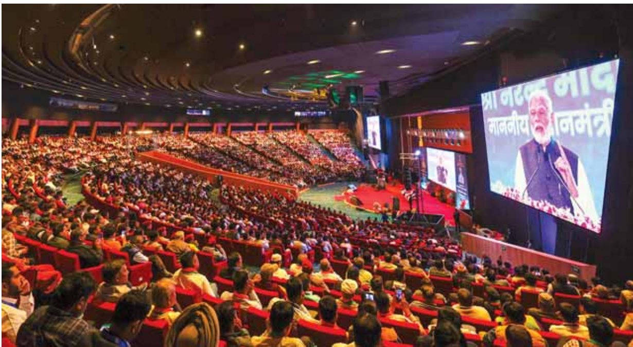
Prime Minister Narendra Modi speaks during the foundation stone laying ceremony of multiple key initiatives for cooperative sector in New Delhi on Saturday

In a strategic move ahead of the forthcoming Lok Sabha elections, Prime Minister Narendra Modi has instructed his Council of Ministers to draft an “actionable, measurable, and clearly defined” plan to be presented at the meeting on March 3. During the last Cabinet meeting on February 21, Modi directed his ministerial colleagues to prepare an action plan for the next 100 days. With the Lok Sabha polls expected to be announced after March 13, he has urged them to engage in extensive consultations, including with experienced individuals such as senior bureaucrats, grassroots workers, and domain experts, before finalising their action plans, according to sources. During the meeting, Modi tasked his ministers with outlining key initiatives and deliverables for the next 100 days, along with a comprehensive five-year roadmap. These documents, focusing on the Government’s priorities and strategies, are to be submitted to the Cabinet Secretariat. Sources said Modi has instructed them and their ministries to brainstorm over the agenda for the period, which is also the likely duration before a new government takes office