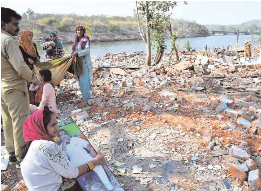
Local residents near the debris after their houses were demolished by Municipal Corporation employees and district administration officials in compliance with an order of National Green Tribunal to remove shanties near Bhadbhada dam in Bhopal on Saturday.