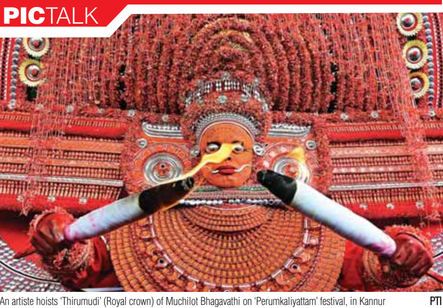
An artiste hoists 'Thirumudi' (Royal crown) of Muchilot Bhagavathi on 'Perumkaliyattam' festival, in Kannur

untenable as it earns the major share of revenue from tourism; the recent decline in Indian tourist numbers has hit it hard. Holding the top spot just three weeks ago, Indian tourist arrivals have now slipped to the fifth position. India and the Maldives share ethnic, linguistic, cultural, religious and commercial links steeped in antiquity. The relations have been close, cordial and multi-dimensional: India was among the first nations to recognise the Maldives after its independence in 1965 and to establish diplomatic relations with it. Now, India must adopt a nuanced and strategic approach to maintain influence in the Maldives and counterbalance China's expanding footprint. Strengthening diplomatic ties with our neighbour is paramount. Besides, India should bolster economic cooperation by offering viable alternatives to Chinese investments. Initiatives that promote sustainable development and address the Maldives' economic concerns can help strengthen economic ties. It goes without saying that India would have to back the pro-India Maldivian leaders; for example, the pro-India Maldivian Democratic Party (MDP) has recently claimed a landslide in Male's mayoral election. This is indeed a good sign for India and, if Muizzu is impeached, India could have the chance to re-establish its cordial relations with the Maldives that it has always had.