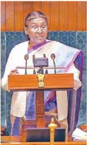
President Droupadi Murmu addresses the joint session of Parliament on the opening day of the Budget session, in New Delhi

President Droupadi Murmu on Wednesday hailed the Modi Government's big-ticket reforms in the last 10 years and mentioned that the centuries-old desire to build a Ram temple in Ayodhya has now become a reality, while apprehensions over the abrogation of Article 370 are a thing of the past. In her first address to a joint sitting of the two Houses in the new Parliament building, during which she touched on varied issues ranging from insurgency to inflation, Murmu said a country can progress at a fast pace only when it defeats the challenges of the past and puts maximum energy into building the future. Murmu arrived in a buggy at Parliament House to deliver her address to the joint sitting of the Lok Sabha and the Rajya Sabha. She entered the House with the "sengol" being carried in front of her. She asserted that the armed forces were giving a befitting reply to terrorism and expansionism. Murmu also mentioned that India is now a prominent voice against terrorism in the world.