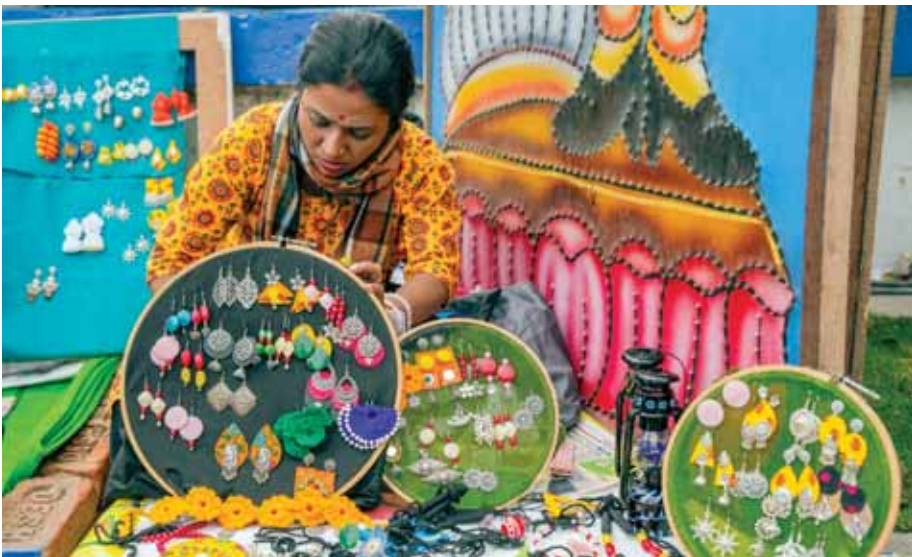
A woman prepares handmade ornaments on the sidelines of the 47th International Kolkata Book Fair, in Kolkata on Wednesday

new set of guidelines issued by the Assam government. It was earlier stopped due to restrictions imposed by the judiciary. Assam Chief Minister Himanta Biswa Sarma and his family members had visited Hayagriva Madhav temple at Hajo in Kamrup district and witnessed the bird fight with hundreds of visitors on Magh Bihu day. "Breathing life into our ancient customs and rituals has been a cornerstone of our policies. After nearly a decade, I was able to witness the bulbuli fight, a quintessential Bihu tradition which was recently revived by our government," he had said after watching. Likewise, the government's Standard Operating Procedure (SOP) also allowed buffalo fights, which took place on January 16 in Morigaon, Sivasagar and some Upper Assam districts, with some precautions.