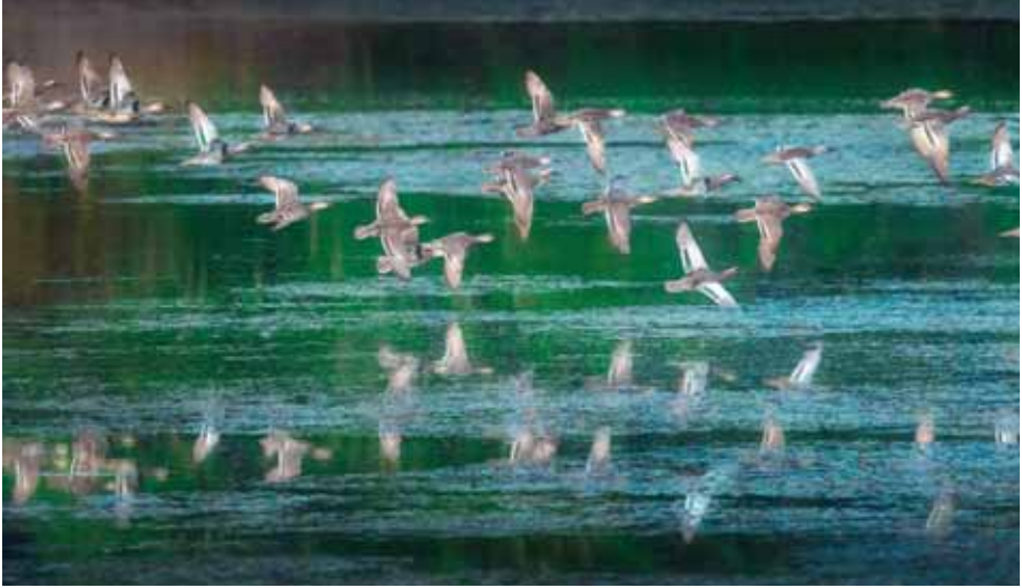
Karaivetti bird sanctuary in Tamil Nadu

encroachment, industrial development, waste dumping, and poaching are strictly prohibited within these designated areas. An official from the Ministry provided insights into the ecological importance of the newly designated sites. Ankasamudra Bird Conservation Reserve, a human-made Village Irrigation Tank, is rich in biodiversity, hosting various plant and animal species. The Aghanashini Estuary, formed at the confluence of the Aghanashini River and the Arabian Sea, provides diverse ecosystem services and supports a significant population of waterbirds. Additionally, the mangroves