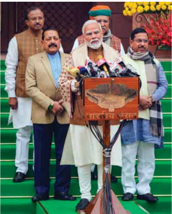
Prime Minister Narendra Modi addresses the media on the first day of the Budget session of Parliament on Wednesday. Union Ministers Pralhad Joshi, Arjun Ram Meghwal, Jitendra Singh and V Muralaeeharan are also seen

Prime Minister Narendra Modi asserted on Wednesday that the country is reaching new heights of progress, and its journey of "all-inclusive and all-round" development will continue with the people's blessings. In his customary remarks to the media before the Budget Session, Modi greeted them with "Ram Ram" (an invocation of Lord Ram) and noted that there is a tradition of not presenting a full Budget before the polls. "We will follow the same tradition and present a full-fledged budget before you after a new government is formed," he said, adding that Finance Minister Nirmala Sitharaman will, in her Budget to be tabled on Thursday, introduce measures showing a direction. Modi has frequently expressed confidence that his government will retain power in the elections. Ahead of Parliament's last session before the Lok Sabha polls, the PM took aim at Opposition MPs for disrupting parliamentary proceedings, saying those habituated to creating a ruckus and disrobing