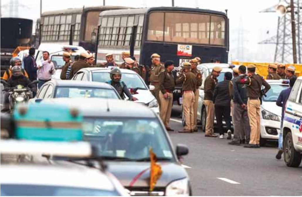
Security personnel deployed at Ghazipur border in view of farmers' Delhi Chalo March, in New Delhi, on Sunday. A large number of farmers from Uttar Pradesh, Haryana and Punjab are expected to march towards the national Capital on Tuesday

The Centre has invited representatives of the Samyukta Kisan Morcha (non-political) and the Kisan Mazdoor Morcha to hold another meeting to discuss their demands on February 12. Three Union Ministers — Piyush Goyal, Arjun Munda and Nityanand Rai, will hold talks with farmers' in Chandigarh. The meeting will be held at the Mahatma Gandhi State Institute of Public Administration in Sector 26. Meanwhile, Punjab Chief Minister Bhagwant Mann has accused the Haryana Government of creating a border "between Punjab and India", referring to the concrete blocks, nails and barbed wire placed on some roads to scuttle the farmers' proposed 'Delhi Chalo' march. He said the Manohar Khattar-led Haryana Government has placed as much barbed wire at the State's borders with Punjab as there is at the country's border with Pakistan. Khattar, however,