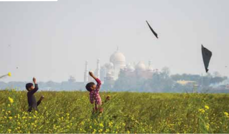
Children fly kites in a field in the backdrop of the Taj Mahal, in Agra