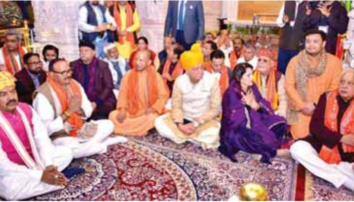
Uttar Pradesh Chief Minister Yogi Adityanath with Deputy Chief Ministers KP Maurya and Brajesh Pathak, UP Assembly Speaker Satish Mahana and State legislators during a visit to the Ram Temple in Ayodhya on Sunday

Sources indicate that Manjhi had a meeting with an emissary of RJD supremo Lalu Prasad a day earlier, and now he is attempting to exert his influence with four MLAs in his camp, including the former's son, who was sworn in as part of the newly formed Nitish Ministry.