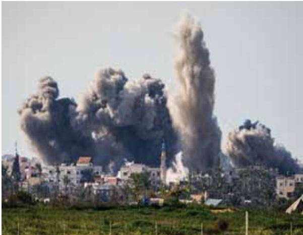
Smoke and explosion following an Israeli bombardment inside the Gaza Strip, as seen from southern Israel, Sunday. The army is battling Palestinian militants across Gaza in the war ignited by Hamas' Oct. 7 attack into Israel.

Egypt is threatening to suspend its peace treaty with Israel if Israeli troops are sent into the densely populated Gaza border town of Rafah, and says fighting there could force the closure of the territory's main aid supply route, two Egyptian officials and a Western diplomat said on Sunday. The threat to suspend the Camp David Accords, a cornerstone of regional stability for nearly a half-century, came after Prime Minister Benjamin Netanyahu said sending troops into Rafah was necessary to win the four-month-old war against the Palestinian militant group Hamas. Over half of Gaza's population of 2.3 million have fled to Rafah to escape fighting in other areas, and are packed into sprawling tent camps and UN-run shelters near the border. Egypt fears a mass influx of hundreds of thousands of Palestinian refugees who may never be allowed to return.