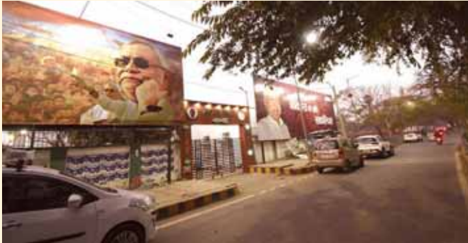
Deserted Janata Dal (United) office ahead of the floor test of Bihar Chief Minister Nitish Kumar-led Government in Patna on Sunday

The Samyukta Kisan Morcha (non-political) and the Kisan Mazdoor Morcha had announced the 'Delhi Chalo' march by more than 200 farmers' unions on February 13 to press the Centre into accepting several demands, including the enactment of a law to guarantee a minimum support price (MSP) for crops, implementation of the Swaminathan Commission's recommendations, provision of pensions for farmers and farm laborers, forgiveness of farm debts, withdrawal of police charges, and seeking justice for victims of the Lakhimpur Kheri violence.