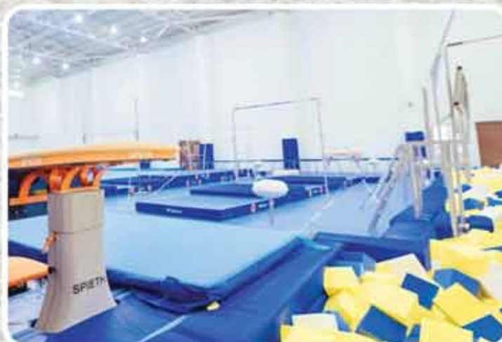
Gymnastics Academy, Rourkela