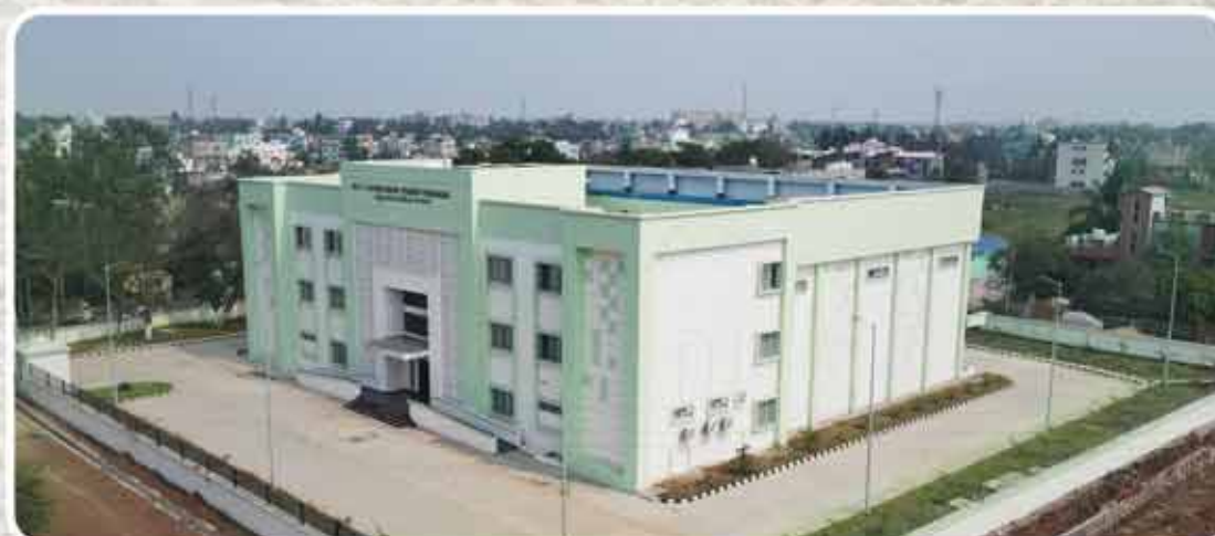
48 Multipurpose Indoor Stadiums