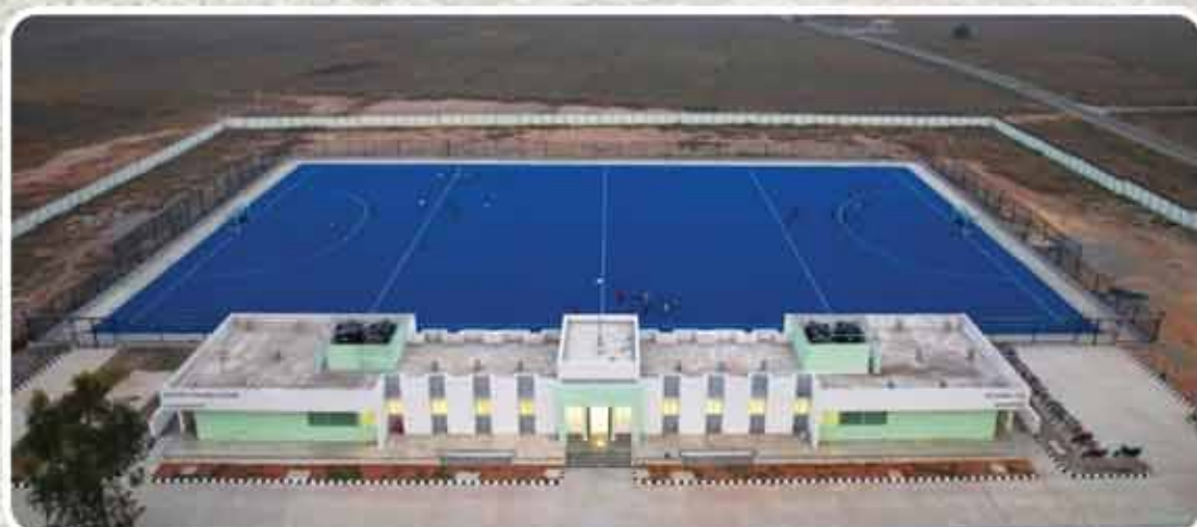
12 Hockey Training Centres