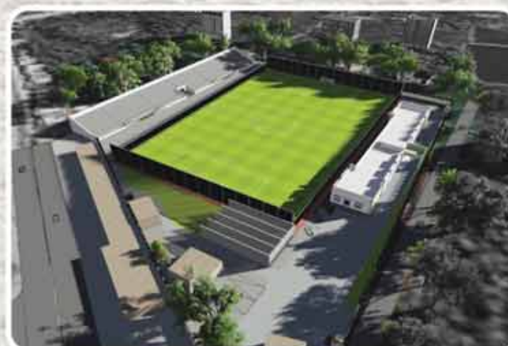
Women Football Training Centre, Aul, Kendrapara