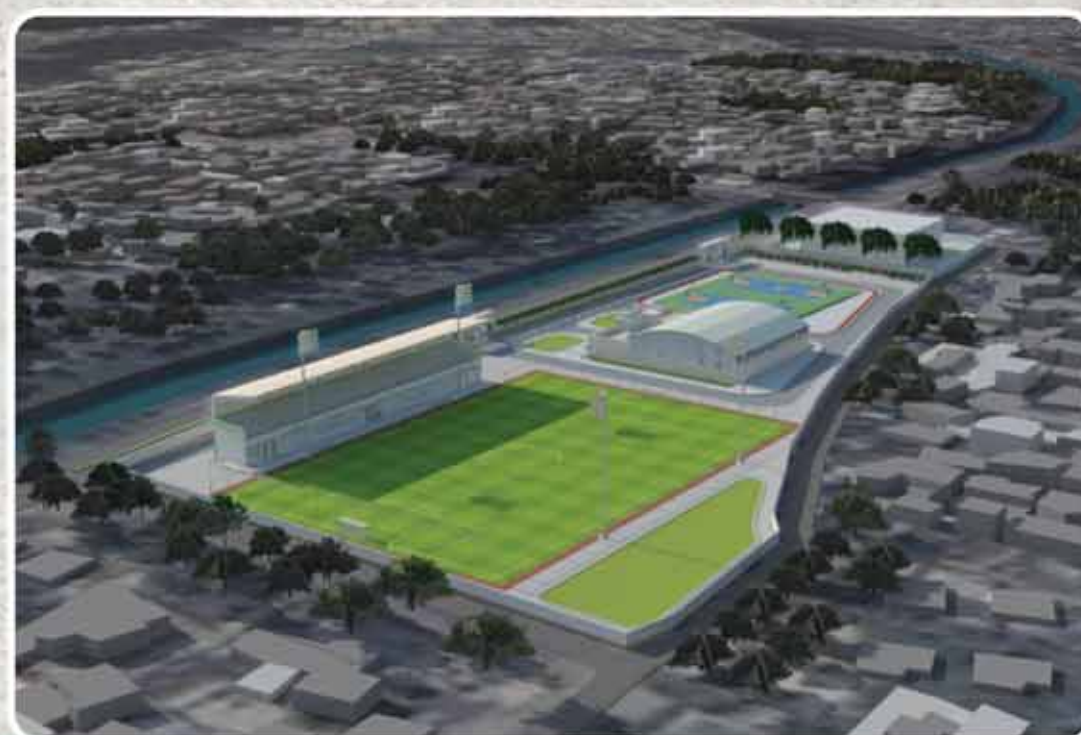
Football Training Centre Cuttack