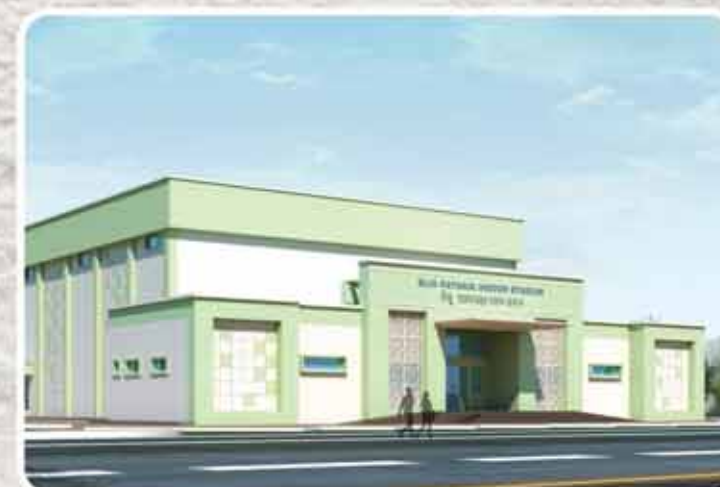
Multipurpose Indoor Stadiums Remuna, Baliguda, Karanjia, Titilagarh