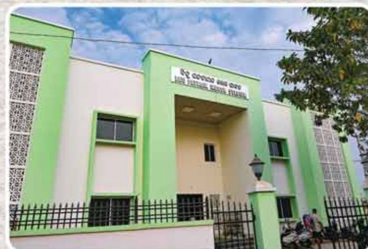
Multipurpose Indoor Hall, Bhawanipatna