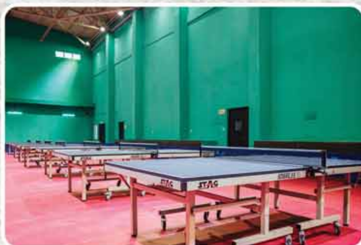
Table Tennis Academy Cuttack