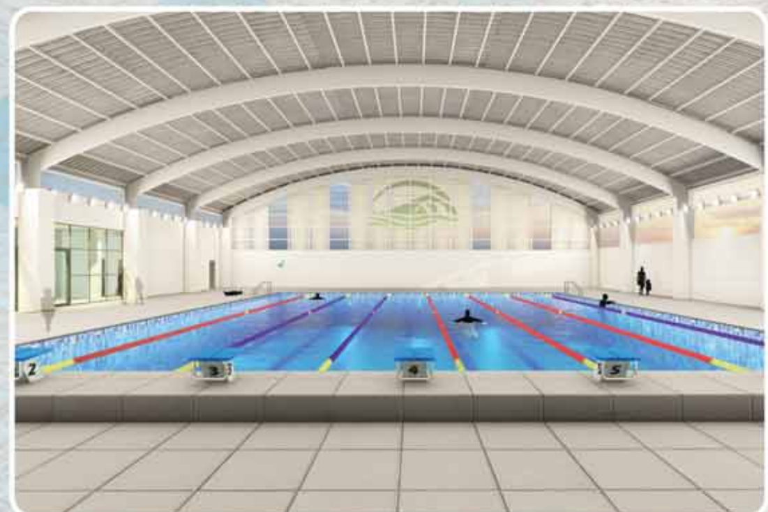
Indoor Swimming Pool, Bhadrak