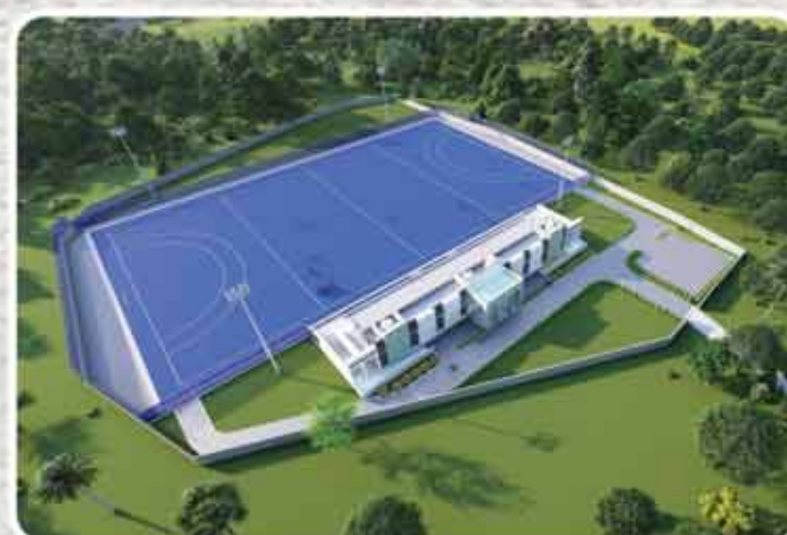
Hockey Training Centre Deogarh