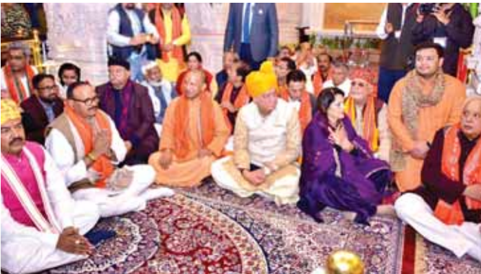
Uttar Pradesh Chief Minister Yogi Adityanath with Deputy Chief Ministers KP Maurya and Brajesh Pathak, UP Assembly Speaker Satish Mahana and State legislators during a visit to the Ram Temple in Ayodhya on Sunday