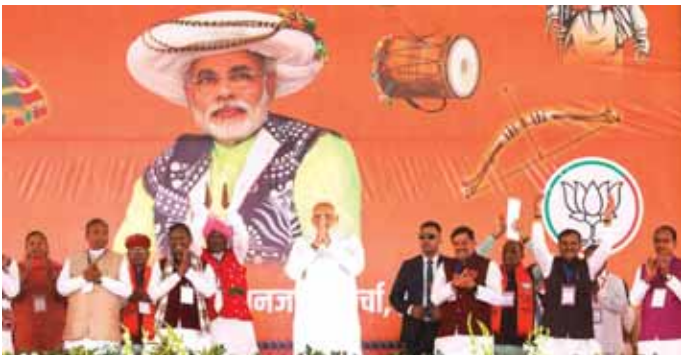
Prime Minister Narendra Modi with Madhya Pradesh Governor Mangu Bhai Patel, Chief Minister Mohan Yadav and others at the dedication and foundation stone laying ceremony of various development projects during Janjatiya Sammelan in Jhabua, Madhya Pradesh on Sunday

the Congress and its allies are resorting to last ditch-tactics, the PM said, adding that "loot and divide" is the motto of the Congress. "The Congress when it is in power indulges in loot, while out of power engineers divisions (in society) based on language, region and caste," he said here. The Congress has drowned in its own sins and the more it will make efforts to come up the further it will slide down, the PM asserted. It got decimated in the 2023 (Assembly polls) and will be wiped out in the upcoming Lok Sabha polls, he said. "The people showed the mirror to the Congress in the Assembly polls. The mood of the nation is similar in the upcoming Lok Sabha polls," Modi asserted. The PM asked voters to ensure