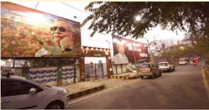
Deserted Janata Dal (United) office ahead of the floor test of Bihar Chief Minister Nitish Kumar-led Government in Patna on Sunday

13. In a notification, the Haryana Government said dogle services provided on mobile phones, will remain suspended and only voice calls would go through. In Sonipat, the district administration has asked fuel pump owners to not fill up bottles or other containers. A 10-litre cap has been introduced for tractors. The administration has warned that providing fuel to those associated with the farmers' protest will attract action.