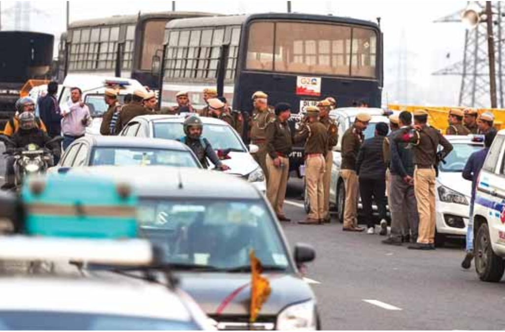
Security personnel deployed at Ghazipur border in view of farmers' Delhi Chalo March, in New Delhi, on Sunday. A large number of farmers from Uttar Pradesh, Haryana and Punjab are expected to march towards the national Capital on Tuesday

In a bid to avoid a re-run of the 2020 Farmers' protest in the Delhi-NCR, the Haryana and the Delhi Police have left no stone unturned to prevent any untoward situation for the farmers' 'Chalo Delhi' protest scheduled to be held on Tuesday. Large cement barricades, nails punched on access roads, suspension of internet and bulk SMS services, and heavy police deployment to block the farmers have been put in place at the borders. The Centre has invited representatives of the Samyukta Kisan Morcha (non-political) and the Kisan Mazdoor Morcha to hold another meeting to discuss their demands on February 12. Three Union Ministers — Piyush Goyal, Arjun Munda and Nityanand Rai, will hold talks with farmers' in Chandigarh. The meeting will be held at the Mahatma Gandhi State Institute of Public Administration in Sector 26. Meanwhile, Punjab Chief Minister Bhagwant Mann has accused the Haryana Government of creating a border "between Punjab and India", referring to the concrete blocks, nails and barbed wire placed on some roads to scuttle the farmers' proposed 'Delhi Chalo' march. He said the Manohar Khattar-led Haryana Government has placed as much barbed wire at the State's borders with Punjab as there is at the country's border with Pakistan. Khattar, however,