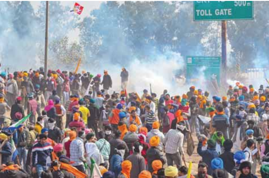
Farmers face tear gas used by the police to disperse them during the second day of their 'Delhi Chalo' march, at the Punjab-Haryana Shambhu border near Patiala on Wednesday