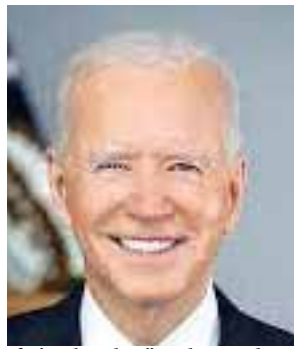
if it's a burden," Biden said.

"When America gives its word, it means something. When we make a commitment, we keep it. And NATO is a sacred commitment. Donald Trump looks at this as