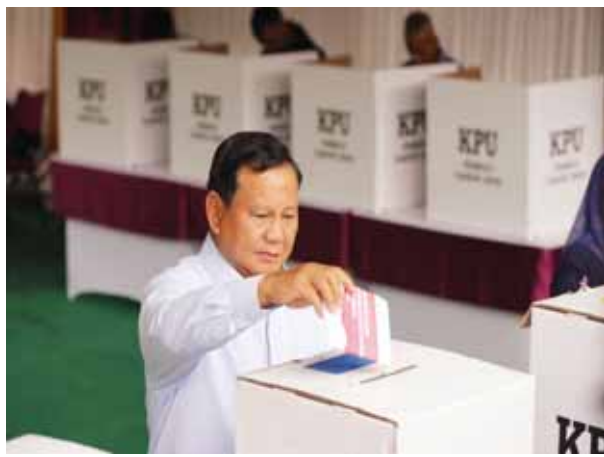
Indonesian presidential candidate Prabowo Subianto casts his ballot at a polling station during the election in Bojong Koneang, Indonesia on Wednesday.

"We are grateful for the quick count results," he said in the speech, broadcast on national television. "We should not be arrogant, we should not be proud, we should not be euphoric, we still have to be humble, this victory must be a victory for all Indonesian people." To avoid a runoff against his rivals, Anies Baswedan and Ganjar Pranowo, Subianto