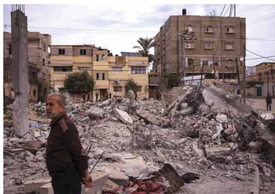
Neighbors inspect the rubble of the Hasouna family house, which was struck by an Israeli airstrike during an operation to rescue two hostages in Rafah, southern Gaza Strip on Tuesday.