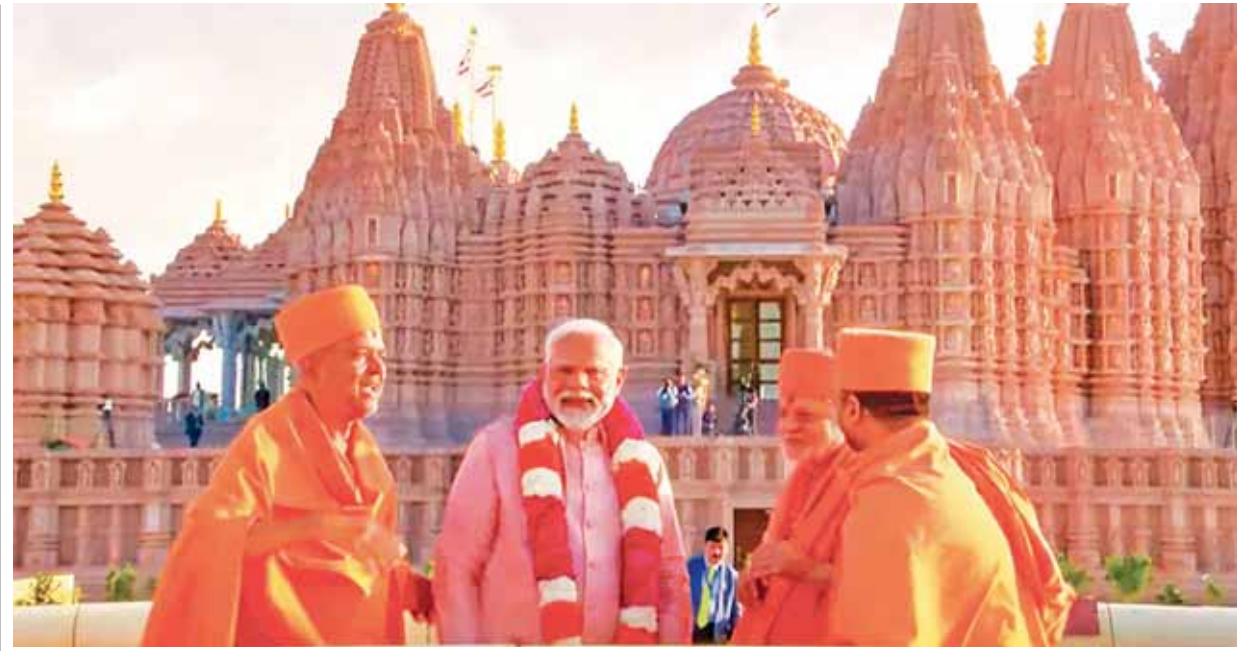
Prime Minister Narendra Modi during the inauguration of the BAPS Hindu Mandir, in Abu Dhabi on Wednesday

Agriculture Minister, discussed various farmer issues with Munda, who is currently in charge of the Agriculture Ministry. Munda is also one of the Ministers who held discussions with farmer groups," the sources added. Earlier, the Agriculture Minister said efforts to engage in constructive dialogue with the farmers' union persist. The Minister also expressed readiness to hold discussions considering all viewpoints and appealed for a conducive environment for dialogue.