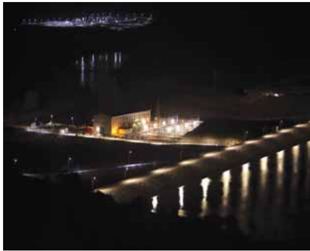
A general view of the Cöpler gold mine near Ilic village, eastern Turkey on Tuesday.

Other workers at the mine have also joined the efforts to rescue their colleagues, while