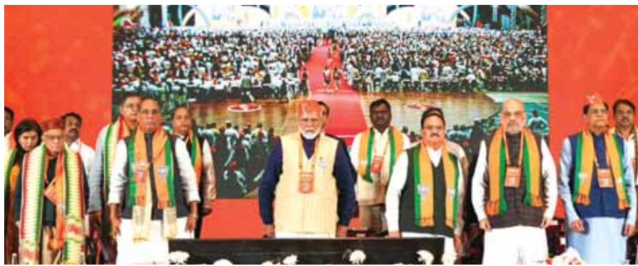
Prime Minister Narendra Modi with Union Ministers Rajnath Singh, Amit Shah and Piyush Goyal, BJP national president JP Nadda, veteran BJP leader Murli Manohar Joshi and others during the BJP National Council meeting at the Bharat Mandapam in New Delhi on Saturday