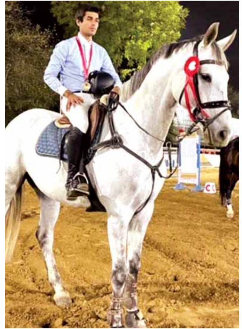
Tejas in Bengaluru with Tiens Key