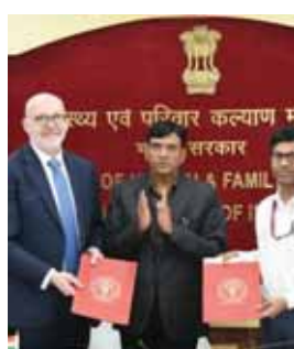
strategic goals in order to deliver cutting edge medical innovation and personalised cancer treatments, said a release issued by the Health Ministry.

The All India Institute of Medical Sciences (AIIMS), Delhi and University of Liverpool have entered into a collaboration for "AIIMS Liverpool Collaborative Centre for Translational Research in Head and Neck Cancer - ALHNS". It will impact the care of patients with head and neck cancer by combining resources at both institutions in order to develop joint research and education programmes. It is expected to enhance the quality of research and education. The ALHNS also aims to have commonly articulated