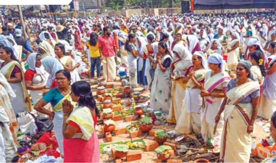
Women devotees offer prayers during the Attukal Pongala festival, in Thiruvananthapuram