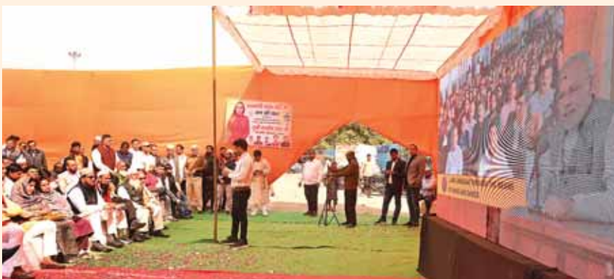
Delhi BJP organises a programme in Old Delhi to listen to PM's Mann Ki Baat