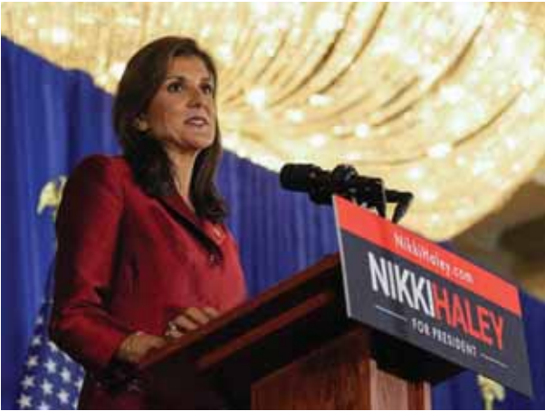
Republican presidential candidate former UN Ambassador Nikki Haley speaking at an election night event, Saturday in Charleston, S.C.

Saturday's result now places the onus on Haley, who continued in her concession speech to insist she has no plans to drop out of the race – a move that she said would leave the Republican voters in the upcoming primary states with "a Soviet-style