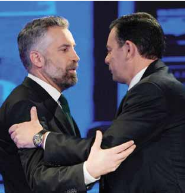
Socialist Party leader Pedro Nuno Santos, left, and Luis Montenegro, leader of the Social Democratic Party, greet each other before an election TV debate in Lisbon, Portugal. The center-left Socialist Party and center-right Social Democratic Party have alternated in power for decades. But they are unsure of how much support they might need from smaller rival parties to form a government after the March 10 vote.

Corruption scandals have cast a shadow over the ballot. They have also fed public disenchantment with the country's political class as Portugal prepares to celebrate 50 years of democracy, following the Carnation Revolution that toppled a rightist dictatorship on April 25, 1974. The election is