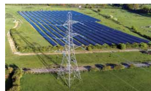
PTI ■ NEW DELHI

The Indian Energy Exchange's (IEX) total trade volume rose 26 per cent year-on-year to 10,893 million units in January 2024. It had recorded 8,639 million units (MU) trade volume in January 2023, the power exchange said in a statement. IEX achieved the highest-ever total volume in January at 10,893 MU, including 9,137 MU from the conventional power market segment, 236 MU from the green market segment, and 15.20 lakh RECs (equivalent to 1,520 MU) it added. In the Day-Ahead Market (DAM), the traded volume was 5,540 MU compared to 4,893 MU in January 2023, an increase of 13.2 per cent. The Real-Time Electricity Market (RTM) volume increased 13 per cent year-on-year to 2,380 MU in January from 2,102 MU in the same month last year.