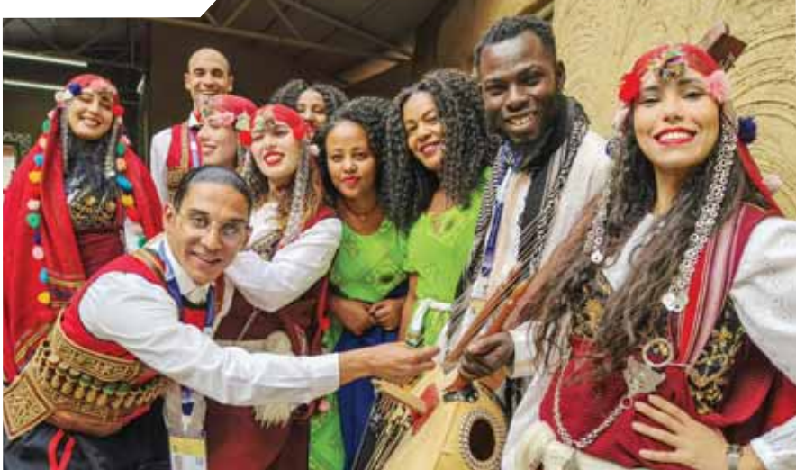
Folk artists from Gambia, Tunisia and Ethiopia during the Surajkund International Crafts Mela, in Faridabad