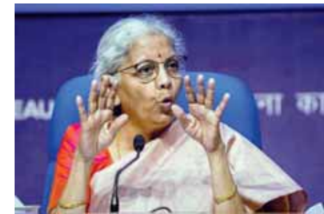
PTI ■ NEW DELHI

To bring down the debt burden, the government has taken various measures like increasing the tax revenue buoyancy, enhancing the public expenditure effectiveness, commitment to reducing fiscal deficit and augmenting the productive efficiency, Finance Minister Nirmala Sitharaman said on Monday. In addition to strengthening the financial system, the government has more than doubled its effective capital expenditure from Rs 6.57 lakh crore in 2020-21 to Rs 13.71 lakh crore and Rs 14.97 lakh crore in 2023-24 (BE) and 2024-25 (BE), respectively, to crowd in private investments, she said in the Lok Sabha. The government's emphasis on increasing capital expenditure will not only boost the investments, but also return a higher GDP growth to lower the debt burden, she said. Simultaneously, she said, the state governments have been incentivised to increase their capital spending through measures like 50-year interest-free capex loans and front-loading of tax devolution instalments. Various other measures like reduction of the corporate tax rate, liberalisation of foreign direct investment, and enhancement of ease of doing business have created supportive conditions for sustained growth in private investment, she said.