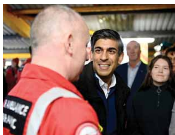
British Prime Minister Rishi Sunak visits Air Ambulance Northern Ireland at their headquarters in Lisburn, Northern Ireland.

Under power-sharing rules established as part of Northern Ireland's peace process, the administration in Belfast must include both British unionists and Irish nationalists. The UK and the Republic of Ireland both have roles as guarantors of the peace. The new administration is