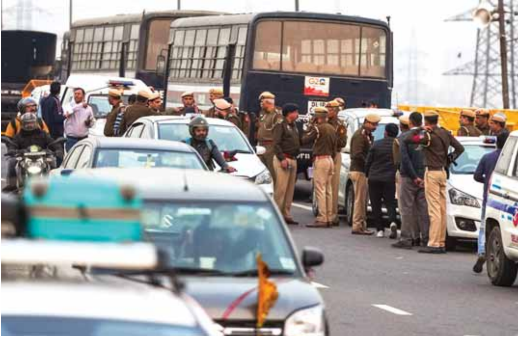
Security personnel deployed at Ghazipur border in view of farmers' Delhi Chalo March, in New Delhi, on Sunday. A large number of farmers from Uttar Pradesh, Haryana and Punjab are expected to march towards the national Capital on Tuesday

The Centre has invited representatives of the Samyukta Kisan Morcha (non-political) and the Kisan Mazdoor Morcha to hold another meeting to discuss their demands on February 12. Three Union Ministers — Piyush Goyal, Arjun Munda and Nityanand Rai, will hold talks with farmers' in Chandigarh. The meeting will be held at the Mahatma Gandhi State Institute of Public Administration in Sector 26. Meanwhile, Punjab Chief Minister Bhagwant Mann has accused the Haryana Government of creating a border "between Punjab and India", referring to the concrete blocks, nails and barbed wire placed on some roads to scuttle the farmers' proposed 'Delhi Chalo' march. He said the Manohar Khattar-led Haryana Government has placed as much barbed wire at the State's borders with Punjab as there is at the country's border with Pakistan. Khattar, however,