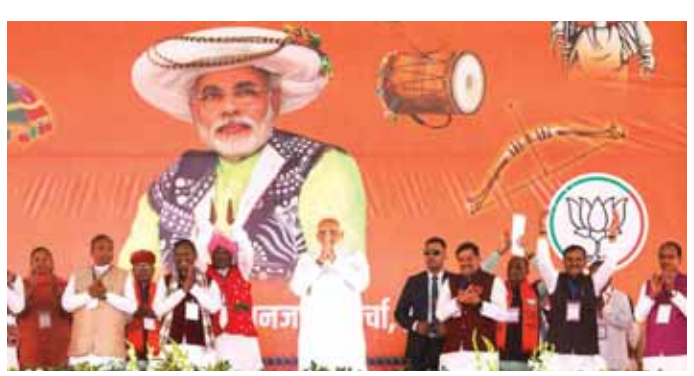
Prime Minister Narendra Modi with Madhya Pradesh Governor Mangu Bhai Patel, Chief Minister Mohan Yadav and others at the dedication and foundation stone laying ceremony of various development projects during Janjatiya Sammelan in Jhabua, Madhya Pradesh on Sunday

the Congress and its allies are resorting to last ditch-tactics, the PM said, adding that "loot and divide" is the motto of the Congress. "The Congress when it is in power indulges in loot, while out of power engineers divisions (in society) based on language, region and caste," he said here. The Congress has drowned in its own sins and the more it will make efforts to come up the further it will slide down, the PM asserted. It got decimated in the 2023 (Assembly polls) and will be wiped out in the upcoming Lok Sabha polls, he said. "The people showed the mirror to the Congress in the Assembly polls. The mood of the nation is similar in the upcoming Lok Sabha polls," Modi asserted. The PM asked voters to ensure