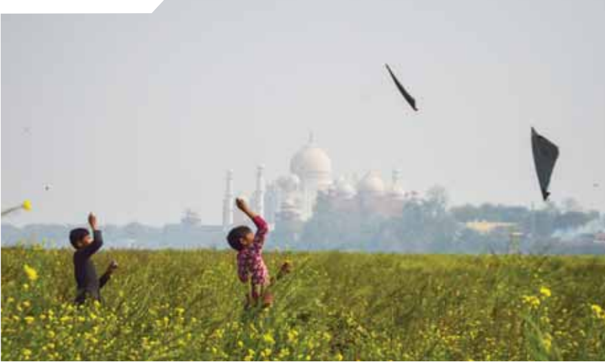
Children fly kites in a field in the backdrop of the Taj Mahal, in Agra