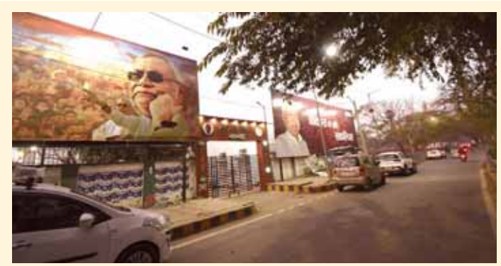
Deserted Janata Dal (United) office ahead of the floor test of Bihar Chief Minister Nitish Kumar-led Government in Patna on Sunday