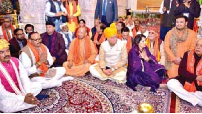
Uttar Pradesh Chief Minister Yogi Adityanath with Deputy Chief Ministers KP Maurya and Brajesh Pathak, UP Assembly Speaker Satish Mahana and State legislators during a visit to the Ram Temple in Ayodhya on Sunday