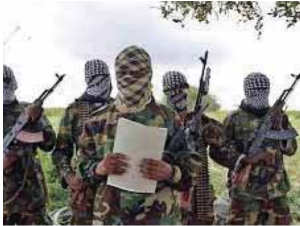
guard present. WAM identified the dead as a colonel, two warrant officers and a corporal.

Early Sunday, the UAE's state-run WAM news agency reported the killing of three of its troops and the Bahraini officer in a "terrorist act". A fourth later died en route back to the Emirates, WAM reported. WAM released footage of three flag-draped caskets coming off of an Emirati Boeing C-17A Globemaster III at Al Bateen Executive Airport in Abu Dhabi with an honour