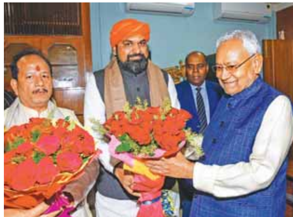
Bihar Chief Minister Nitish Kumar being greeted by his deputies Vijay Kumar Sinha and Samrat Choudhary after Kumar-led NDA Government in the State won a vote of confidence during the first day of Budget session of the Assembly in Patna.

The newly formed Nitish Kumar-led NDA Government in Bihar won the trust vote in the State Assembly on Monday, amid a walkout by members of the Mahagathbandhan led by RJD leader and former Deputy Chief Minister Tejashwi Yadav. In the 243-member Bihar Vidhan Sabha, a total of 129 members voted in favour of the motion of confidence. Deputy Speaker Maheshwar Hazari presided over the session as Speaker Awadh Bihari Chaudhary, a member of the RJD, was removed through a resolution. Chaudhary had refused to step down despite his party losing power a fortnight ago. After declaring the motion as passed through a voice vote, Hazari ordered a headcount following a request from Parliamentary Affairs Minister Vijay Kumar Chaudhary, which was seconded by Chief Minister Nitish Kumar. To facilitate the floor test, Chaudhary was removed with 125 members voting in favour of the no-confidence motion moved against him by the ruling NDA. Only 112 members voted against the motion. Kumar recently abandoned the Mahagathbandhan, of which the RJD was a key constituent, and returned to