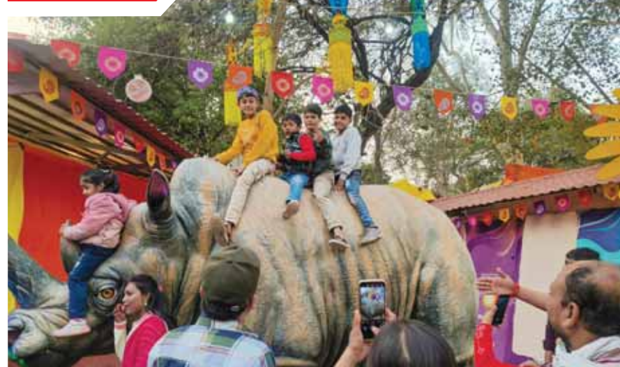
Visitors pose for photos with a model of rhinoceros at the 37th Surajkund International Crafts Mela, in Faridabad