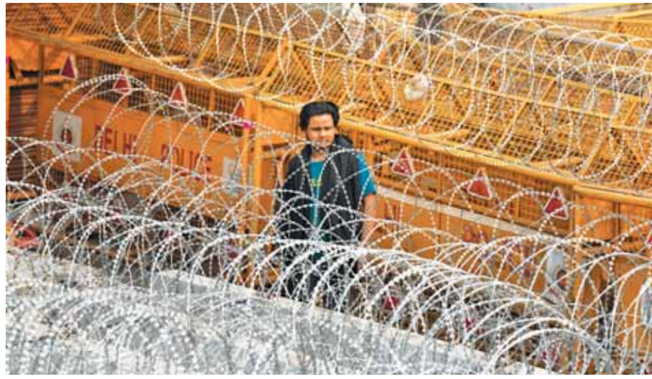
Multi-layered barricading in place at Singhu Border ahead of the scheduled 'Delhi Chalo' march by the farmers in New Delhi on Monday.

processions, or rallies, as well as the entry of tractor trolleys carrying people, in the national capital. The Delhi Police has imposed Section 144 for a month in anticipation of widespread tension and "social unrest" due to the farmers' "Delhi Chalo March".