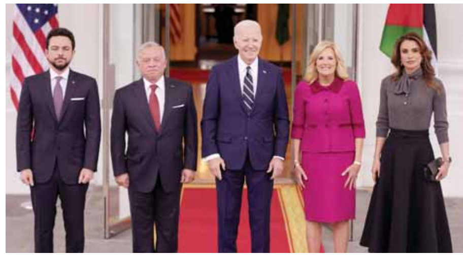
President Joe Biden, center, and first lady Jill Biden, second right, pose for a photo upon greeting Jordan's King Abdullah II, second left, Queen Rania, right, and Crown Prince Hussein, left, on the North Portico of the White House on Monday.

"The key elements of the deal are on the table," Biden said alongside the king, though "there are gaps that remain." He