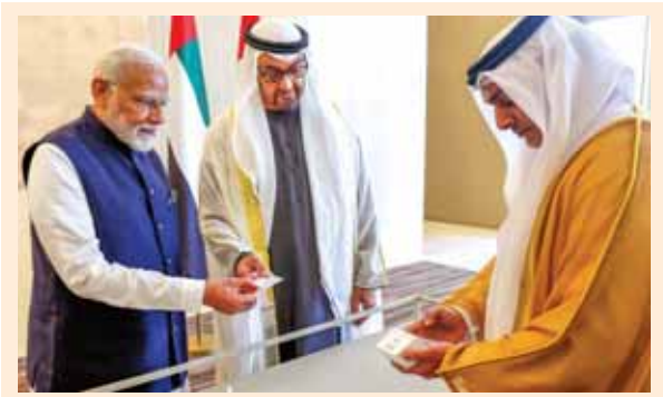
Prime Minister Narendra Modi and UAE President Mohamed bin Zayed Al Nahyan witness a transaction made using the JAYWAN card, based on India's digital RuPay credit and debit card stack, in Abu Dhabi, UAE