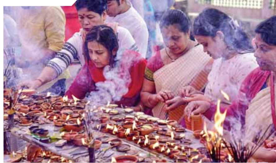
Devotees light lamps on the occasion of 'Ganesh Jayanti' at Latashil Ganesh Mandir, in Guwahati