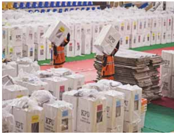
Workers arrange ballot boxes prepared for the Feb. 14 election at a stadium in Jakarta, Indonesia, Tuesday.

Outgoing President Joko Widodo's foreign policy has avoided criticising either Beijing or Washington, but also rejected alignment with either power. The delicate balancing act has paved the way for substantial Chinese trade and investment for Indonesia, including a USD 7.3 billion high-speed railway that was largely funded by China, while Jakarta has also boosted