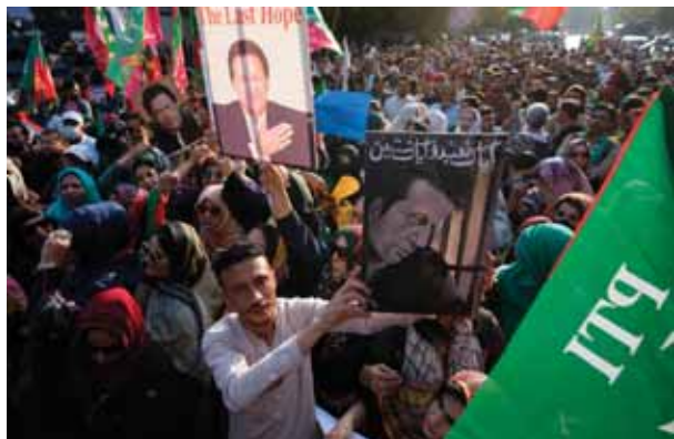
Pakistan's former Prime Minister Shehbaz Sharif gestures during a press conference regarding parliamentary elections, in Lahore, Pakistan on Tuesday.

None of the three major parties, the PML-N, the PPP, or the PTI have won the necessary seats in the February 8 general elections to secure a majority in the National Assembly and,