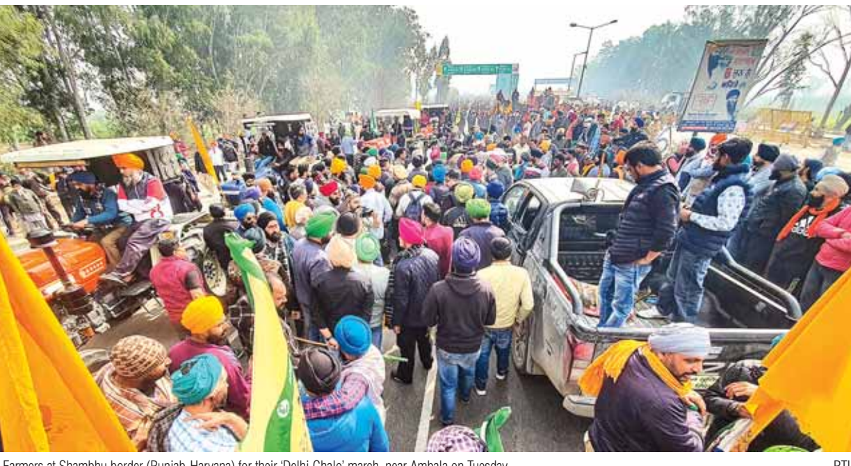
Farmers at Shambhu border (Punjab-Haryana) for their 'Delhi Chalo' march, near Ambala on Tuesday

The Chaos erupted at the Punjab-Haryana (Shambhu) and Jind borders on Tuesday as protesting farmers began removing barricades. In response, the Haryana Police fired rounds of tear gas and water cannons. Tear gas shells, some dropped from drones, were lobbed by police in the face-off that lasted several hours at the Shambhu border near Ambala in Haryana. The Haryana Police also used tear gas canisters and water cannons against protesters at the Jind district border. The farmers, in their attempts to breach the barricades near the Punjab-Haryana border, were pushed back by the police, who used drones to drop tear gas shells to prevent any escalation. Upon the police firing tear gas shells, protesters swiftly covered them with wet jute bags to mitigate the smoke. Meanwhile the only takeaway from the inconclusive Centre-farmers organisations meetings is that the Union Government has agreed to withdraw the cases against the farmers registered during the 2020-21 agitation. After a five-hour-long meeting in Chandigarh late on Monday, chaired by Union Ministers Piyush Goyal and Arjun Munda, farmer organisations' key demands for a legal guarantee of minimum support price (MSP) for crops