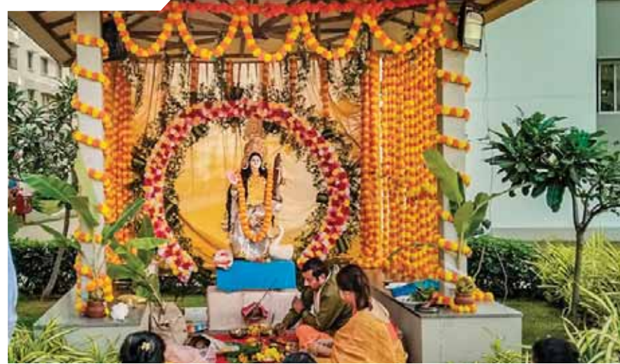
Devotees offer prayers to Goddess Saraswati on the occasion of 'Saraswati Puja' festival, in Bengaluru