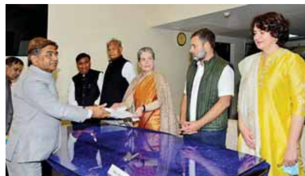
Congress leader Sonia Gandhi files her nomination papers for the upcoming Rajya Sabha polls at Rajasthan Assembly, in Jaipur on Wednesday. Congress leaders Rahul Gandhi, Priyanka Gandhi Vadra and Ashok Gehlot are also seen

Virtually indicating her retirement from electoral politics, UPA Chairperson and longest-serving Congress president Sonia Gandhi filed her nominations on Wednesday to enter the Rajya Sabha. Alongside, top BJP leaders including party chief JP Nadda were nominated from Gujarat at this time, as his current RS seat in Himachal Pradesh will be vacant. Union Ministers Ashwini Vaishnaw and L Murugan, among others, also received the green signal from the BJP for re-election from Odisha and Madhya Pradesh, respectively. With Nadda and Vaishnaw announced as candidates for the council of States, the speculation about their contesting Lok Sabha elections comes to an end. Nadda was expected to shift from Himachal Pradesh, while Vaishnaw from either Rajasthan or Odisha. Nadda currently holds a Rajya Sabha seat from Himachal Pradesh, but the BJP lacks the numbers to win a seat from the Congress-ruled State. Former Maharashtra CM Ashok Chavan, who recently left the Congress to join the BJP, was nominated from Maharashtra to represent the party in the Council of States. The elections for which are scheduled for February 26, with February 15 being the last date for nominations. Alongside Sonia, senior party leaders Ajay Maken and Abhishek Singhvi were also named by the party for the