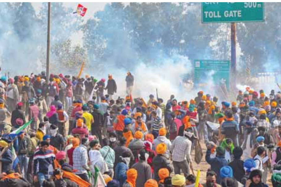
Farmers face tear gas used by the police to disperse them during the second day of their 'Delhi Chalo' march, at the Punjab-Haryana Shambhu border near Patiala on Wednesday